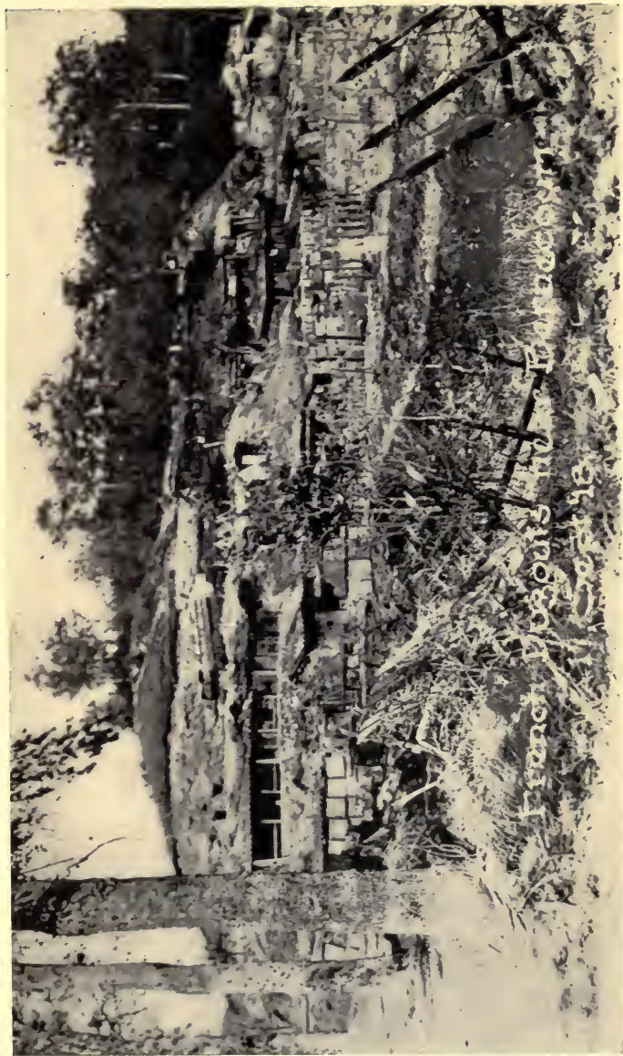
FRENCH DUGOUTS NEAR BERNÉCOURT