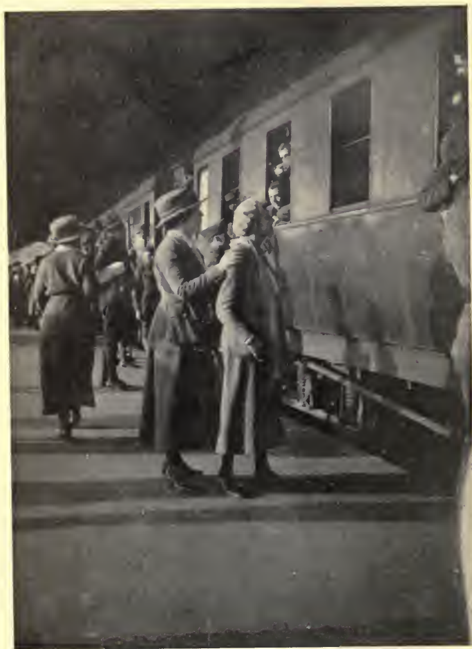
AT THE AIX RAILWAY STATION: SOLDIERS RETURNING TO THE TRENCHES