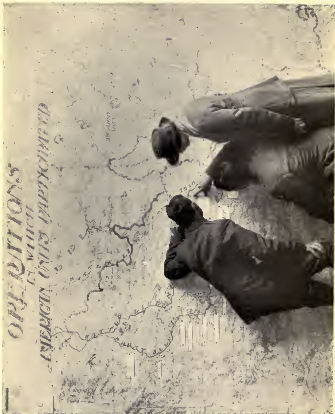
A "RECOLLECTION" MAP