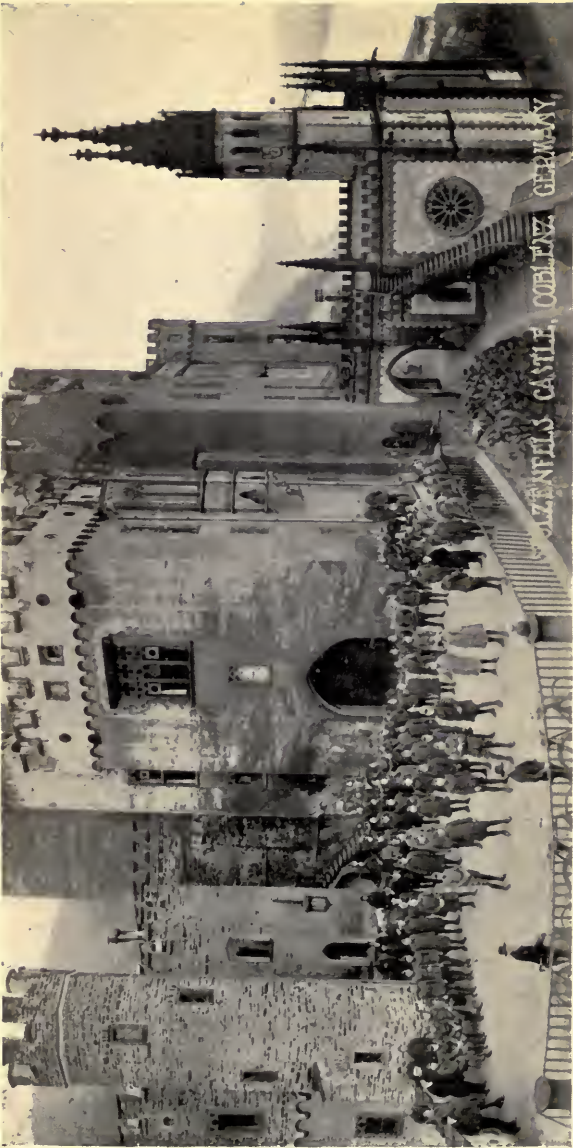
A "Y" SIGHTSEEING TRIP TO THE KAISER'S CASTLE ON THE RHINE