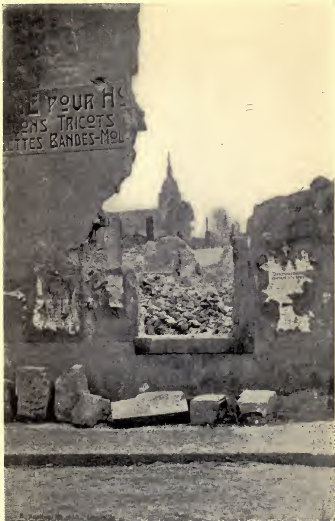
BACCARAT. EN ROUTE TO THE CANTEEN.