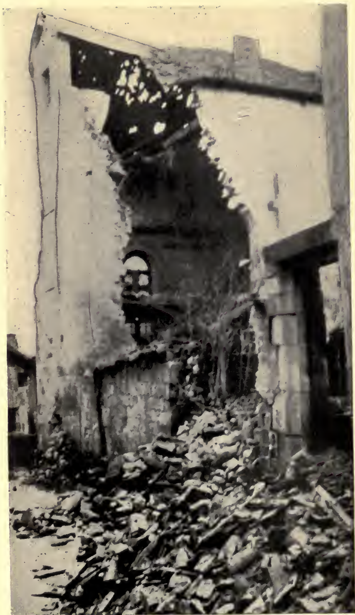
THE PROSPECT FOR A CANTEEN IN THE FINEST HOUSE IN TOWN