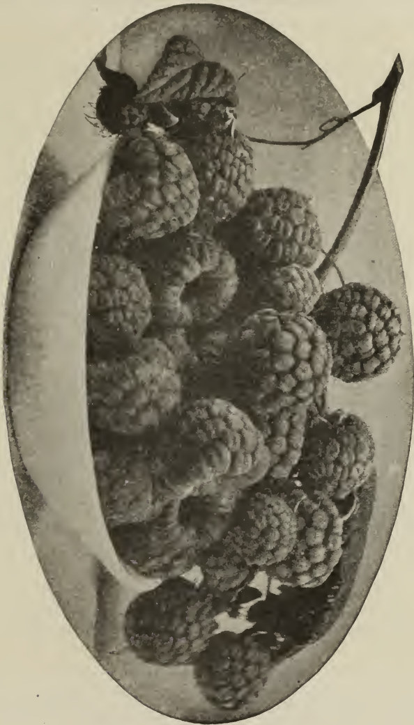
EATON RED RASPBERRY.