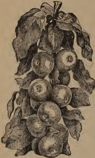
WINTER BANANA APPLE

Everything guaranteed first class in every way. Our new Catalog is now ready and will be mailed free to all applicants. See address below.