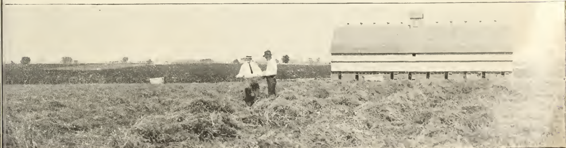
Red Clover on the Funk Farms