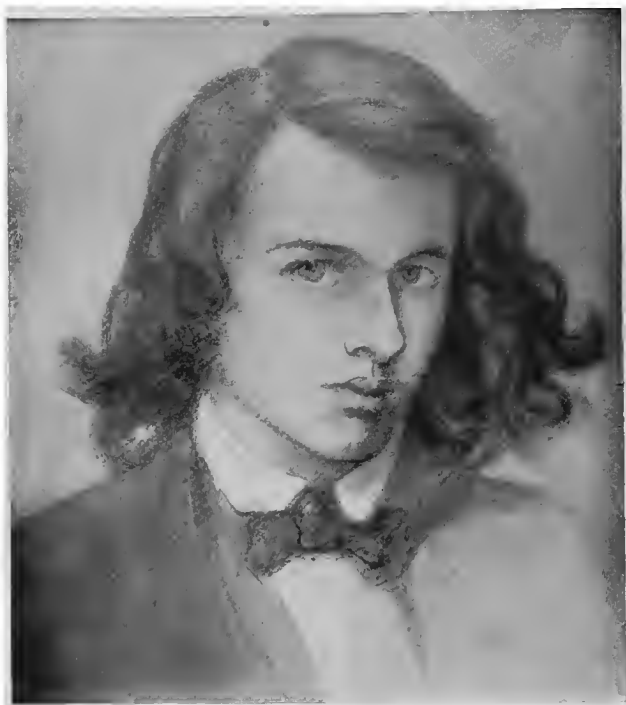
DANTE GABRIEL ROSSETTI

From the drawing by himself in the National Portrait Gallery