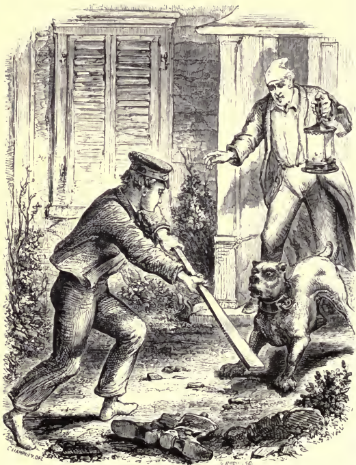
Tom's Battle at Midnight. Page 75.