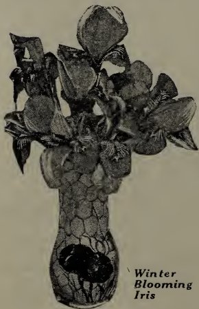
Winter Blooming Iris

These remarkable Iris belong to the genus Unguicularis and are winter bloomers, the flowers often showing above an inch or more of snow. The plants have long grass foliage and are the most continuous bloomers of any Iris—the "cut and come again