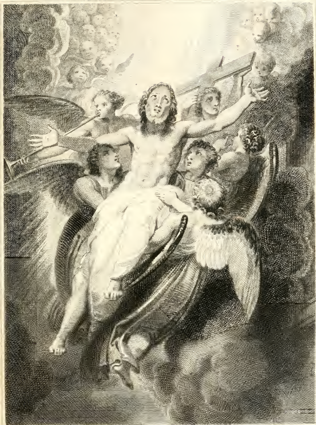
T. Stothard R.A. del.