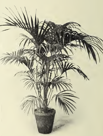
Kentia Belmoreana ("made-up")