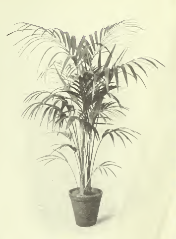
Kentia Forsteriana (8-inch pot, "made-up")

All measurements given are from top of pot to top of plant, standing naturally