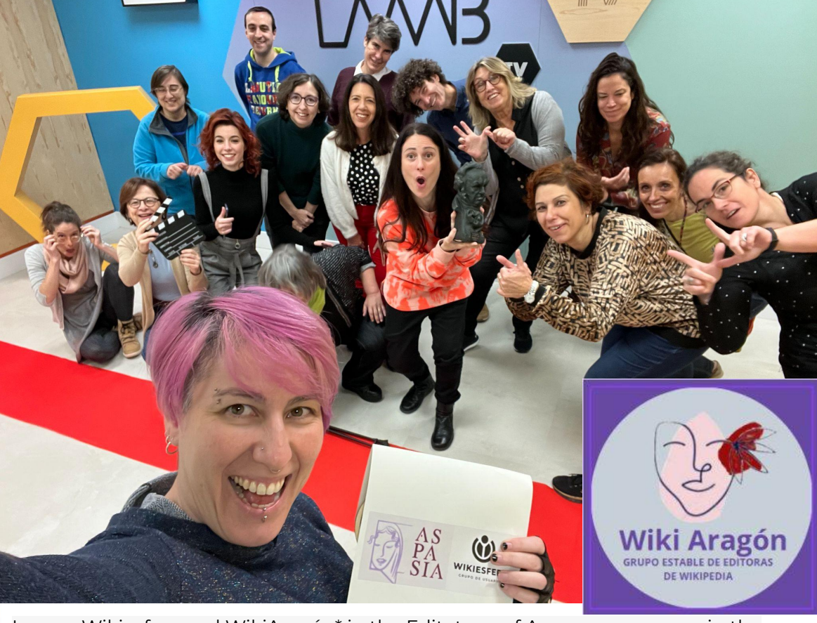
Image: Wikiesfera and WikiAragón* in the Editatona of Aragonese women in the performing arts (Zaragoza, Spain).