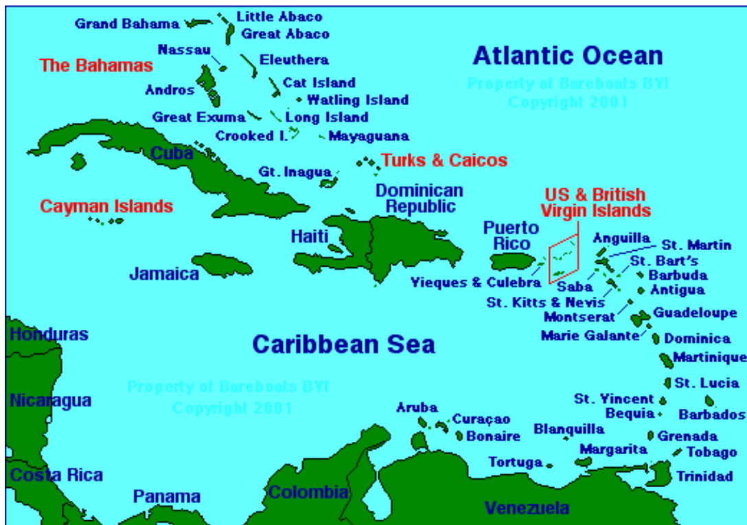
Figure 1. The Caribbean Sea