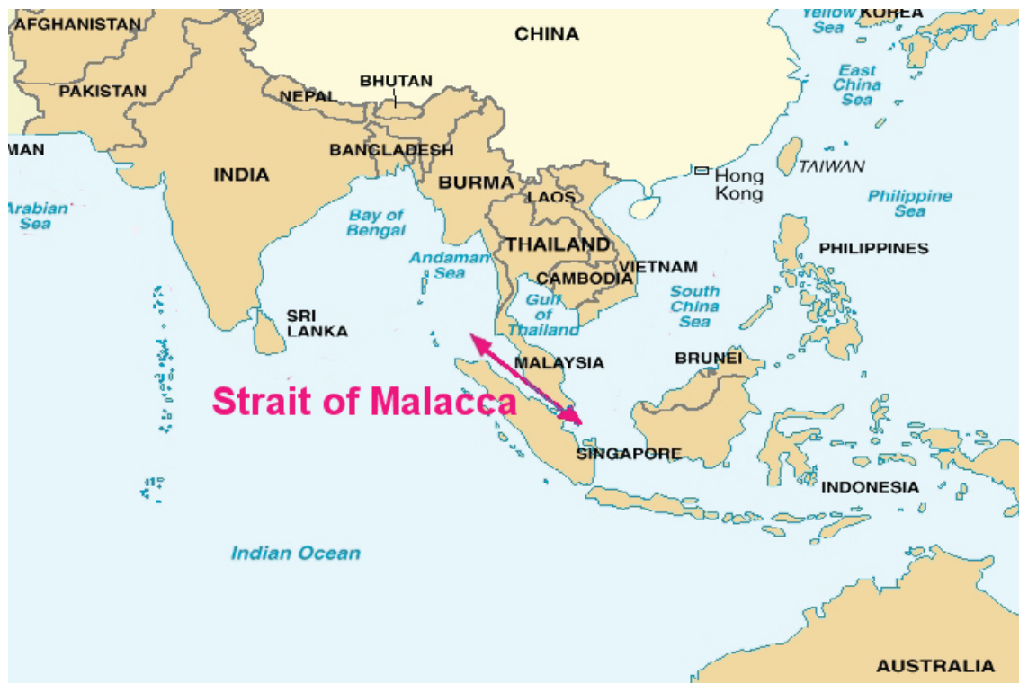
Figure 2. Strait of Malacca 97