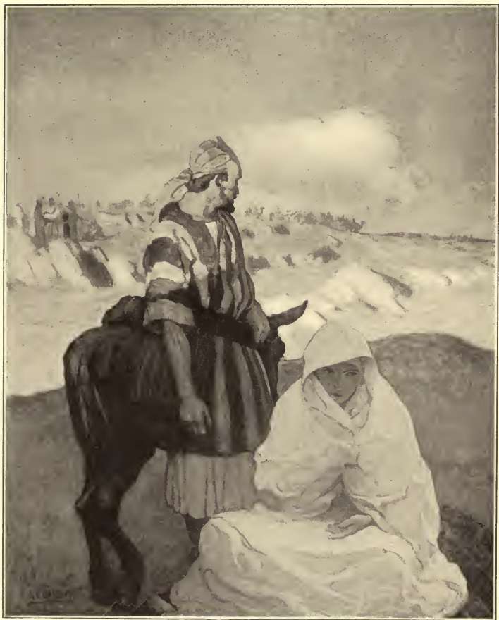
Behind them streamed the mingled traffic of a road that led to a great city