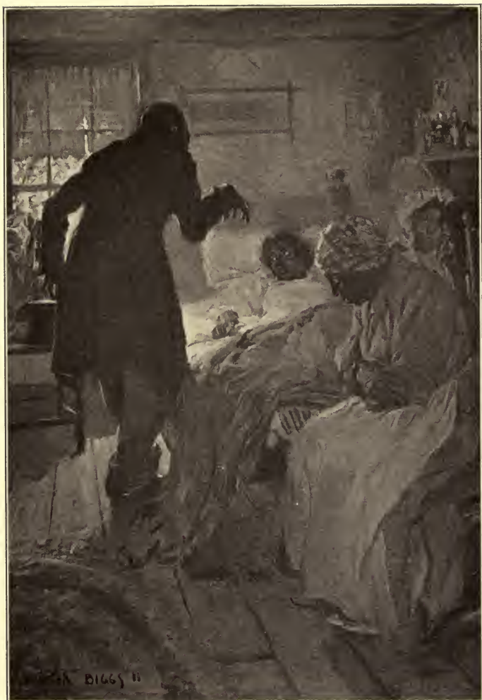
At the moment he was making slow passes with his hands