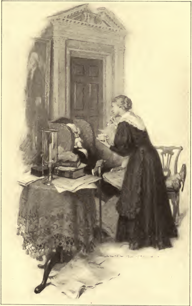
She treated him as an indulgent mother treats a feeble child