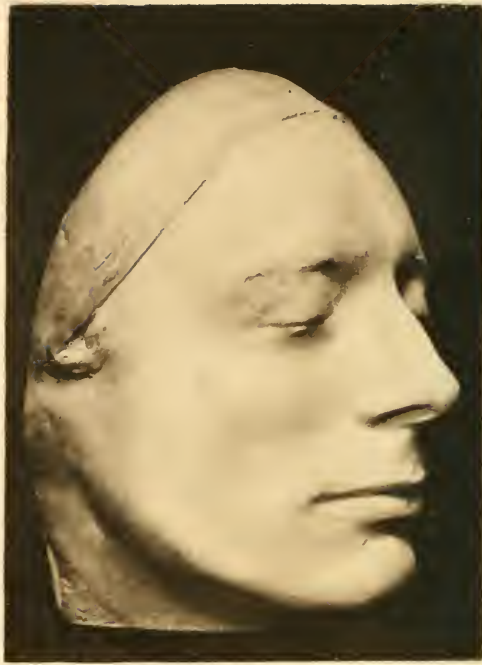
View of Head taken during life