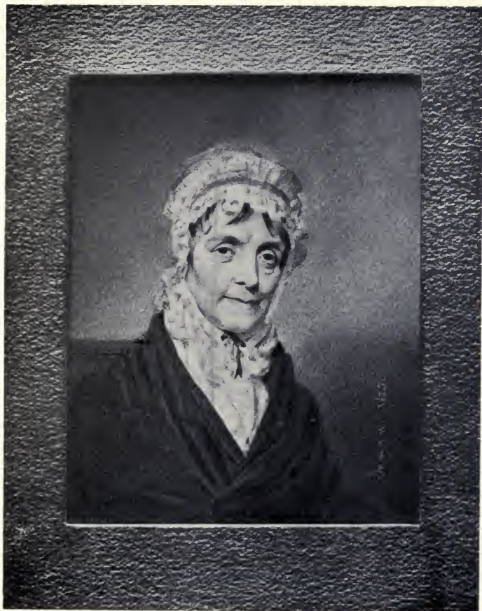
Mrs. Alexander Hamilton