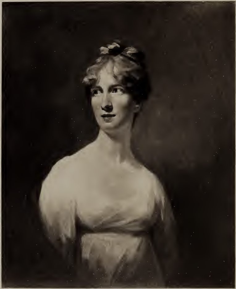
A. W. Elson & Co., Boston