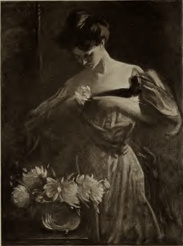
A. W. Elsen & Co., Boston.