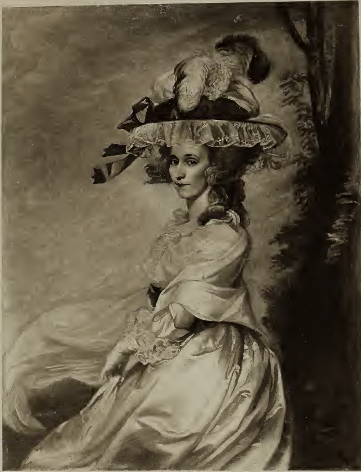
A. W. Elson & Co. Boston