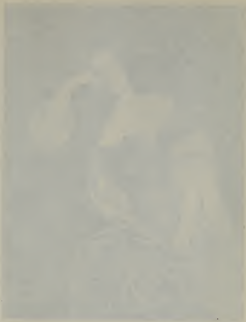
Portrait of the Duchess of Portland [7] SIR PETER LELY