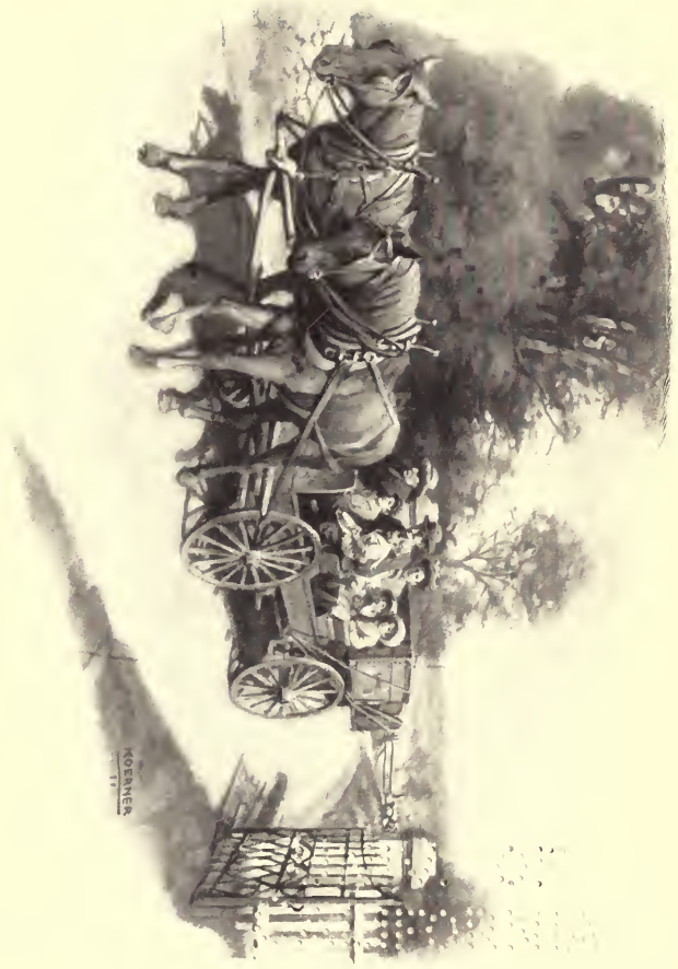
THREE DAYS LATER I DROVE TO THE VILLA