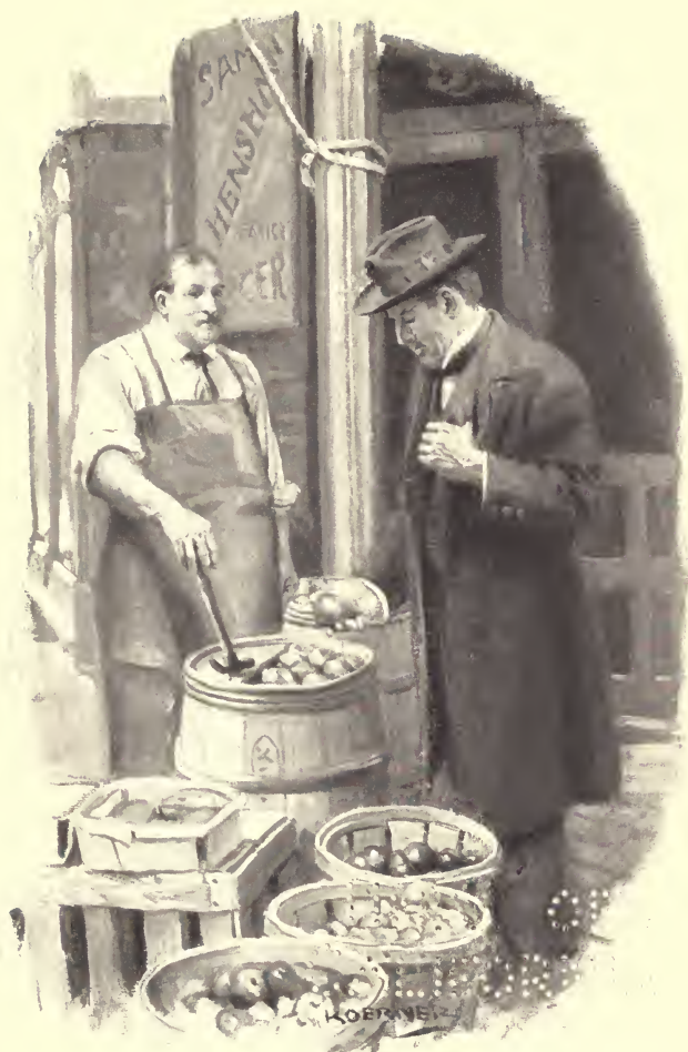
"SEVEN DOLLARS A BARREL"