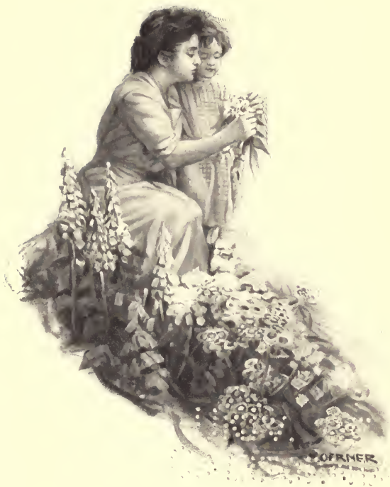
THE BOY EXERTED HIS CHARMS UPON MY LADY WARBURTON