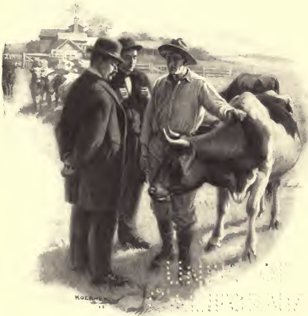
WE SET OUT FOR A TRAMP OVER THE BIG FARM