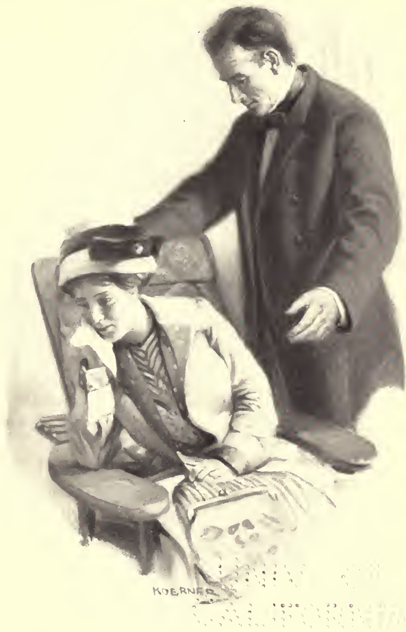
LIZZIE DROPPED INTO A CHAIR AN' BEGAN TO CRY