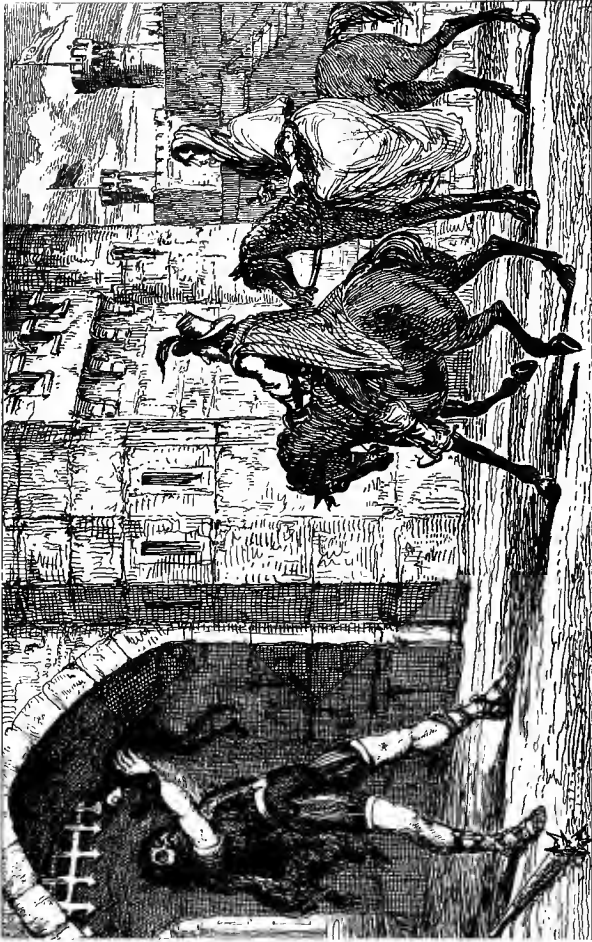
Dickie Sledge and the Great Point