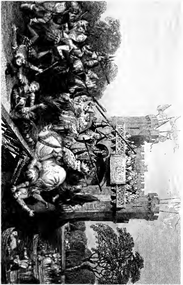
The Massacre of the Innocents