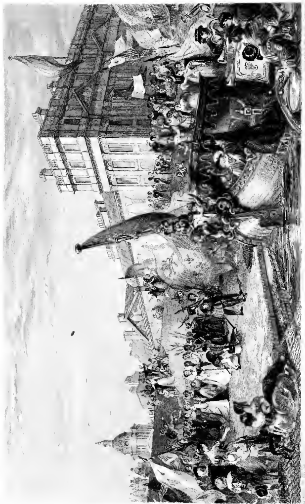
Queen Elizabeth at Greenwich Hospital