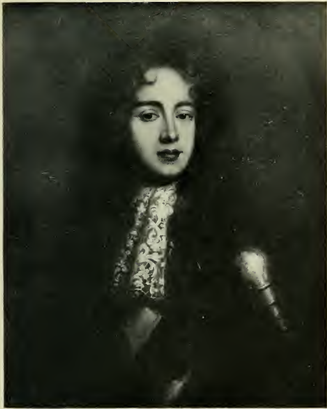
after the picture by William Wissing in the National Portrait Gallery.