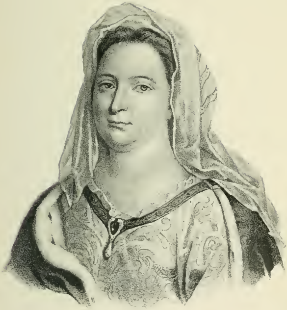
After a contemporary picture. MADAME DE MAINTENON.