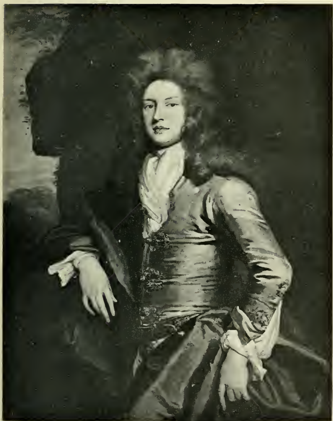
From a photo by Emery Walker, after the picture by Sir Godfrey Kneller in the National Portrait Gallery.