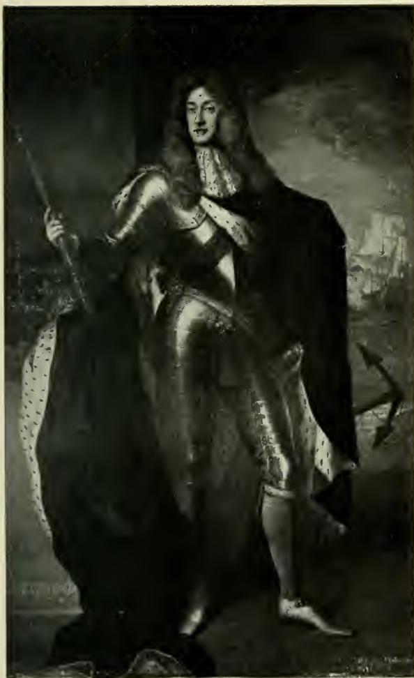
From a photograph by Emery Walker, after the painting in the National Portrait Gallery by Sir Godfrey Kneller.