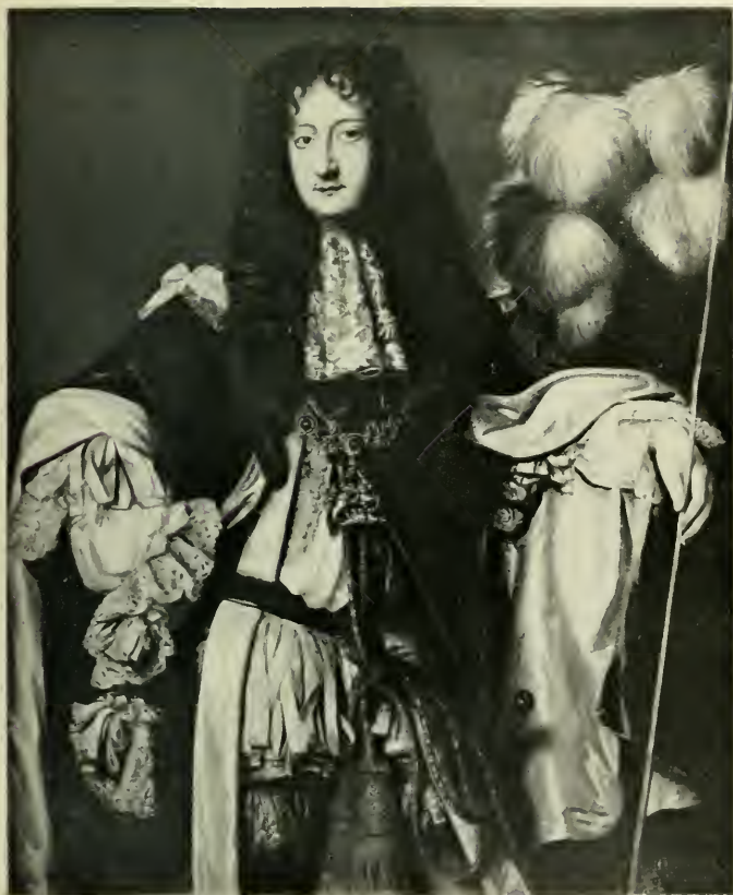
after the picture by Sir Godfrey Kneller in the National Portrait Gallery.