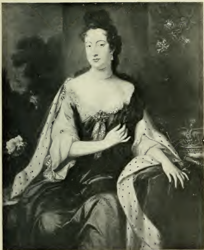
after the picture by William Wissing in the National Portrait Gallery.