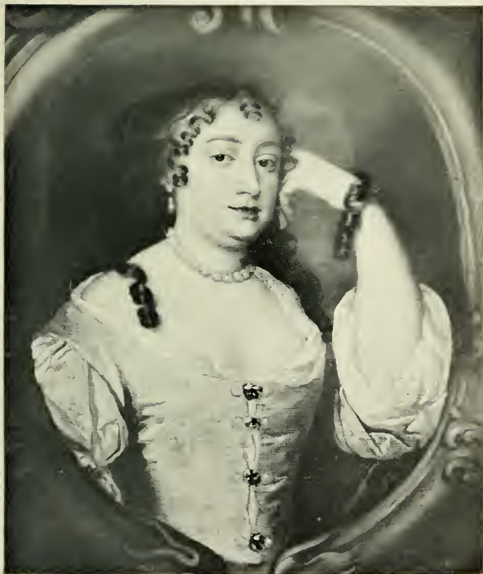
after the picture by Sir Peter Lely in the National Portrait Gallery.