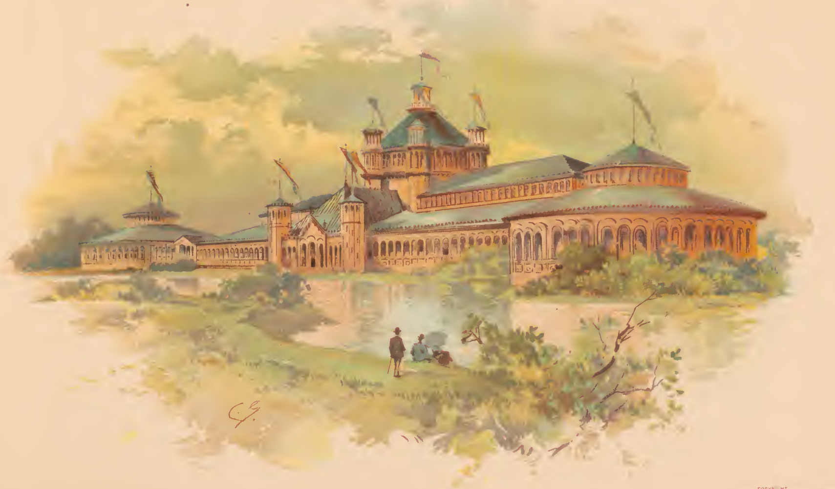
FISHERIES AND AQUARIUM.