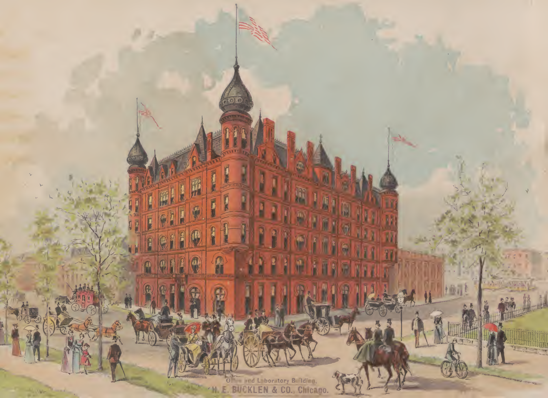
Old and Laboratory Bldg. N. E. BUCKLEN & CO., Chicago.