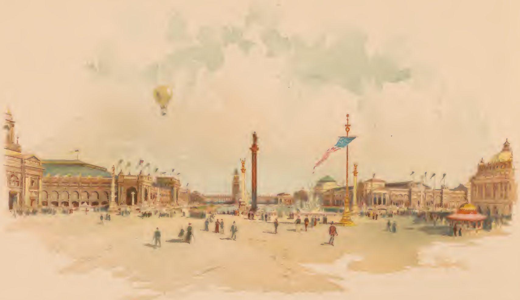
THE GRAND COURT.

DESIGNED BY THE WINTERS ART LITHO CO., LONDON.