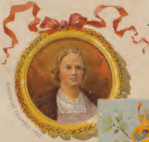
CHRISTOPHE COLUMBUS 1492.