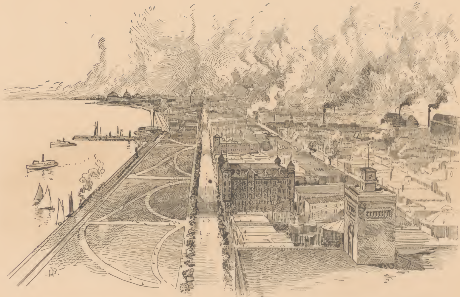
BIRDSEYE VIEW OF LAKE FRONT AND H. E. BUCKLEN & CO.'S LABORATORY BUILDING.