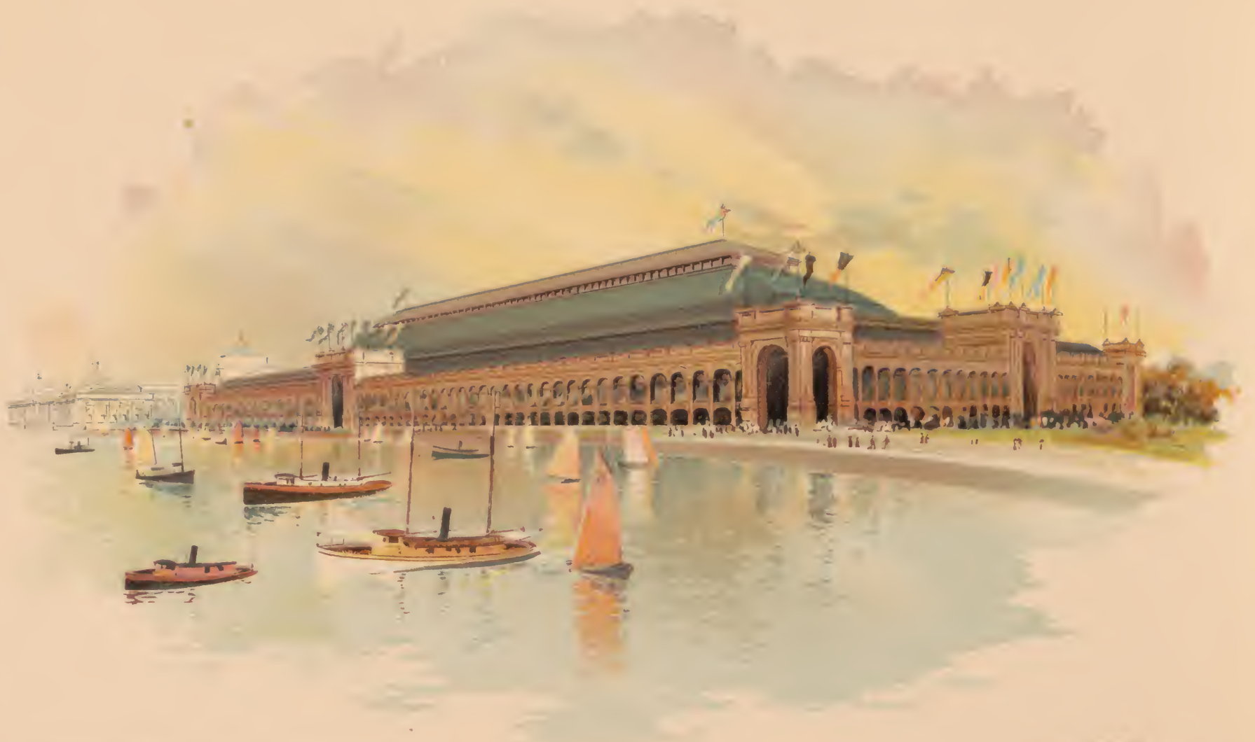
MANUFACTURES AND LIBERAL ARTS BUILDING.