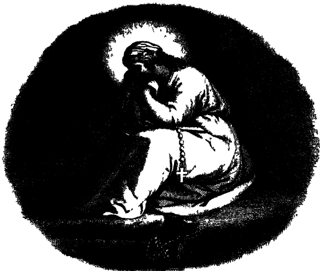
ST. EUSTOCHIUM, VIRGIN.

Steele's Edition, in Twelve Volumes, embellished with Engravings.