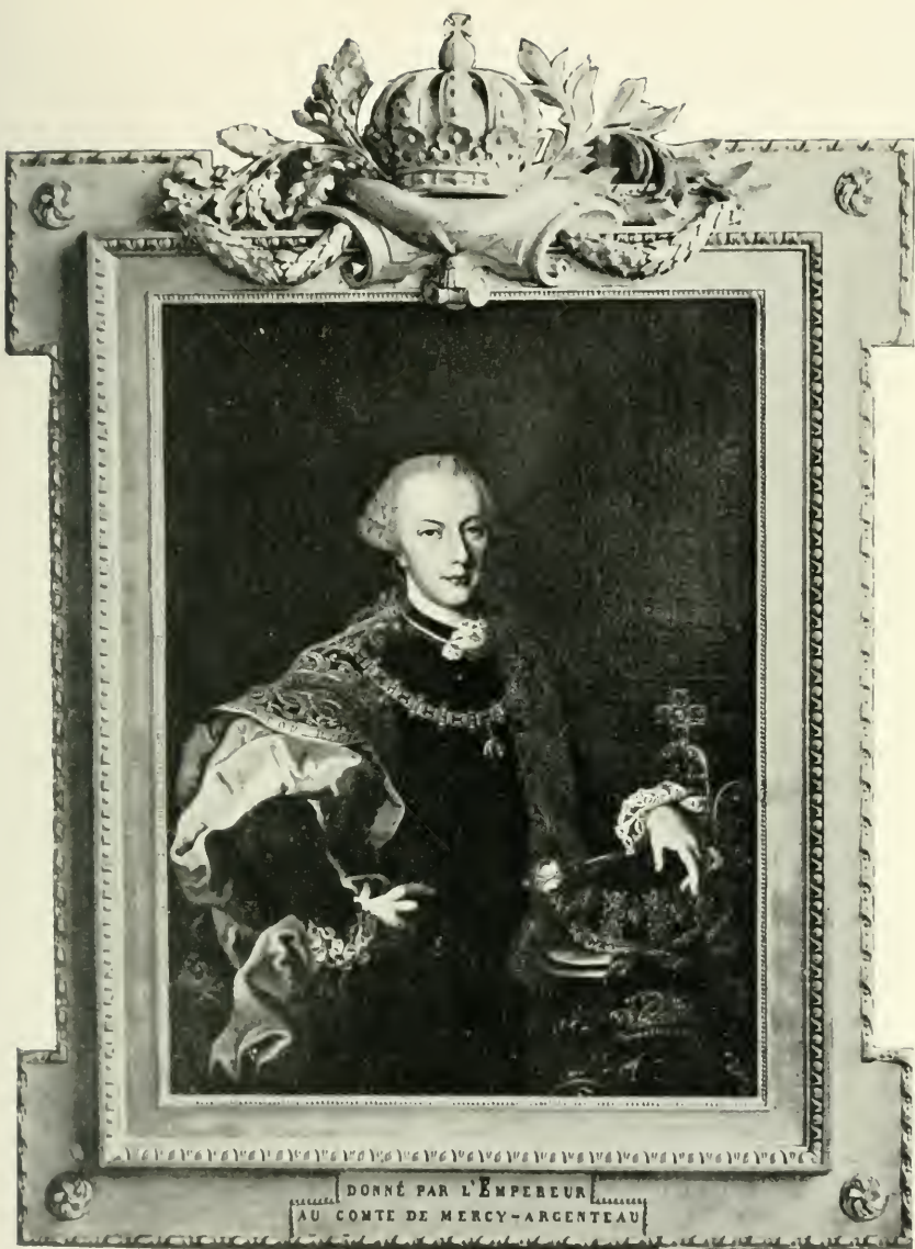
JOSEPH II., EMPEROR OF AUSTRIA.

(From the portrait given by the Emperor to the Comte de Mercy-Argenteau.)