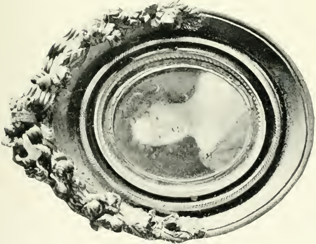
THE DUCHESSE DE MAZARIN.

(From the miniature at the Chateau d'Argenteau.)