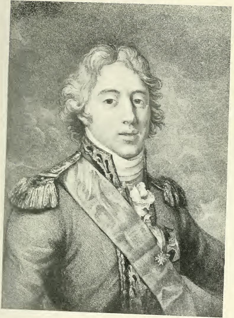
THE COMTE D'ARTOIS.