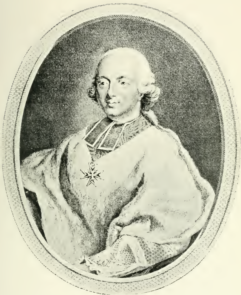
LOUIS RENÉ ÉDOUARD CARDINAL DE ROHAN.