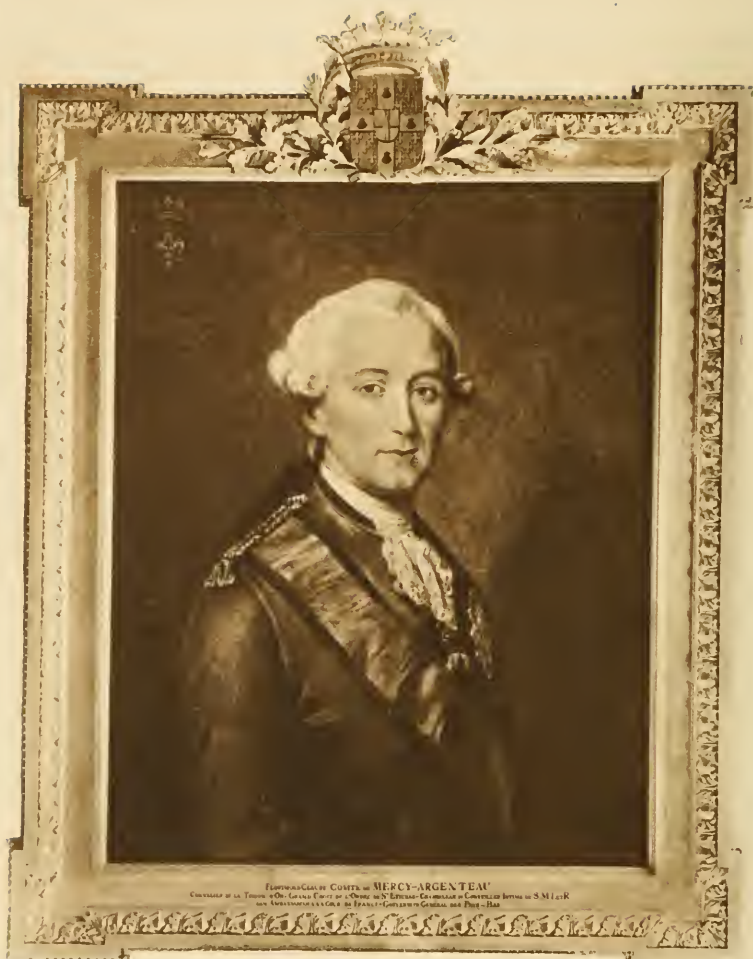
FLORIMOND CLAUDE COMTE DE MERCY-ARGENTEAU CHEVALIER DE LA TOISON D'OR. GRAND CROIX DE L'ORDRE DE S T ETIENNE. COMMISSAIRE EN CHEF DE LA COUR DE S. M. L'EMPEREUR AMBASSADEUR A LA COUR DE FRANCE. COMTE DE GENTIN ET DE PIERRE. BARON