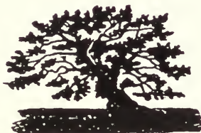
The Charter Oak.

by hundreds of the skeleton victims of southern barbarism, who here learned to forget the horrors of their long imprisonment amid the kindly graces and sympathetic attentions of Christian ladies.