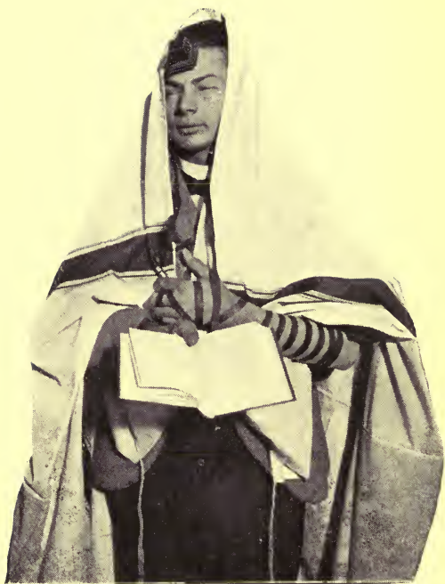
JEW WEARING THE TALLITH