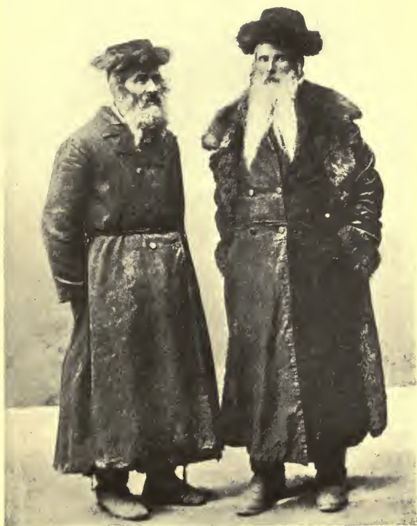
JEWS OF LEMBERG