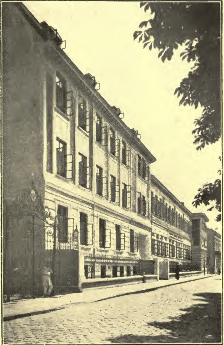
MISSION SCHOOL, BUCHAREST