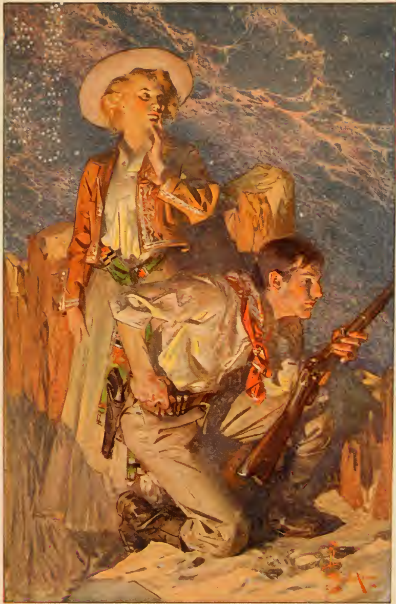
HIS EYES WERE INTENT UPON THE DARK HORIZON