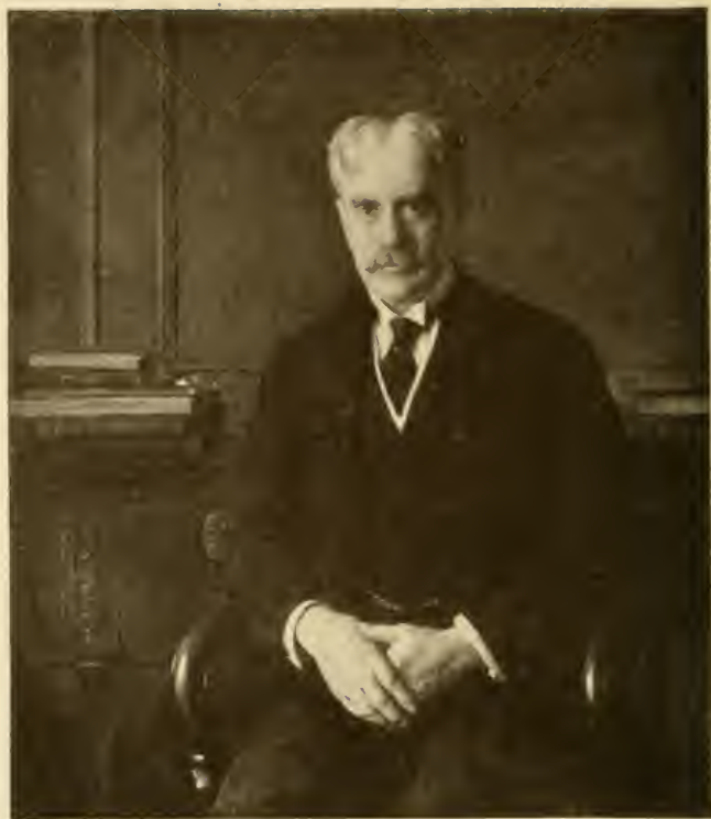
PREMIER BORDEN By Joseph De Camp