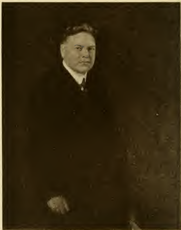
HERBERT HOOVER By Edmund C. Tarbell, N.A.