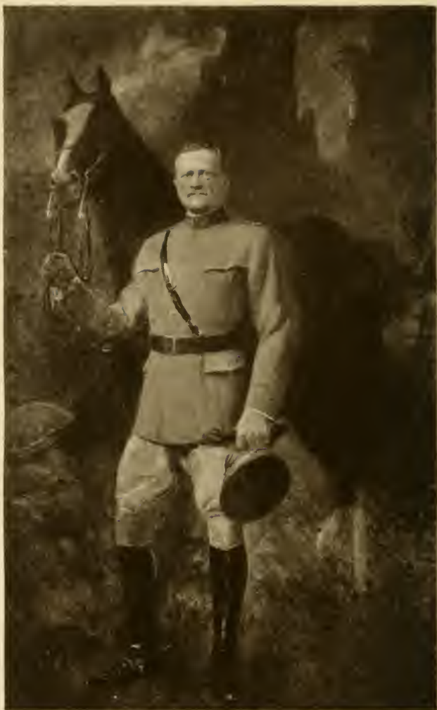
GENERAL PERSHING (Photographed before completion) By Douglas Volk, N.A. Presented by the City of Cincinnati