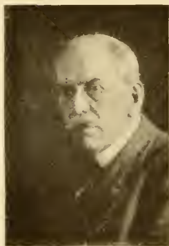
Joseph De Camp

CECILIA BEAUX. Born in Philadelphia. Pupil of William Sartain, Philadelphia; Julian and Lazar Schools, Paris. Member: National Academy of Design 1902; National Association of Portrait Painters; Societ e des Beaux Arts, Paris. Awards: Mary Smith prize 1885, 1887, 1891, 1892 and Temple gold medal 1900 at Pennsylvania Academy of the Fine Arts, Philadelphia; gold medal, Philadelphia Art Club 1893; Dodge prize 1893, Saltus medal 1914, Proctor portrait prize 1915 at National Academy of Design, New York; bronze medal 1896 and gold medal 1899, Carnegie Institute, Pittsburgh; gold medals Paris Exposition 1900, Pan-American 1901, and St. Louis Exposition 1904; Medal of Honor, Panama-Pacific Exposition 1915. Work in museums: Pennsylvania Academy, Metropolitan, Toledo.