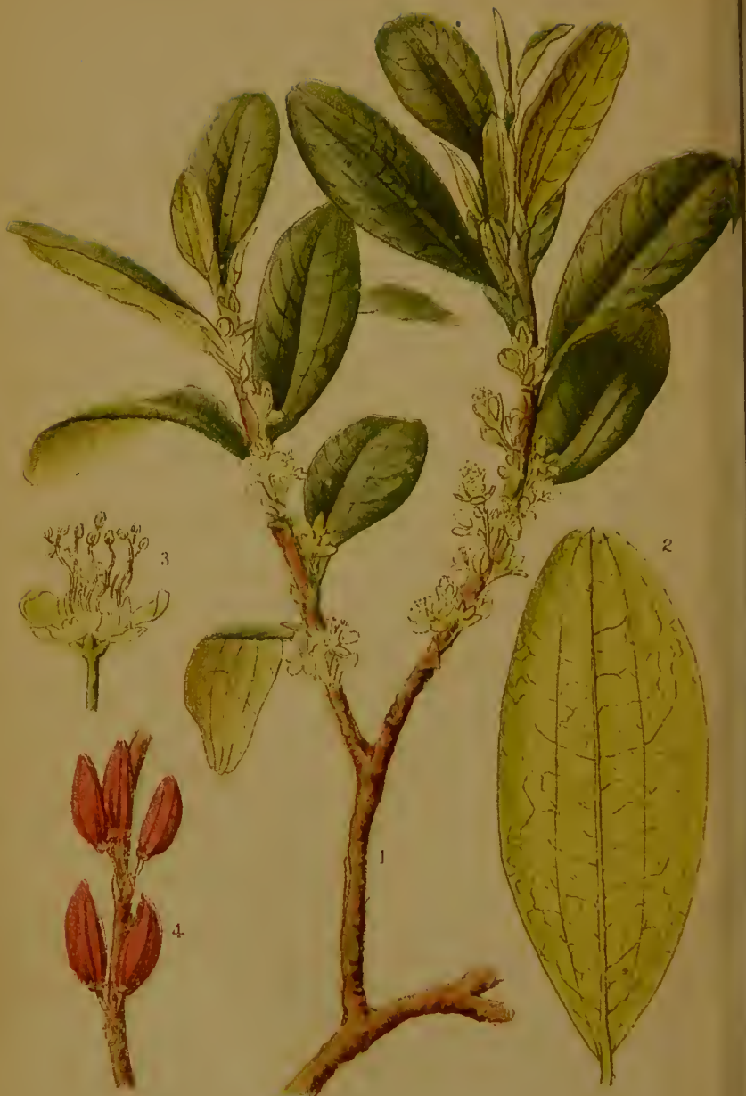
1 ERYTHROXYLON COCA 2 _BACK OF LEAF (Full size) 3 _FLOWER (enlarged.) 4 _FRUIT