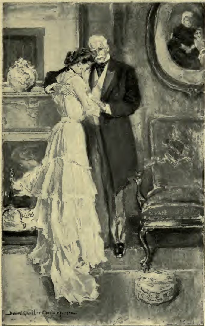
“FOR MY ROSE’S CHILD,’ HE SAID, GENTLY”