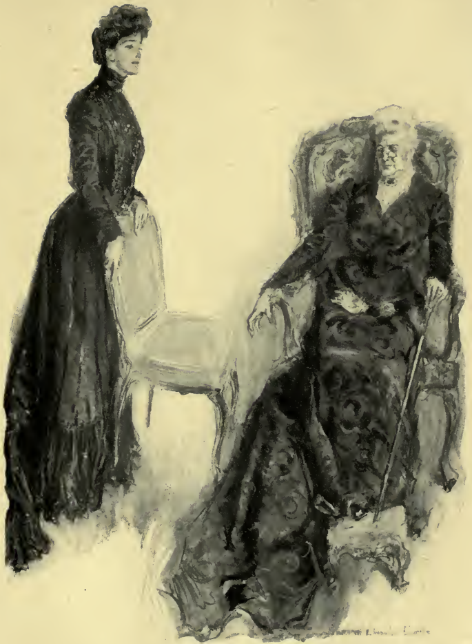
"LADY HENRY GASPED. SHE FELL BACK INTO HER CHAIR"