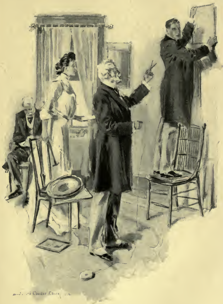
"HE ENTERED UPON A MERRY SCENE"