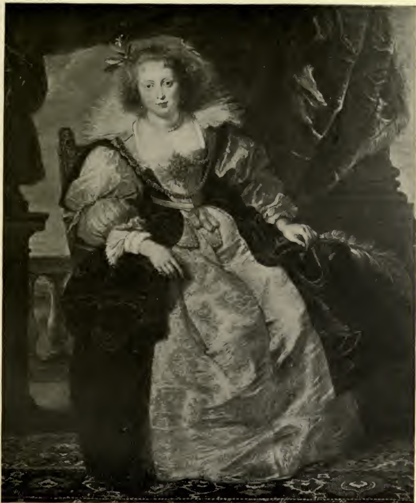
Portrait by Rubens