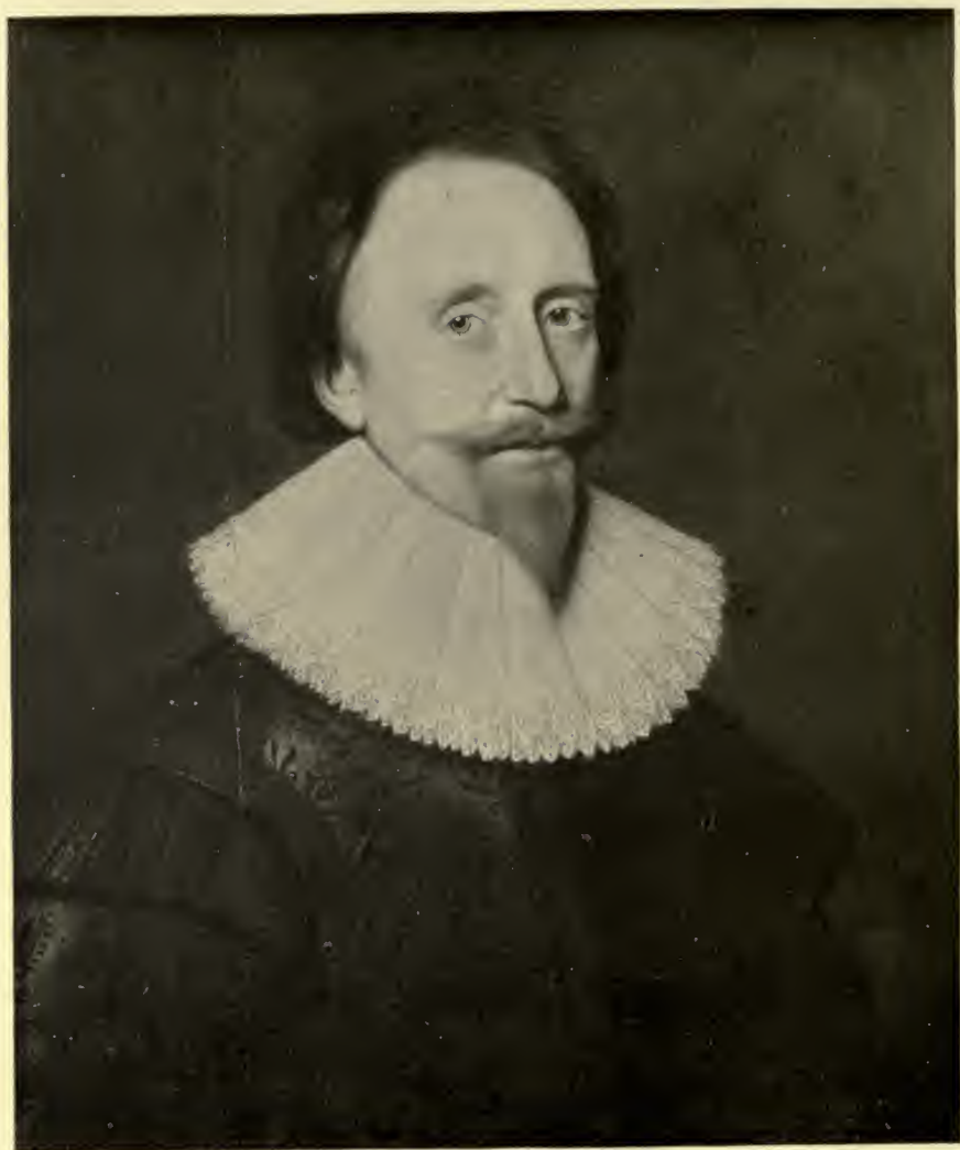
Portrait by C. Janssen van Ceulen