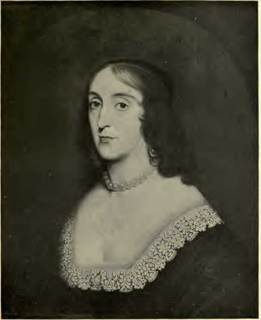
Portrait by Gerard Honthorst