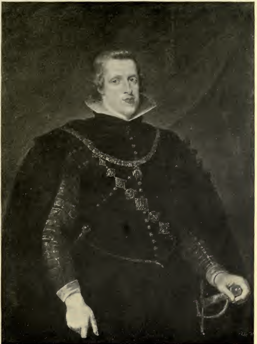
Portrait by Rubens