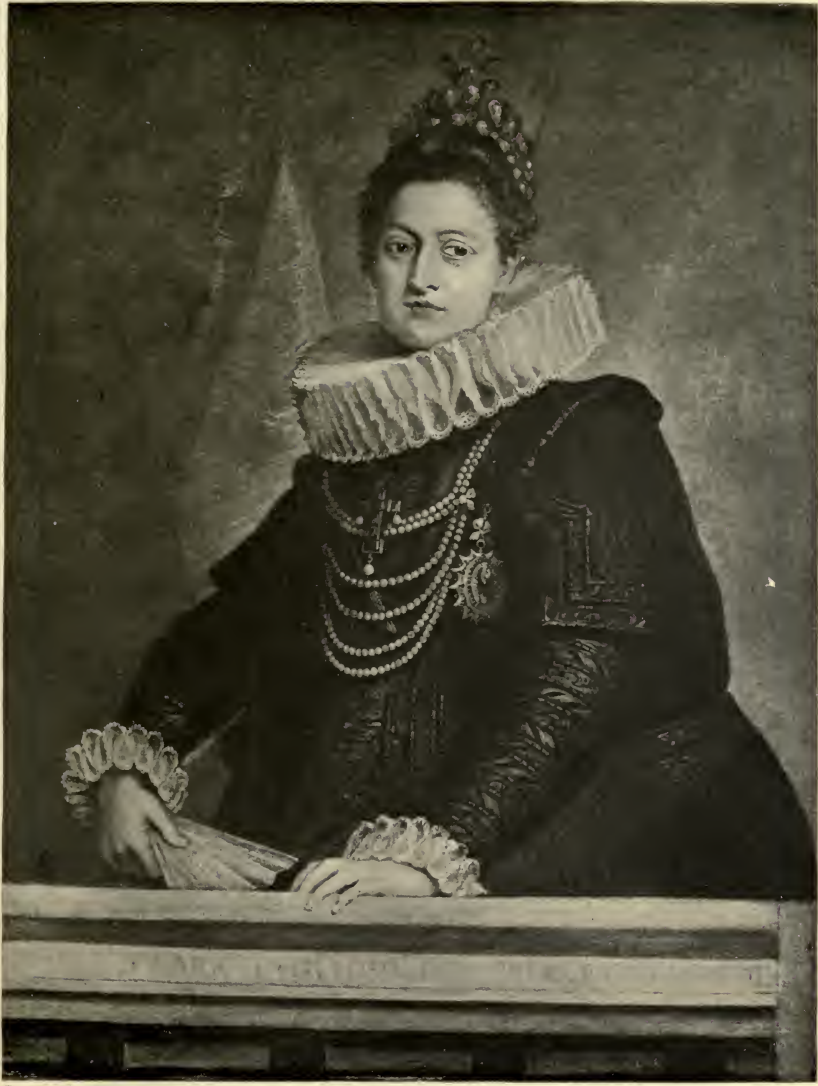
Portrait by Rubens