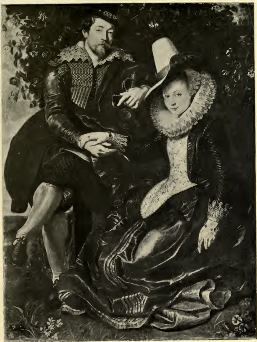
Drawn by Rubens