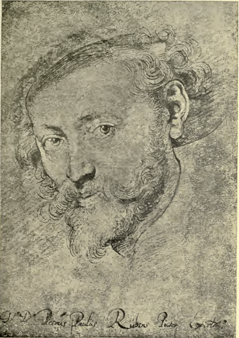
Drawn by himself