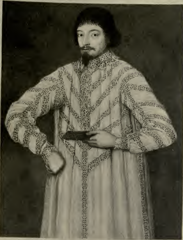
Portrait of Sir John Eliot, a student of the Tower