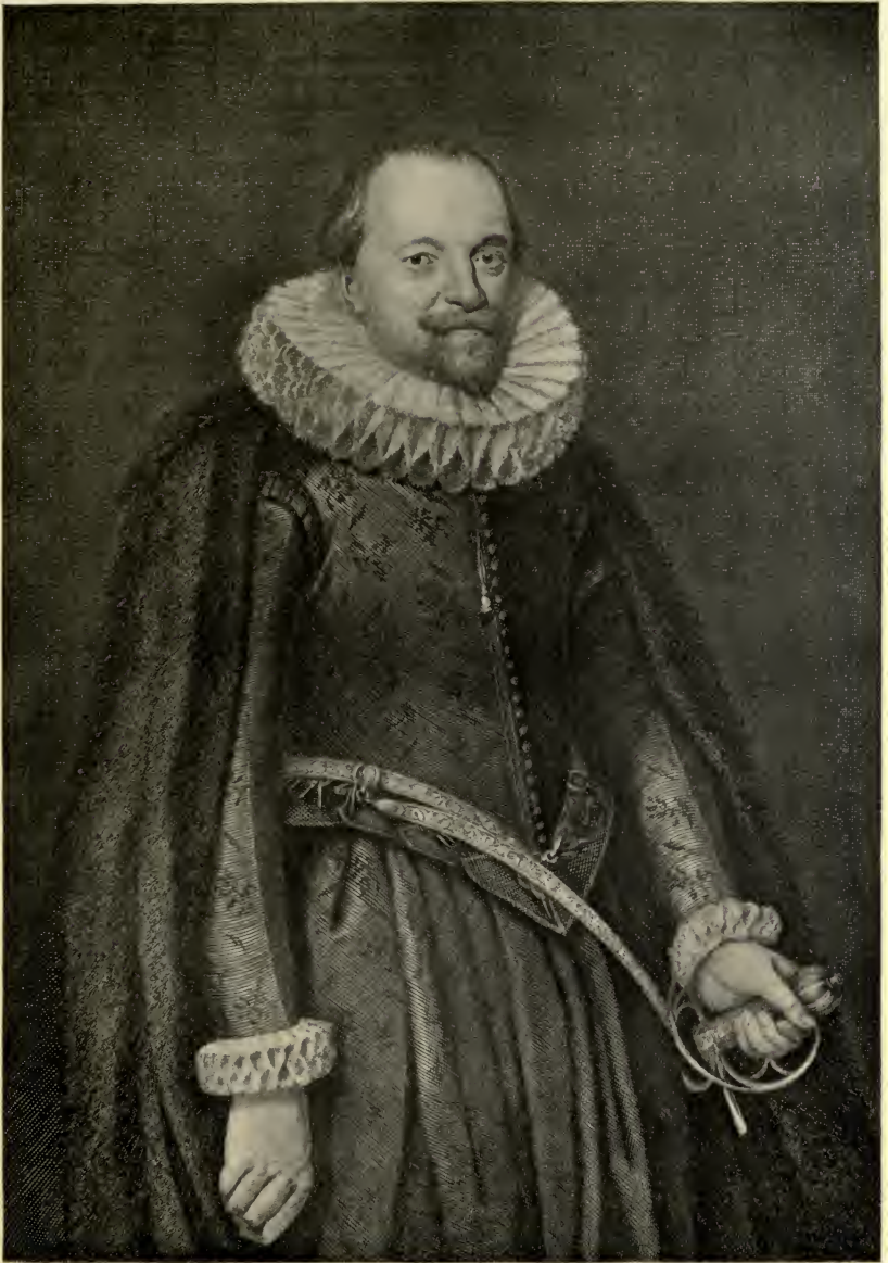
Portrait by Miereveldt