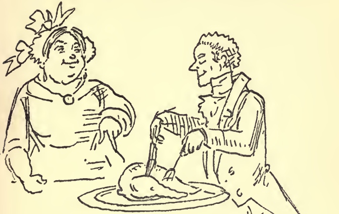
THE CARVER'S LESSON

long before his death. I went with Leech, and the servant told us that he was engaged. As we were going disappointed away, Miss Thackeray opened the