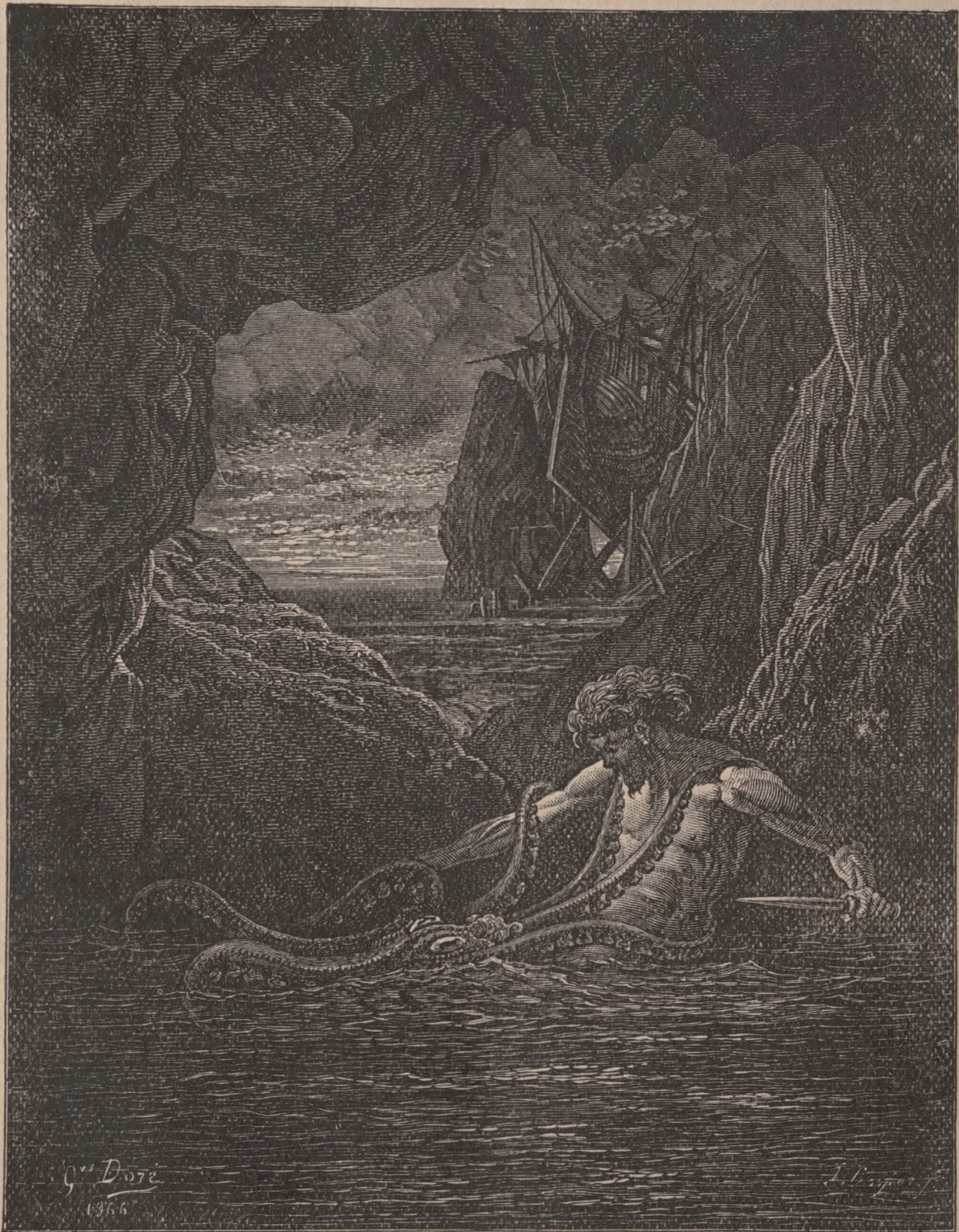
THE FIGHT WITH THE DEVIL-FISH.