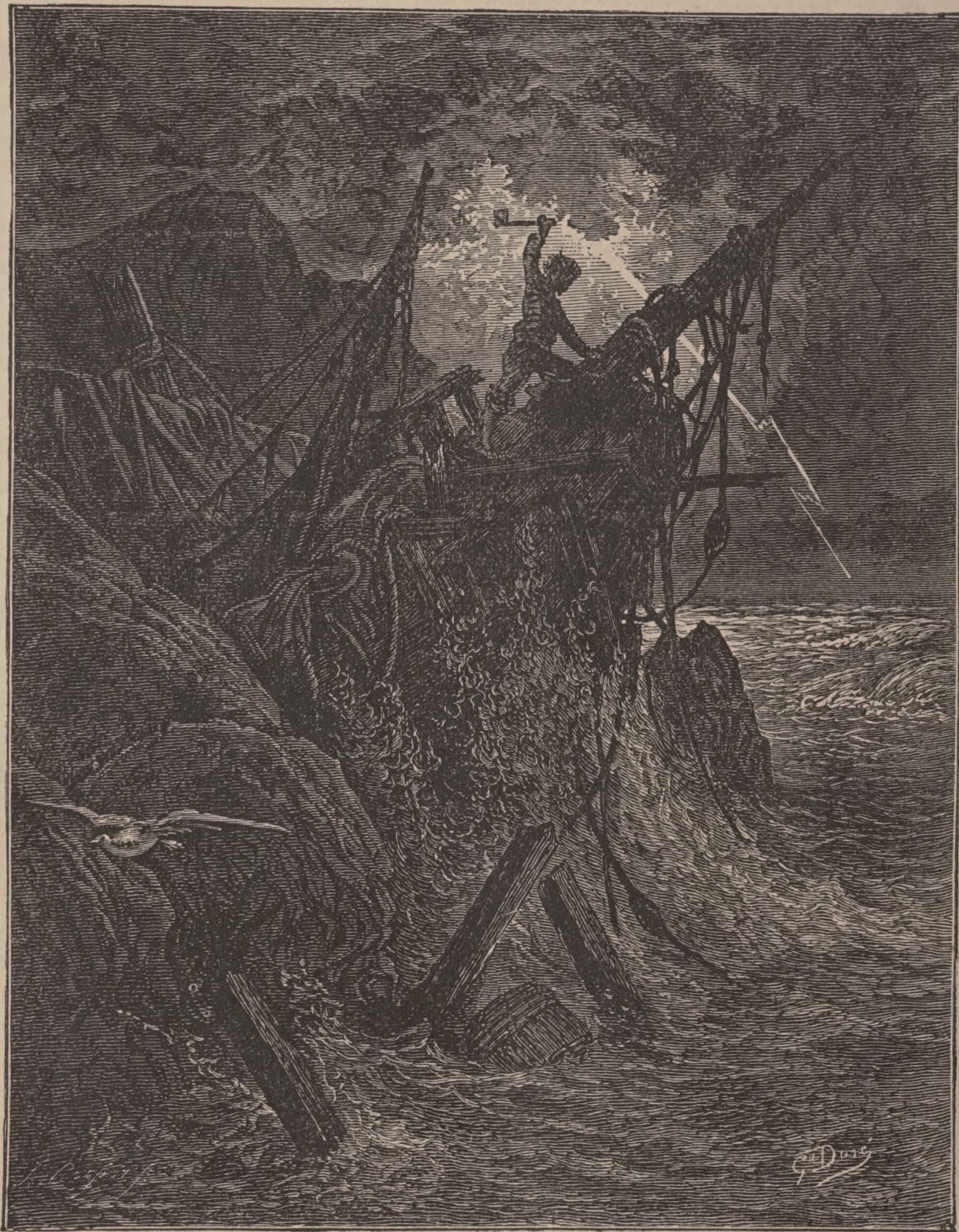
THE LAST BREAKWATER.