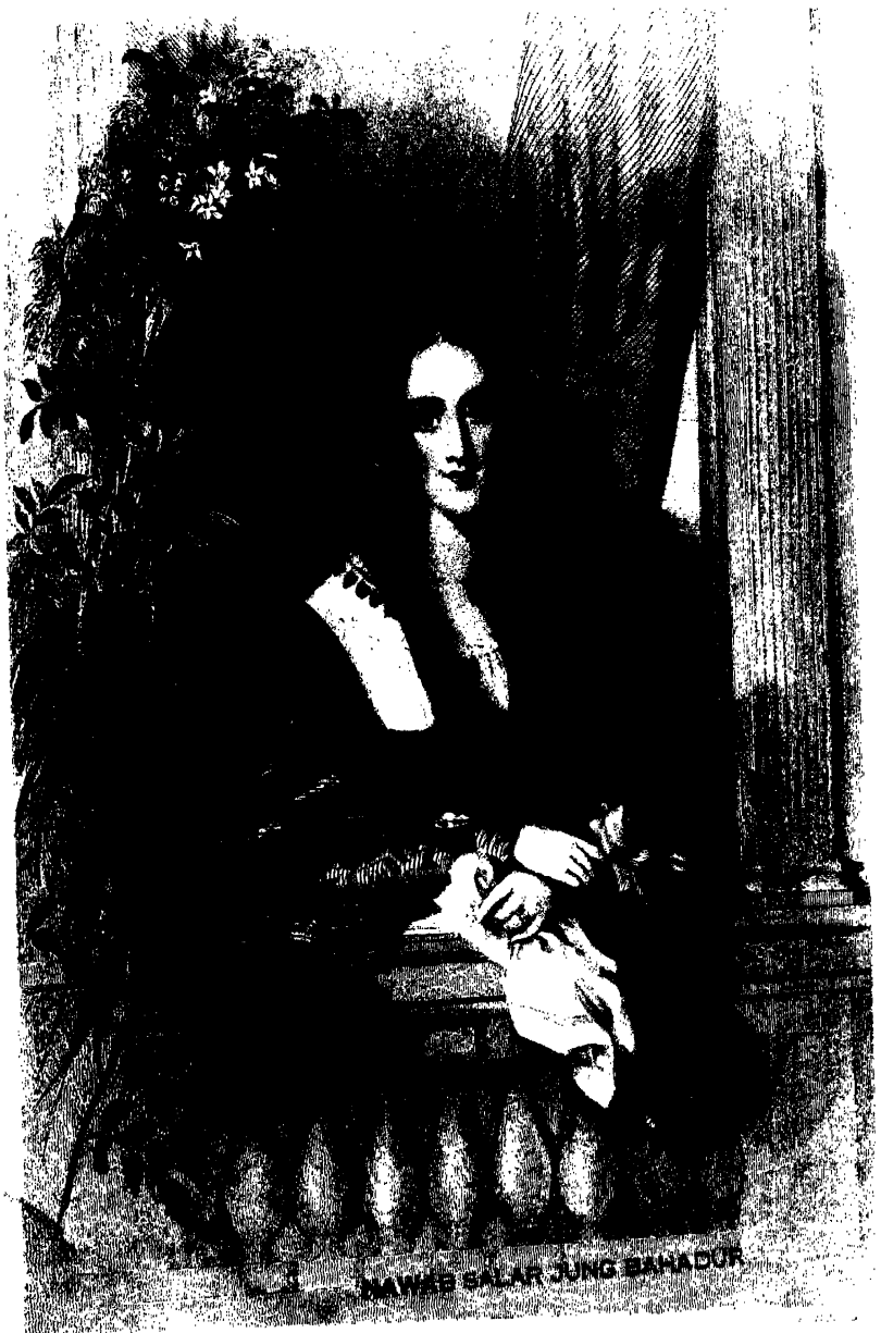
NAWAB SALAR JUNG BAHADUR