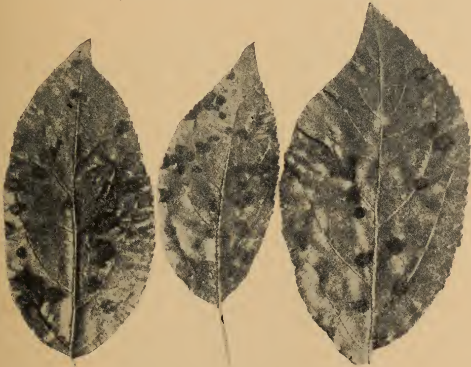
Figure 2: The common form of scab on the foliage.

Exposed parts of the blossoms are susceptible to infection and it is not uncommon to find the disease girdling the stems and causing a heavy drop of blossoms and young fruit. The lesions on the flower parts are not so conspicuous as those on the leaves. They are lighter in colour and sparse.