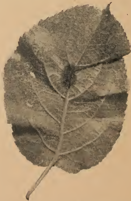
Figure 1. Under surface of leaves showing primary infections.

This pamphlet has been prepared to acquaint growers with the cause of the disease and the relation of weather conditions to it, in the hope that a better understanding of their relationship will lead to a more efficient application of control measures.