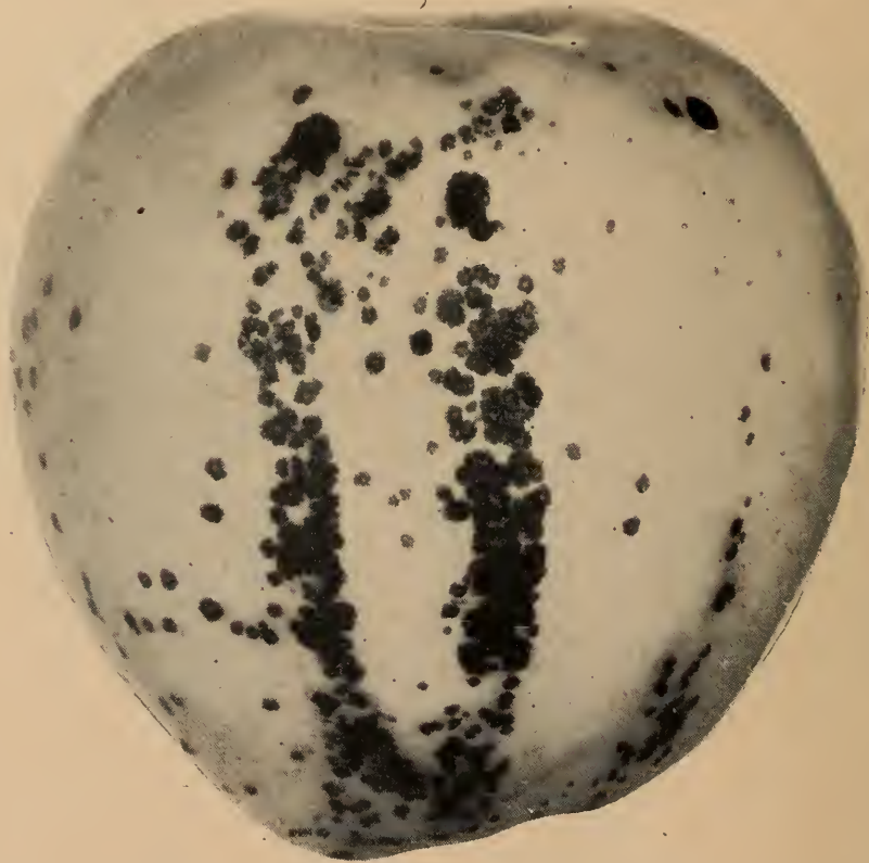
Figure 4: Storage scab or "ink spot" on Golden Delicious. The infections undoubtedly spread from the larger spots near the stem end.

of the fruit. The spots are irregular in outline and like those on the leaves have a dark olive-green colour. They sometimes enlarge and unite to form extensive scab areas which may cause a dwarfing and cracking of the fruit. The young fruit is frequently deformed or when the stems are affected and girdled it may drop. Because of their small size late-season lesions on the fruit are sometimes known as "pin head" or "pin point" scab. These appear shortly before harvest. They are frequently followed by "storage" scab (Figure 4) occasionally called "ink spot" on account of the colour. The spots are very dark, lack the olivaceous velvety appearance of earlier fruit infections and may not develop until after ten to twelve weeks in storage.