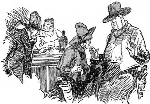
The runt flushed, and the big hombre grew pale