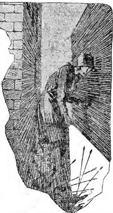
Her flash light glanced upon some long sticks

In the hall subdued cresset lights politely rebuked the unusual disturbance which had come to the staid old mansion. It was a residence that would have been thought decidedly recherché in the early nineties, but it was a distinct anachronism in the neighborhood now. On both sides it was flanked by