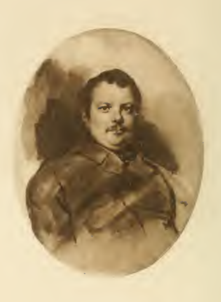
Honoré de Balzac from a sketch in the Museum at Tours.