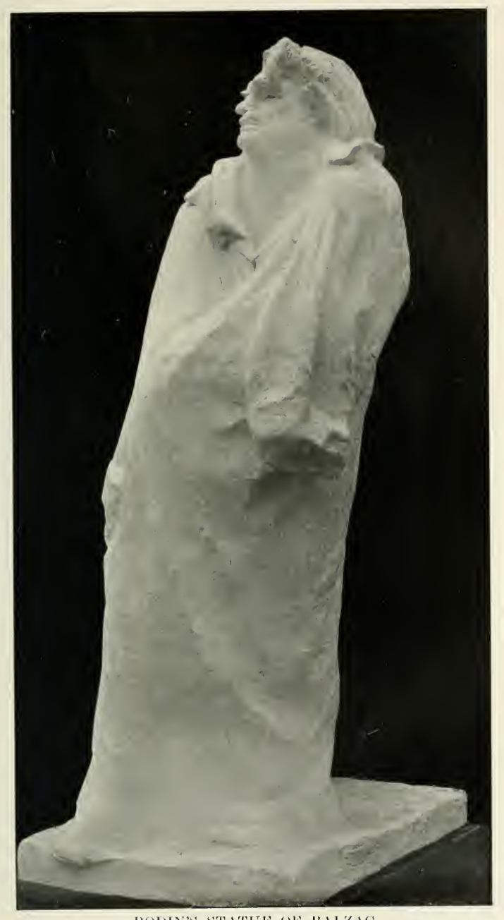
RODIN'S STATUE OF BALZAC. EXHIBITED IN PARIS AT L'EXPOSITION DES BEAUX-ARTS IN 1878. [To\ face\ p.\ 184,