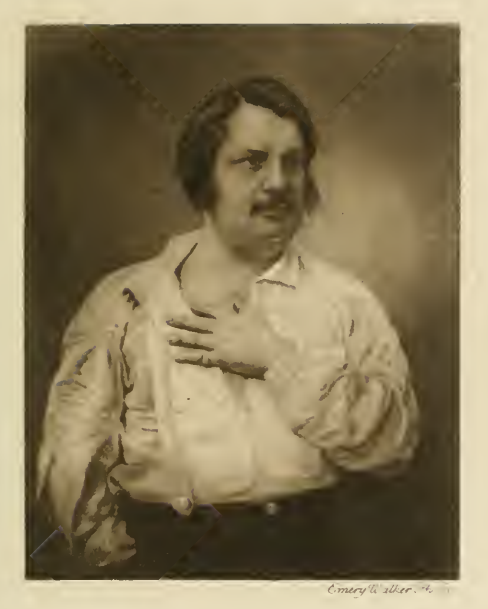
Honoré de Bulzac May 1842