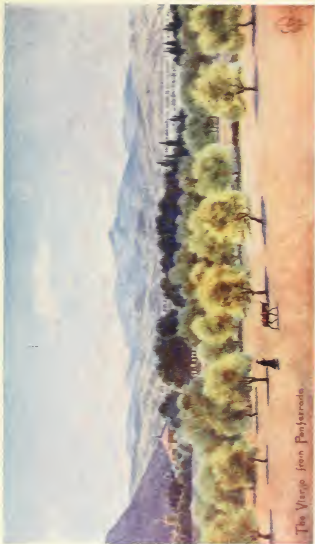
The View from Panfarrado