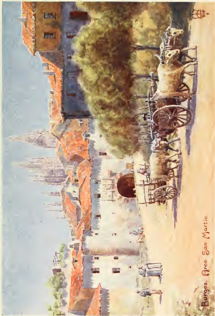
Burgos. Arco San Martin.