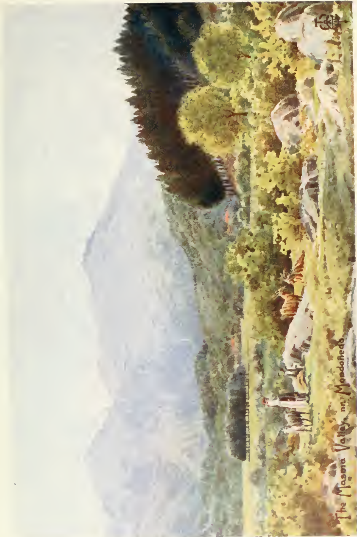
The Masera Valley, nr. Mosonfedez