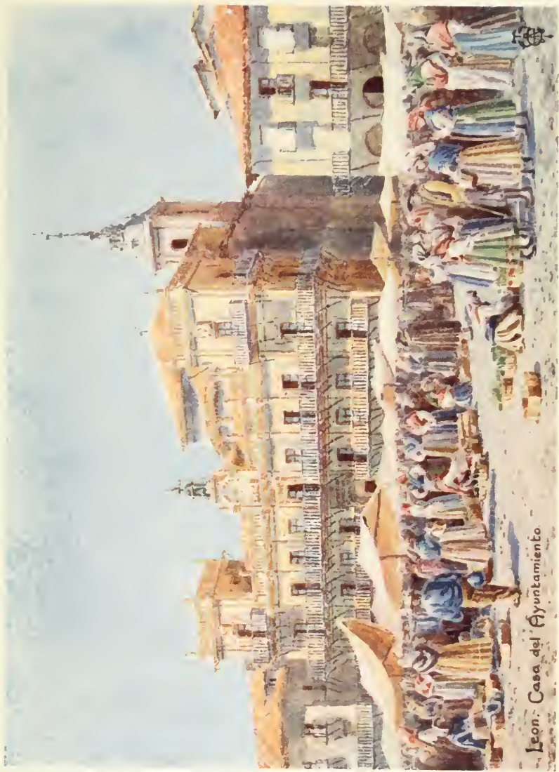
Leon. Casa del Ayuntamiento