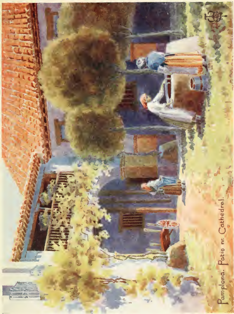
Pamplona. Patio nr Cathedral.