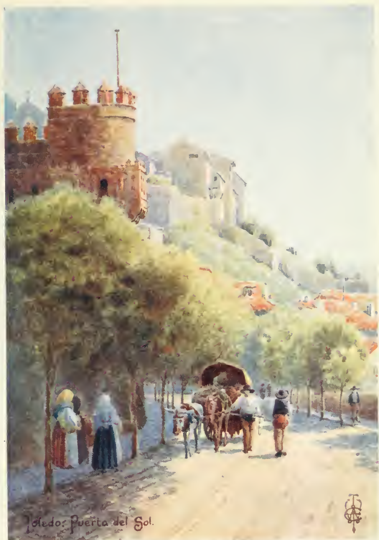
Toledo: Puerta del Sol.