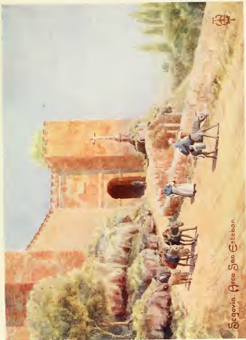
Segovia. Arco San Esteban.