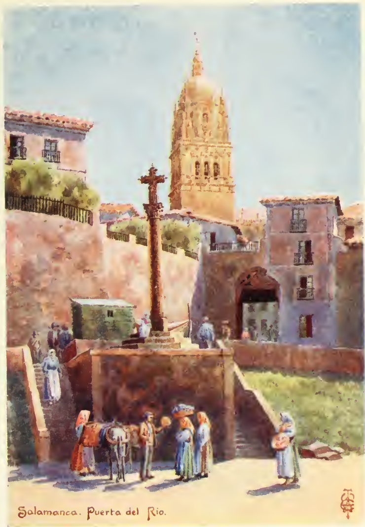
Salamanca. Puerta del Rio.