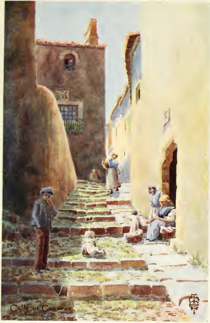
Calle in Caserta