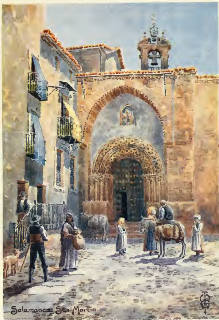
Salamanca San Martín