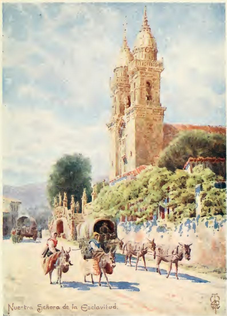
Nuestra Señora de la Esclavitud.