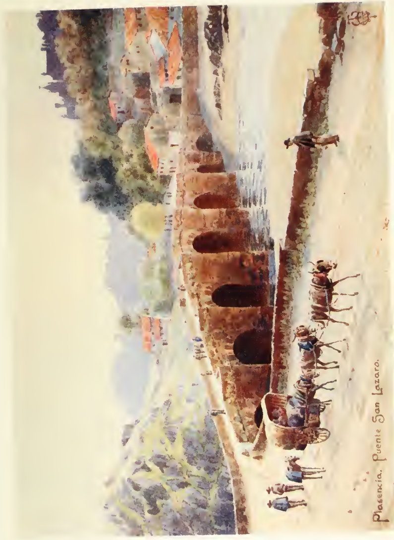
Piacenza, Ponte San Lazzaro.