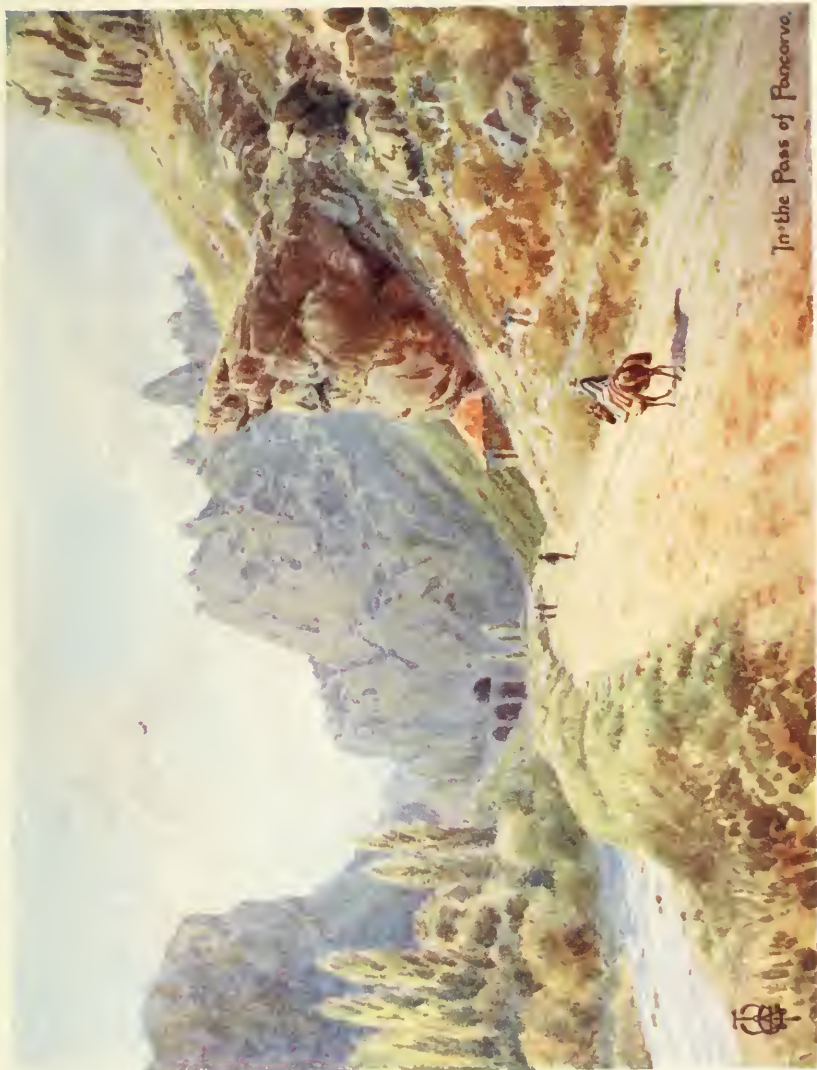
In the Pass of Paoorvo.