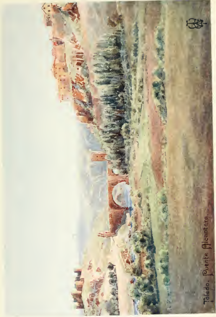
Toledo, Puente Alcántara.