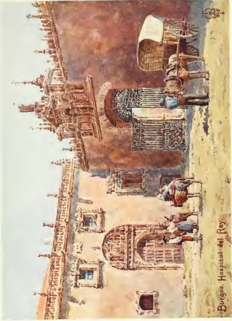
Burgos. Hospital del Rey.