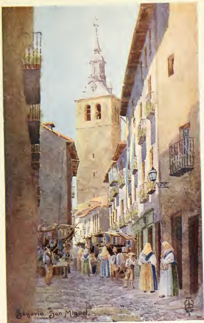
Segovia. San Miguel.