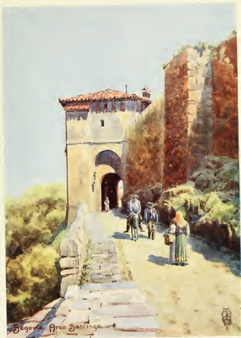
Segovia. Arco Santiago.