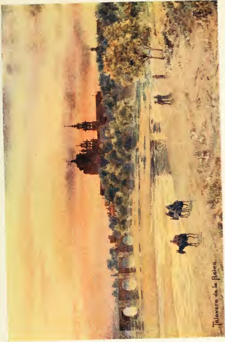
Talavera de la Reina.