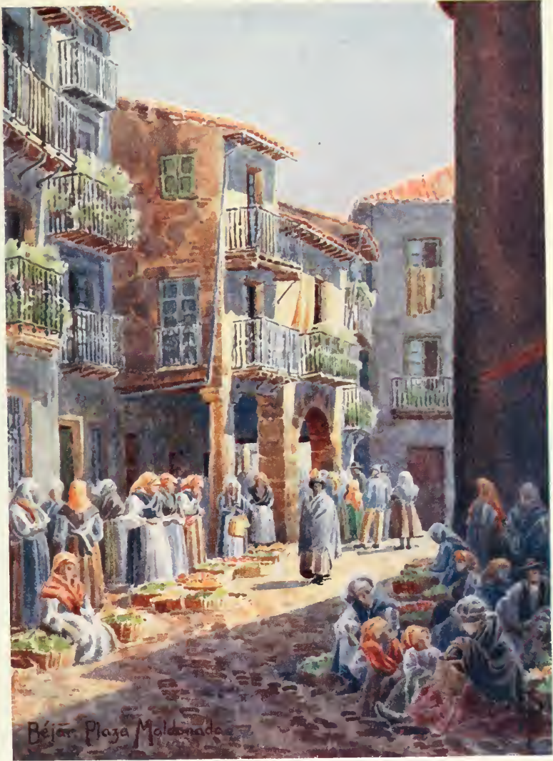
Béjar Plaza Maldonado