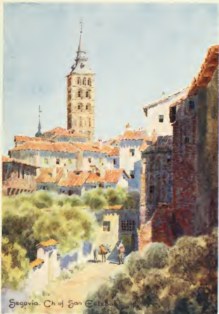
Segovia. Ch. of San Esteban