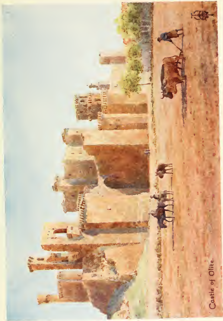
Castle of Olite.