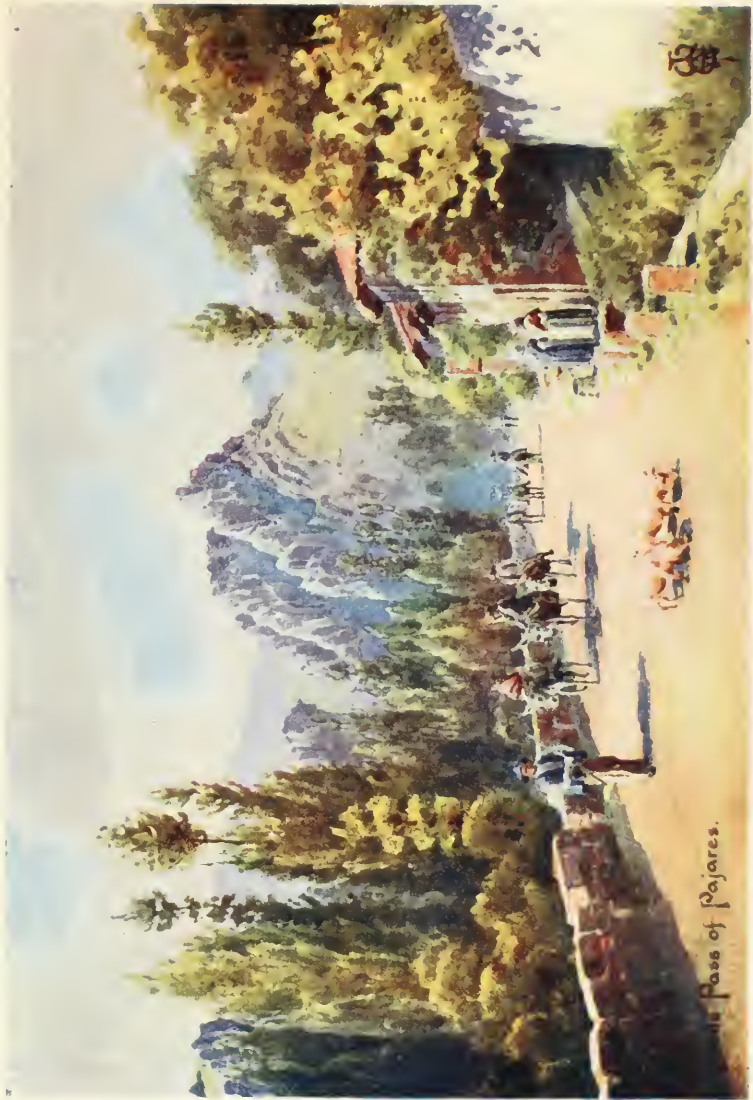
The Pass of Pajares.