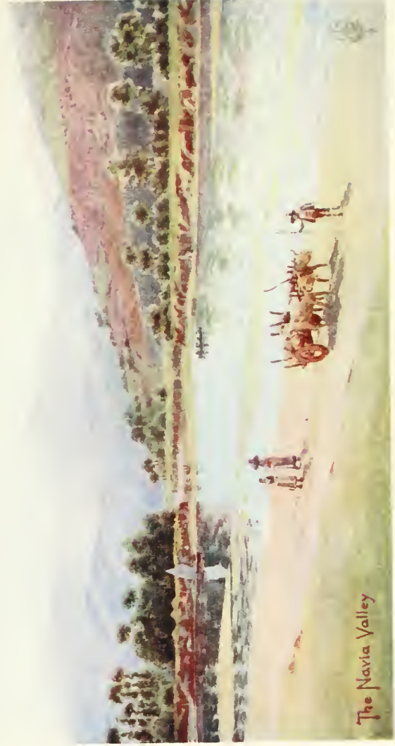
The Navia Valley