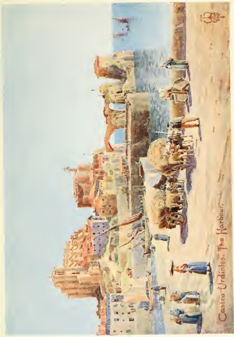
Castro Urdiales. The Harbour.