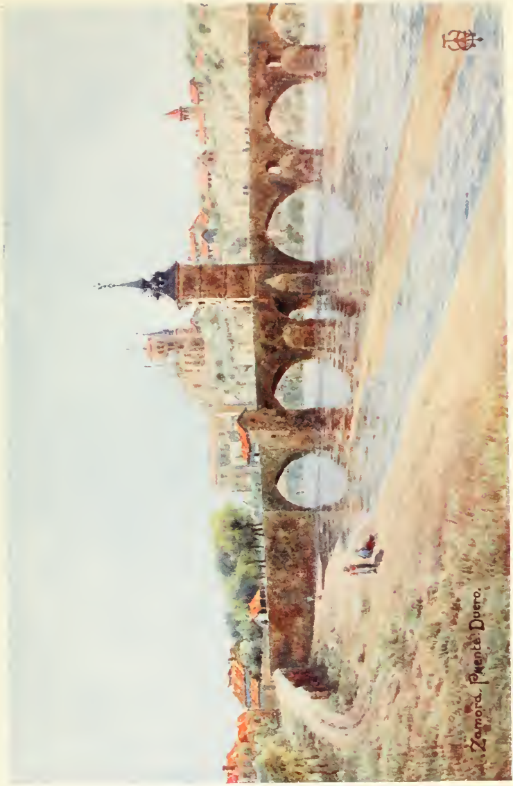
Zamora. Puente Doño.