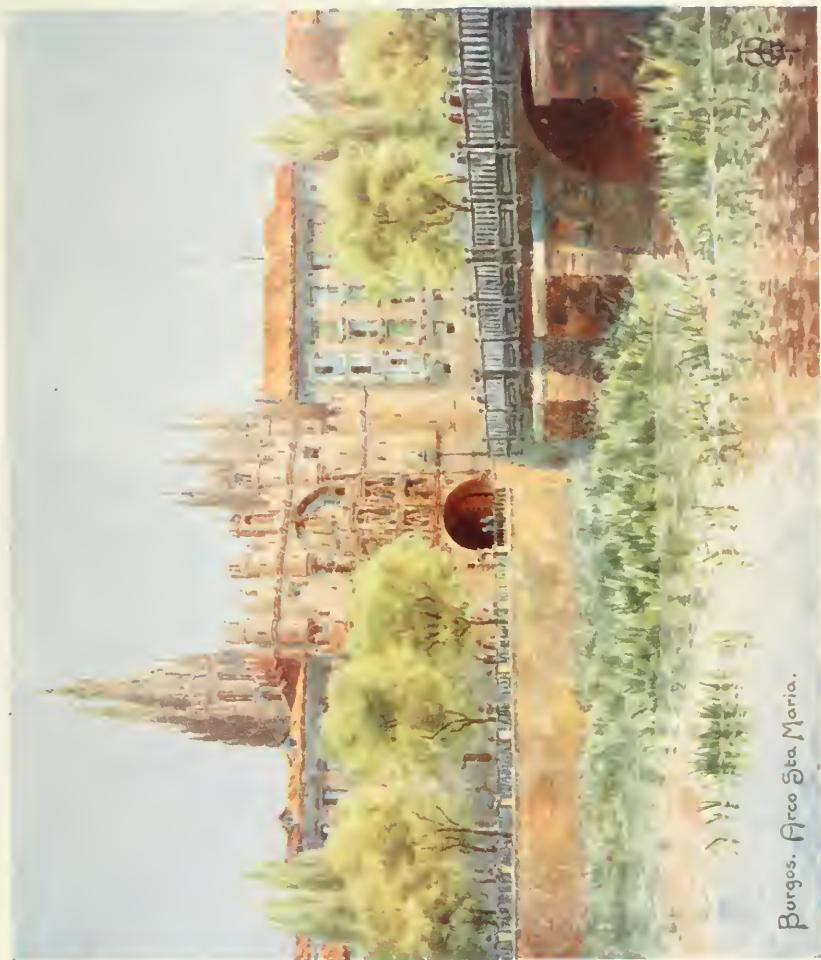
Burgos. Arco Sta. Maria.