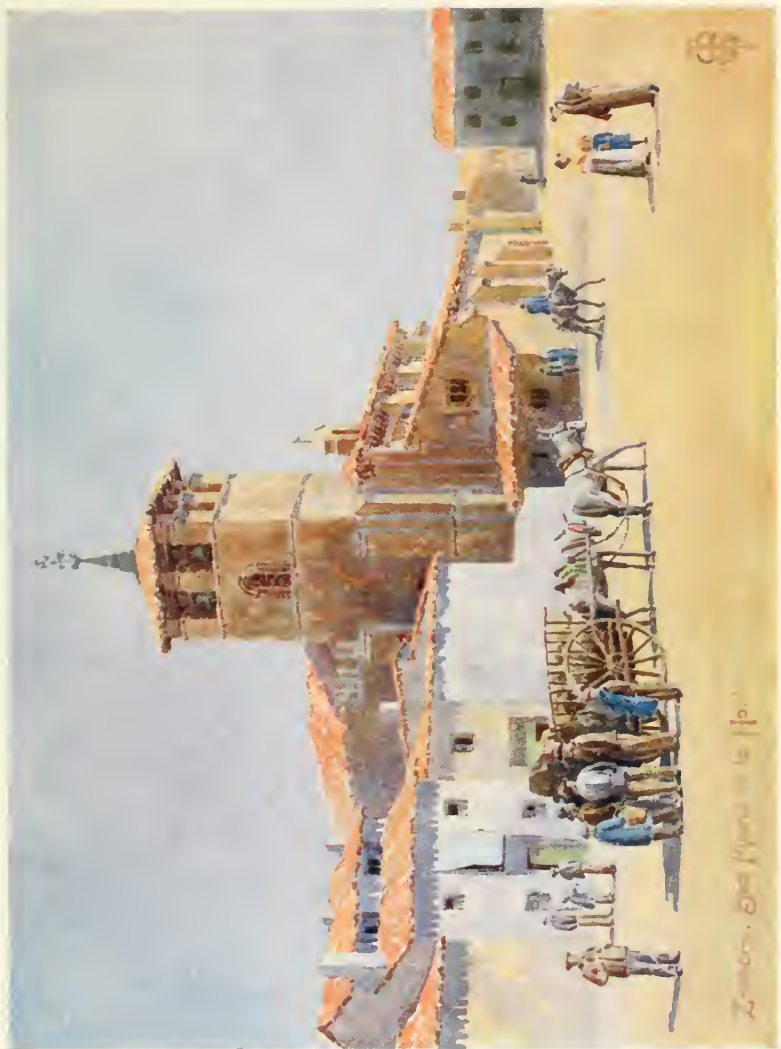
San Juan de los Rios - 10.