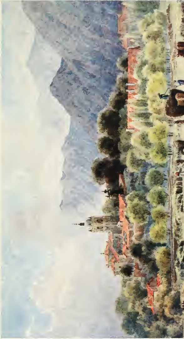
Pasana near Ulanes.