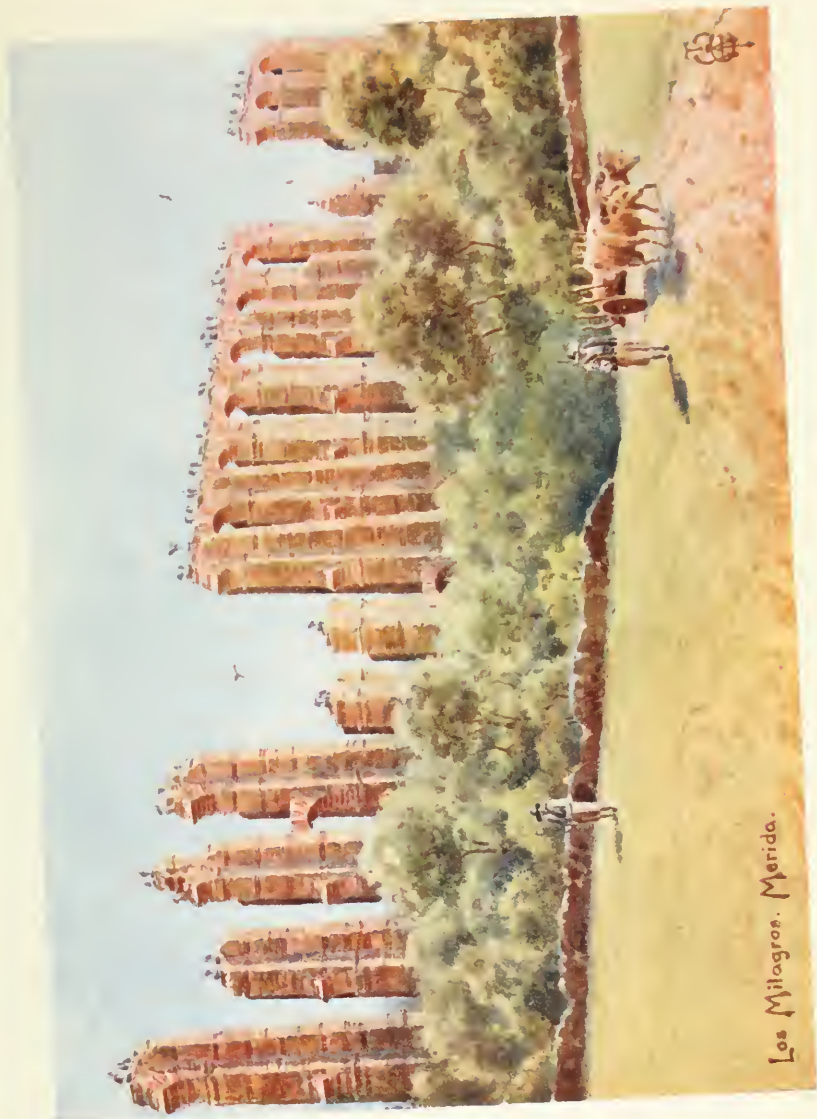
Los Milagros. Merida.