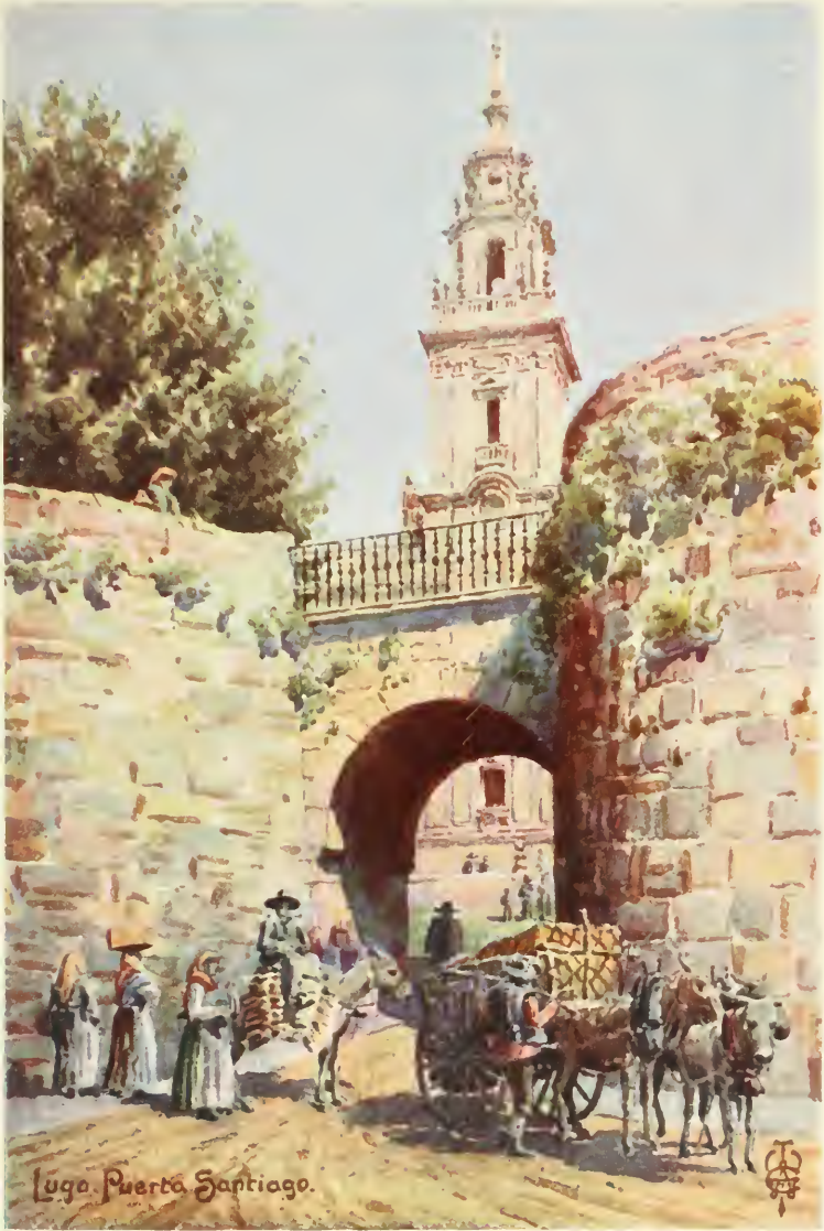
Lugo. Puerta Santiago.