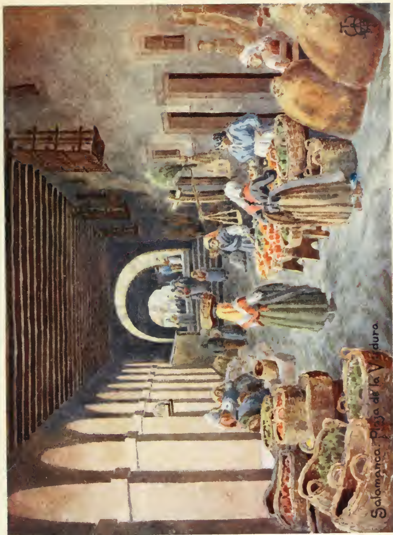
Salamanca. Plaza de la Vidura.