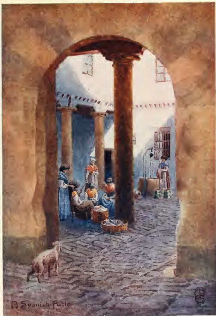
A Spanish Patio