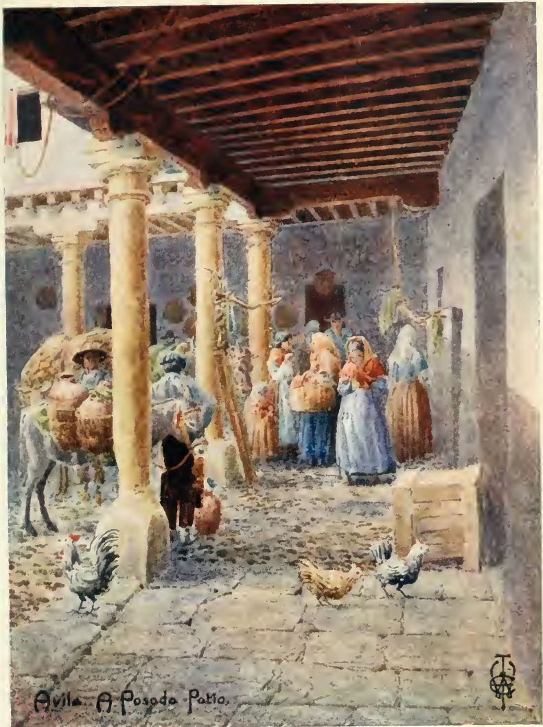
Avila. A Posoda Patio.