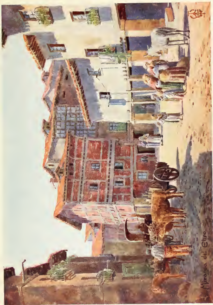
Miranda del Ebro