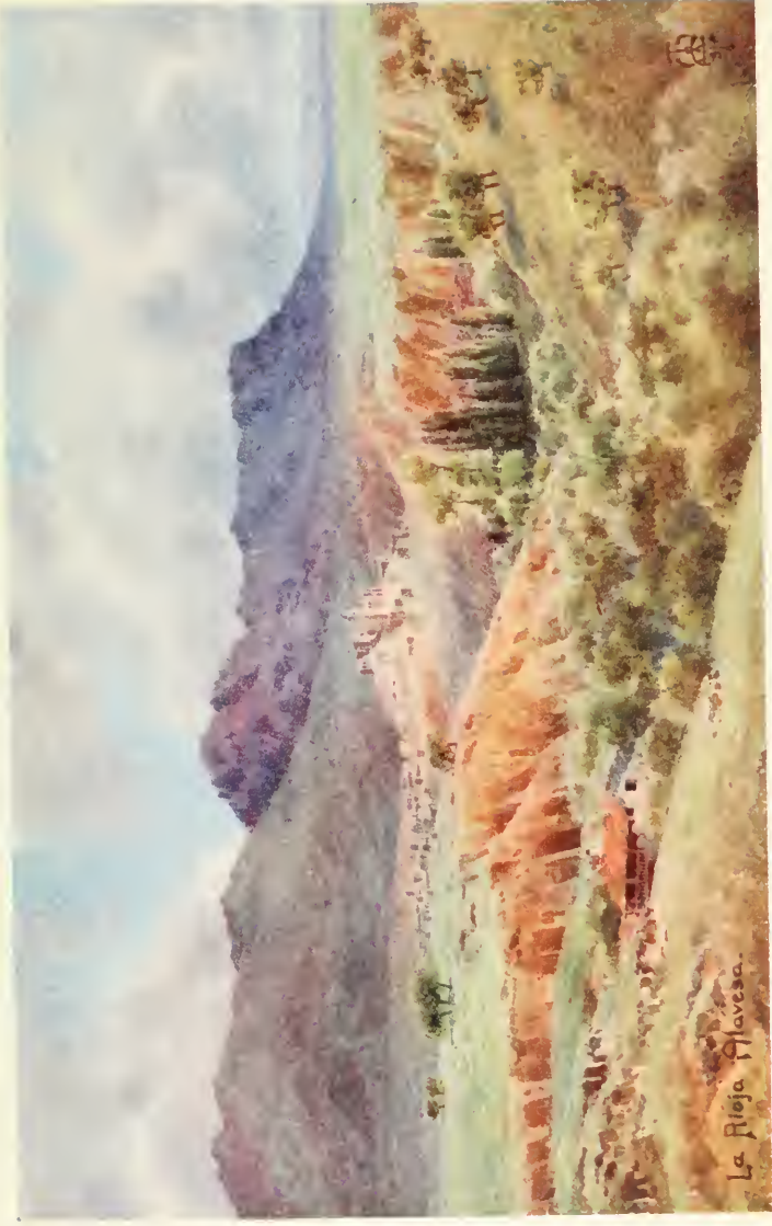
La Rioja Alavesa.