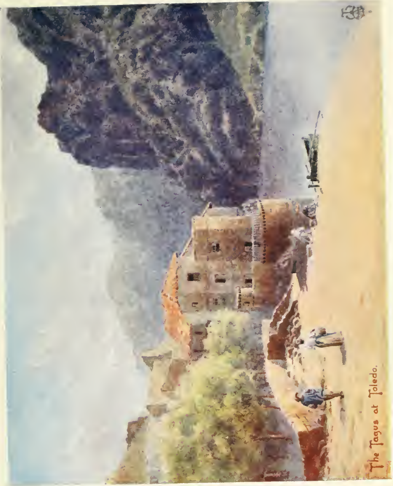
The Tagus at Toledo.