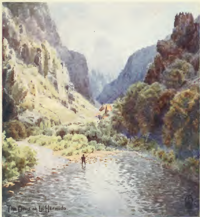
The Deva at La Hermida.