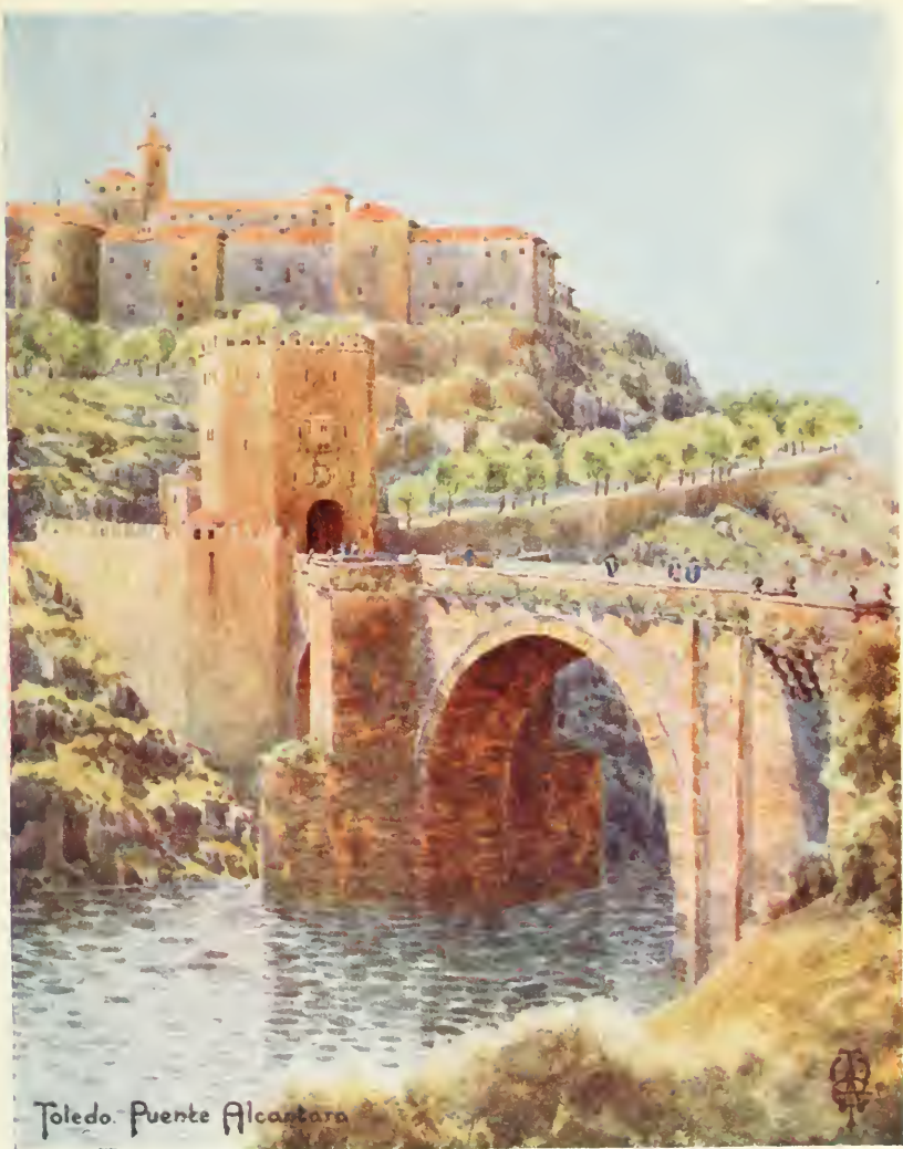
Toledo. Puente Alcantara