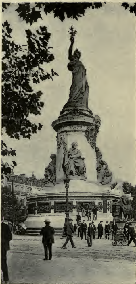
THE MONUMENT OF THE REPUBLIC, PLACE DE LA RÉPUBLIQUE, PARIS.