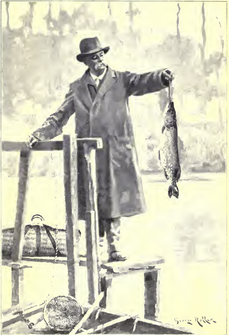
JUST TEN POUNDS