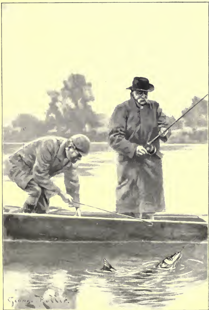
READY FOR GAFFING