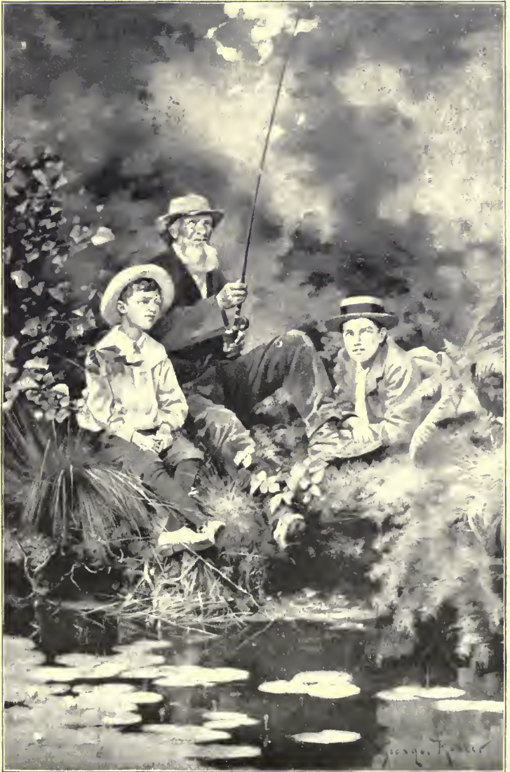
THE FIRST LESSON