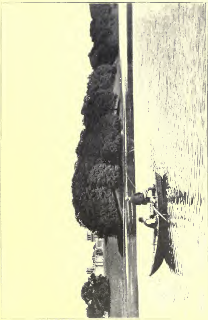
TOO MUCH SPLASH