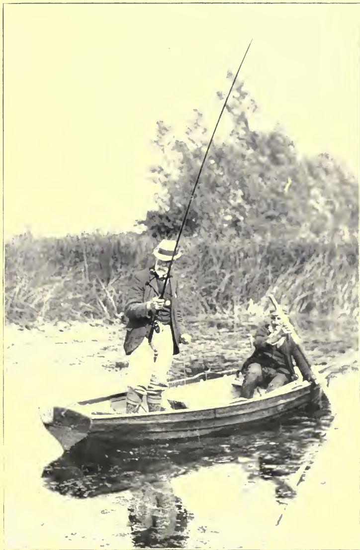
PATERNOSTERING FOR PERCH