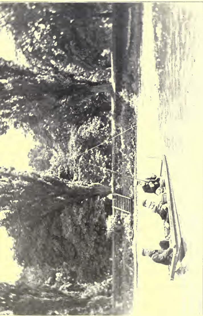
A FAVOURITE PIKE SWIM