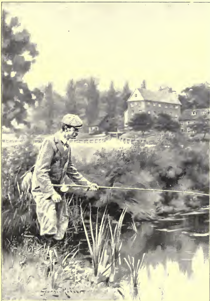
A FAMOUS PERCH POOL