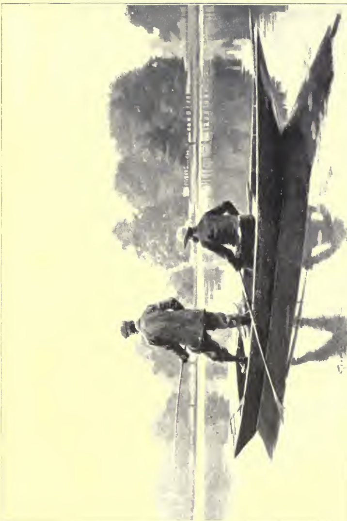
TYPICAL ENGLISH PARK WATER