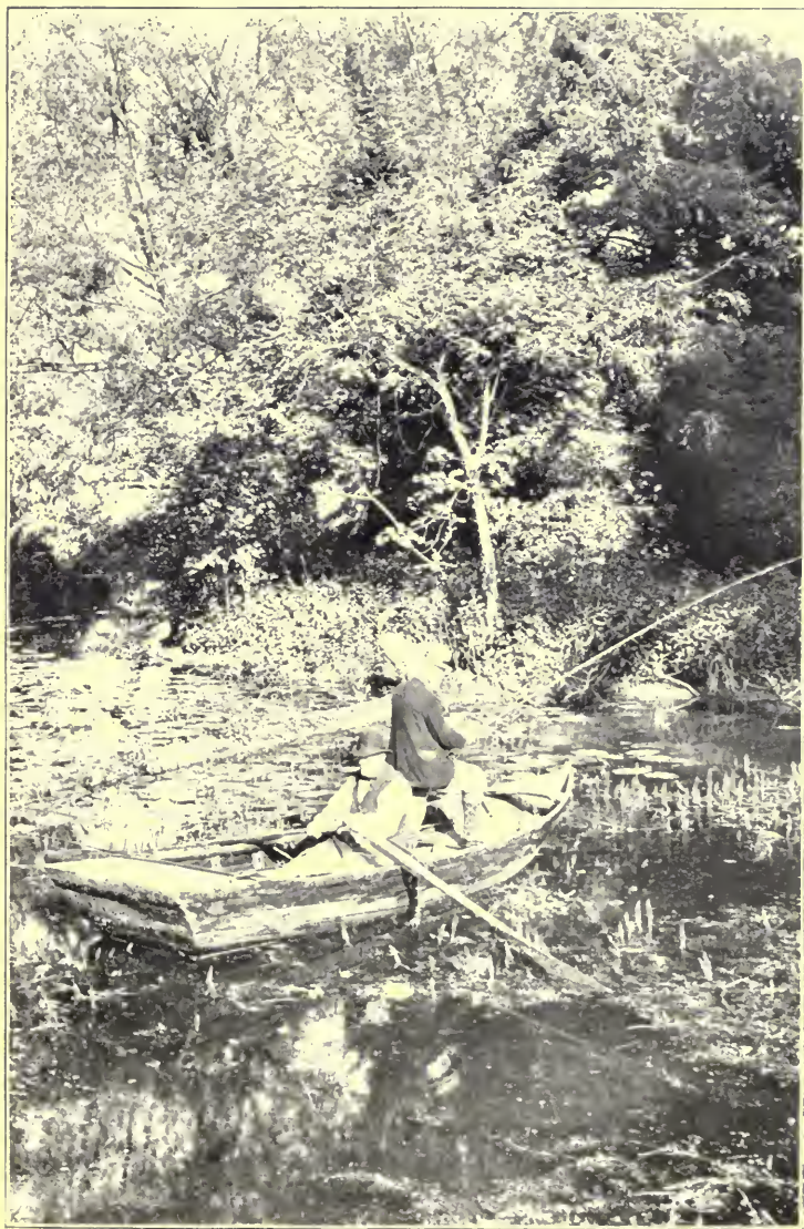
SEARCHING THE WELL -