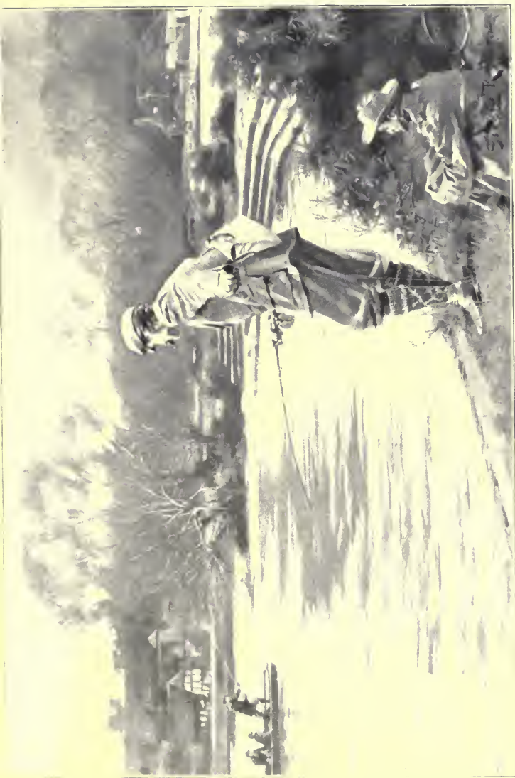
A PERFECT SPIN