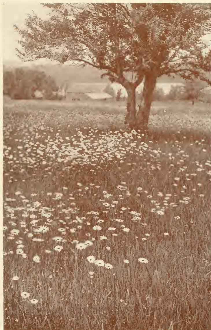
"The round-eyed daisies, spying."