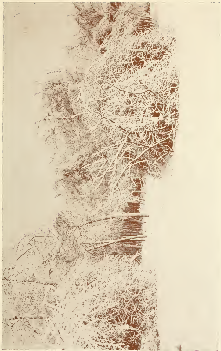
"Diamonds on shrubs and ice-bound trees." Eastman Kodak Co.