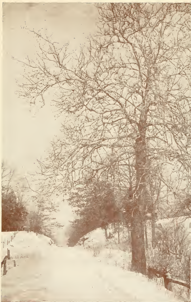
The Winter Day. In Connecticut