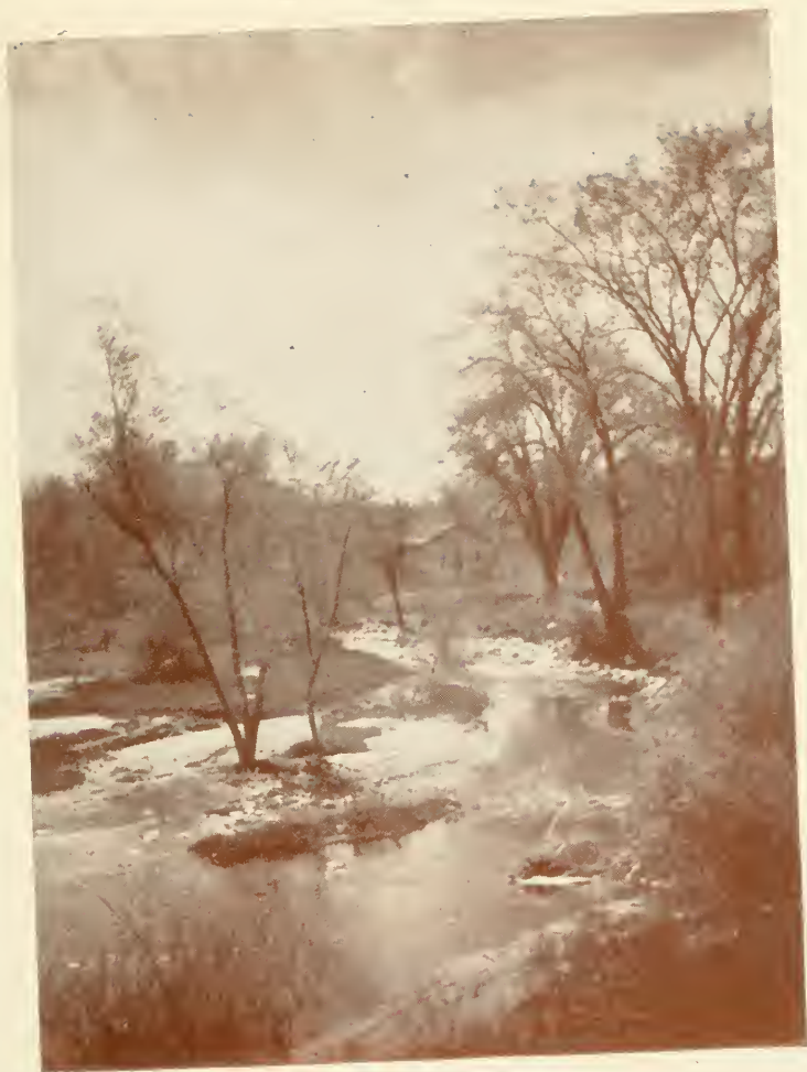
“Peep, peep, peep.” “Out in the woods in early spring.” In Michigan