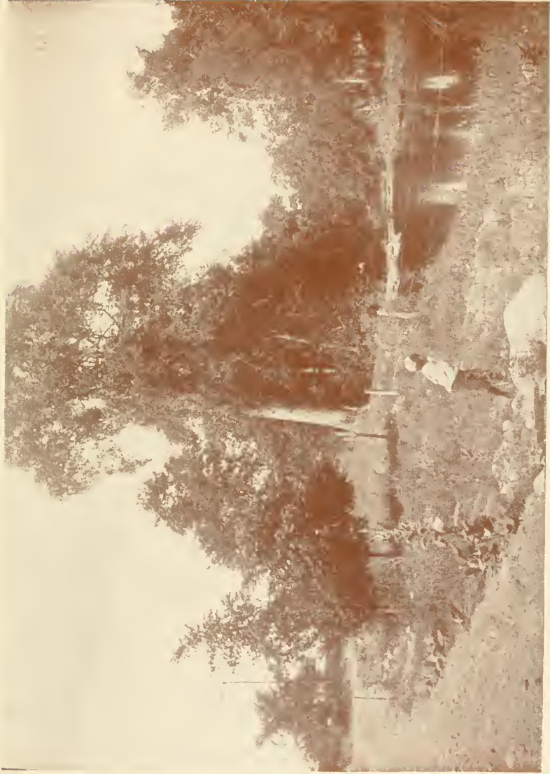
“How happy the seasons those pictures recall.” In Michigan