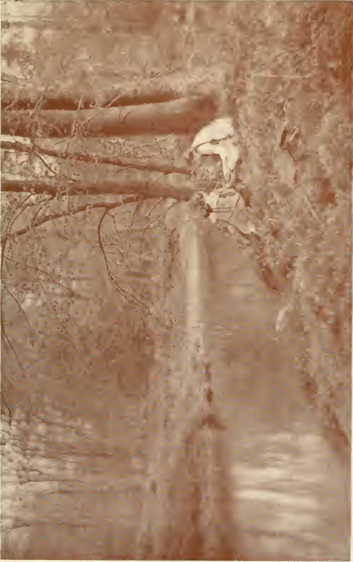
"Sit upon the bank and listen."