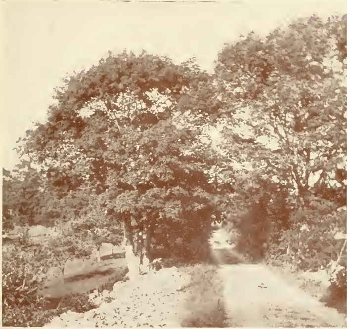
"In the golden summer morning." Photo by W. L. Pond In Brooklyn, Conn.

Blue the skies that shine above it, Curtained by the whispering trees, Rich the memories clustering round it, Sweeter than the summer breeze. Smooth and hollow is its doorstep, Worn and thin nits ancient sill By the little feet that entered In the schoolhouse on the hill.