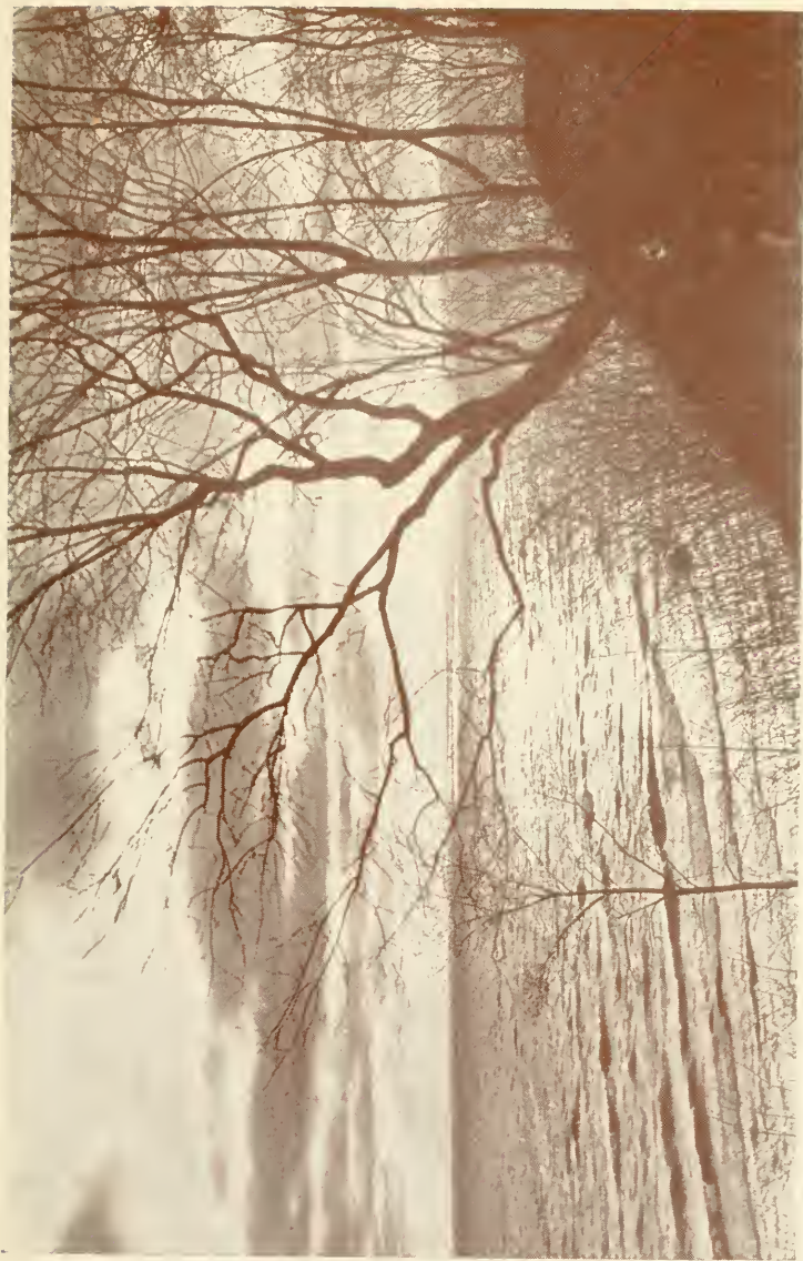
"Moonlight, shadowy visions." Lake Michigan, near Muskegon