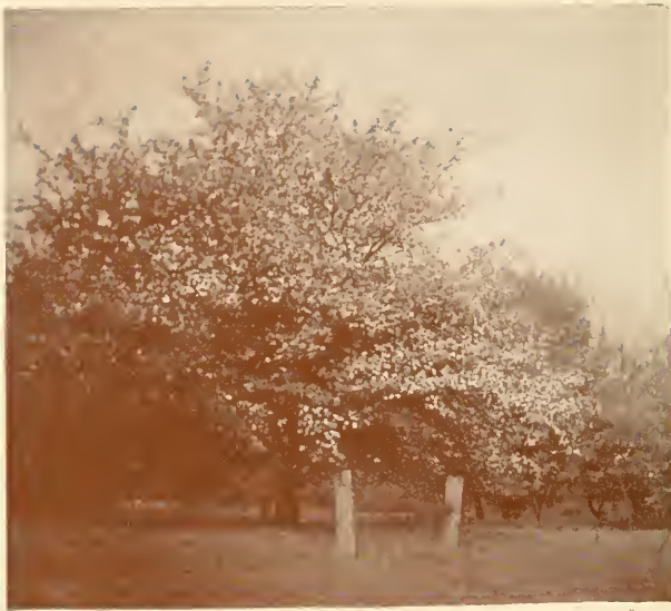
"In the shade of the old garden apple tree, resting."