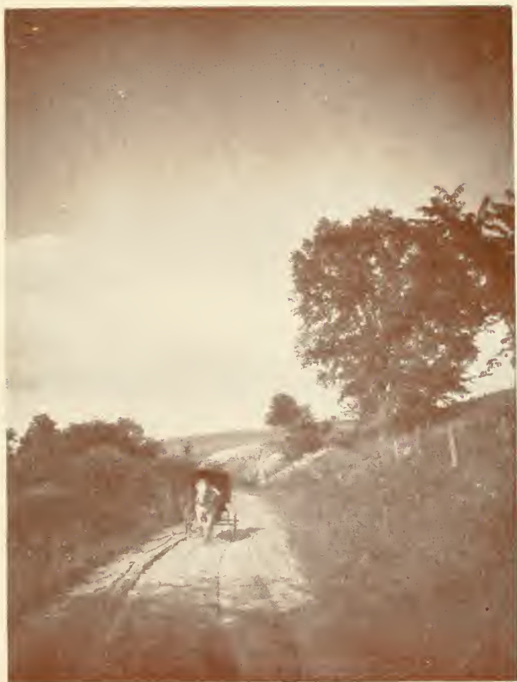
"Gone are the burdens of city life." Photo by Beckwith In Michigan