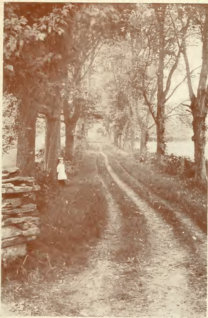
"Near the old stone walls by the country road." In Brooklyn, Conn.