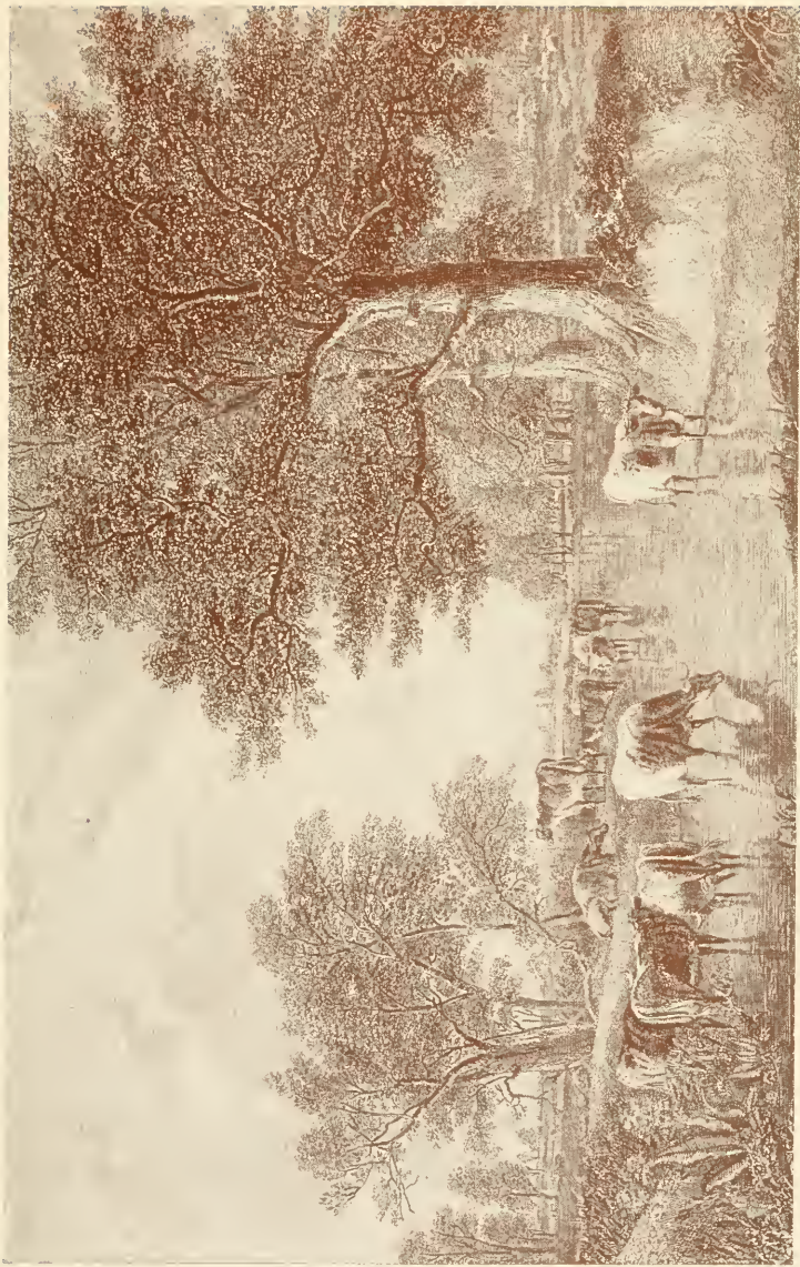
The Watering Place. From Engraving of Painting by James Hart