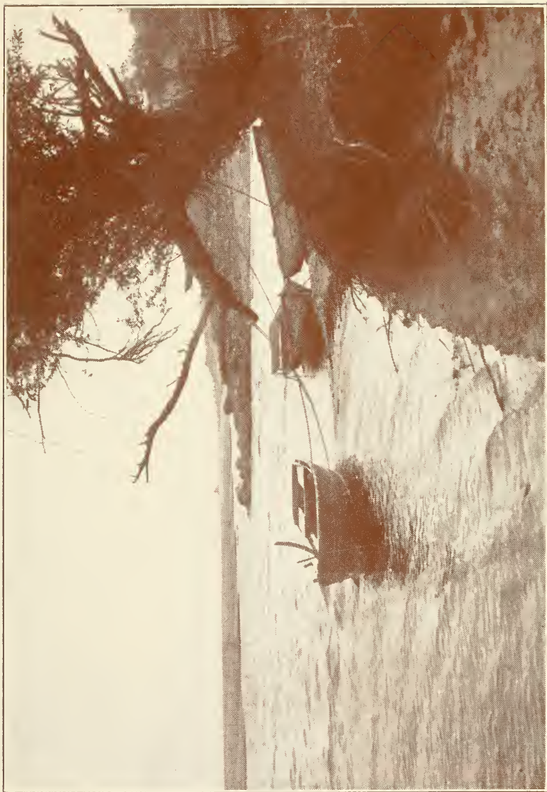
“And some flat-bottomed boats came in view.”