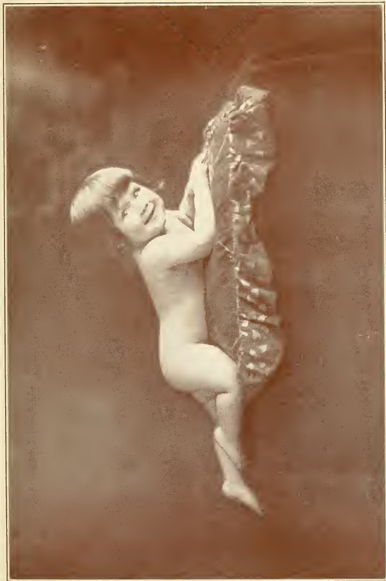
One of the "Three Little Tots."