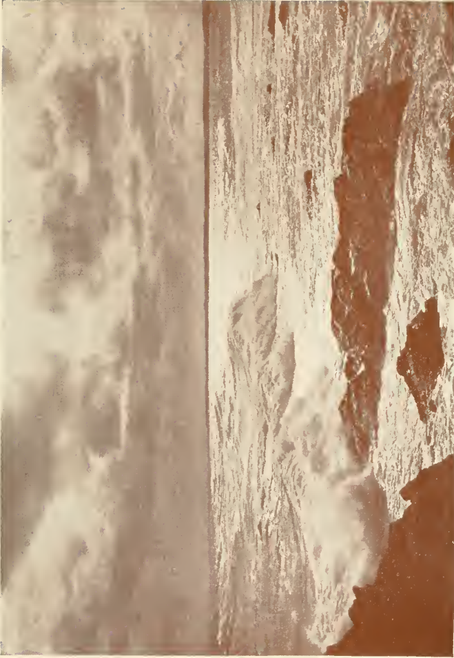
“Giving and taking, but taking far more.” On Maine Coast