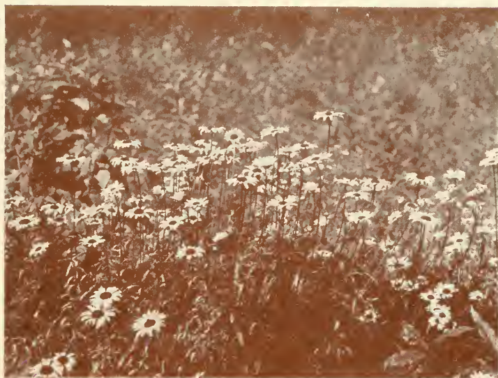
"Daisies purple, daisies white." In Conn.

The world is gone with yesterday; Beyond, is all a mystery, Now, from the Night's divinity, Falls with her beauteous drapery, Falls on our souls like melody, A happy peace.