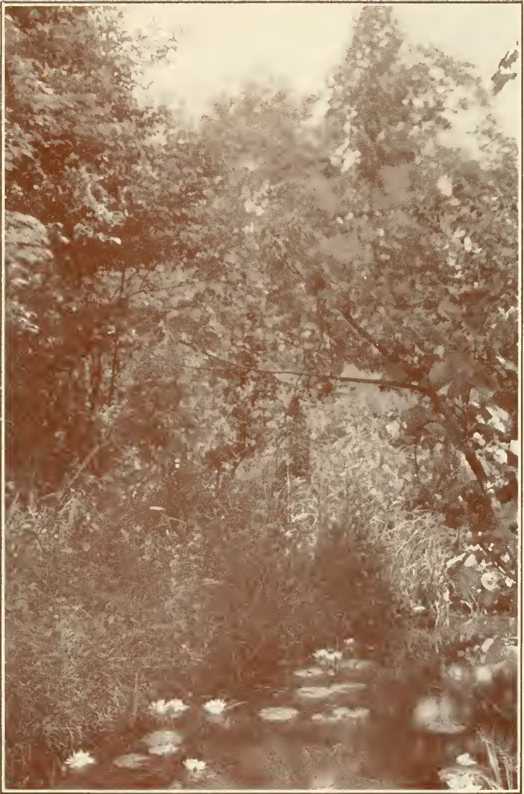
“And help each budding plant a beautiful life to win.” In Michigan