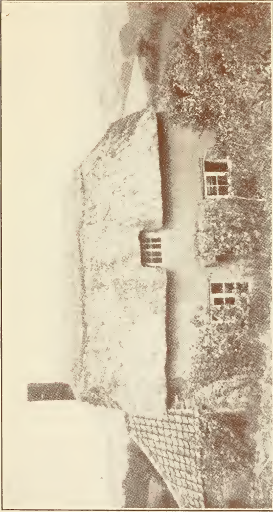
Home of a Cottager, about 1600 years old, in Somersetshire, England.