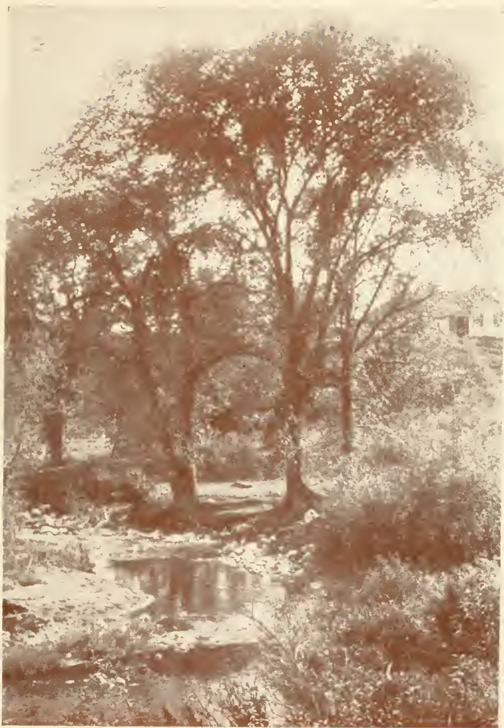
"I wandered near the old home." In Michigan