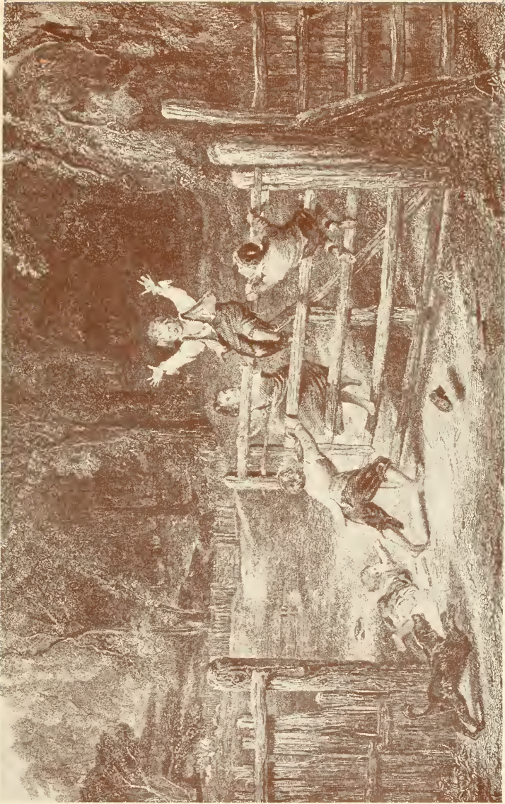
“ 'Twas joy today tomorrow.” The Old Farm Gate