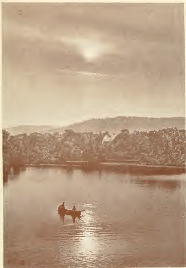
“The moon looked down on an opal sea.” On Massachusetts Coast