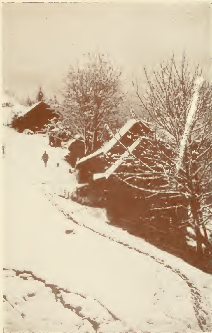
"How the wind whistles and rattles the blinds." In Oregon