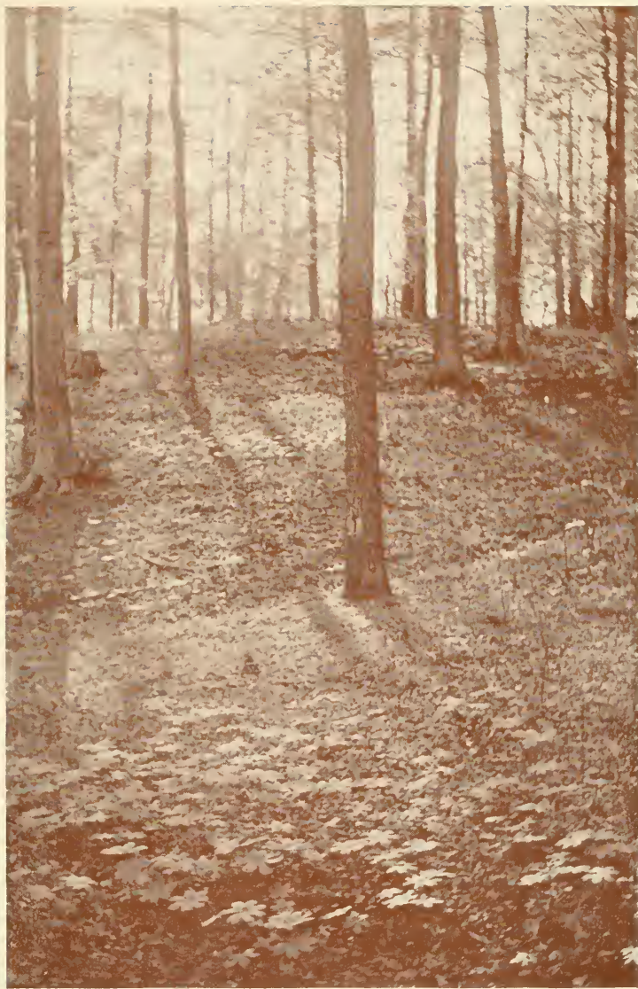
"With arrows of light from the quiver of noon." In Penn.