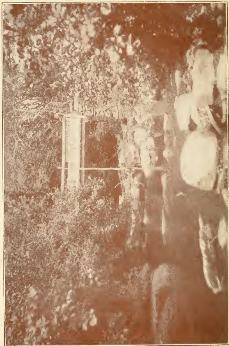
A Quiet Spot. In Brooklyn, Conn.