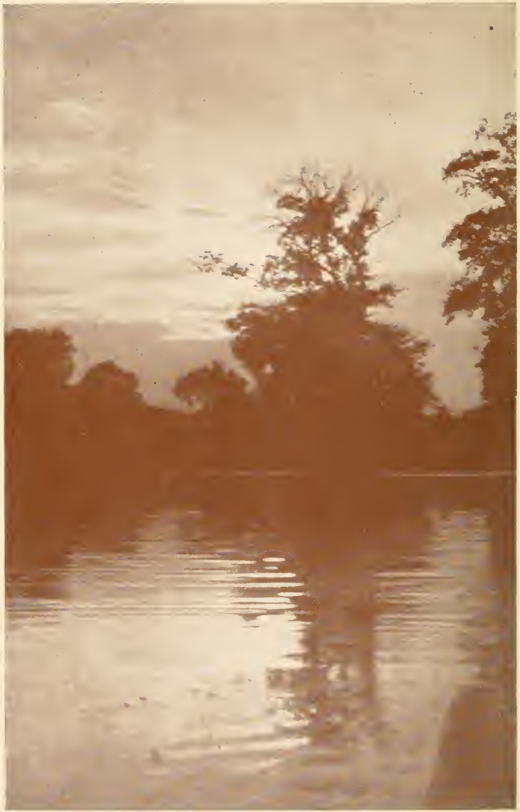
"The day's farewell to the summer night." In Michigan