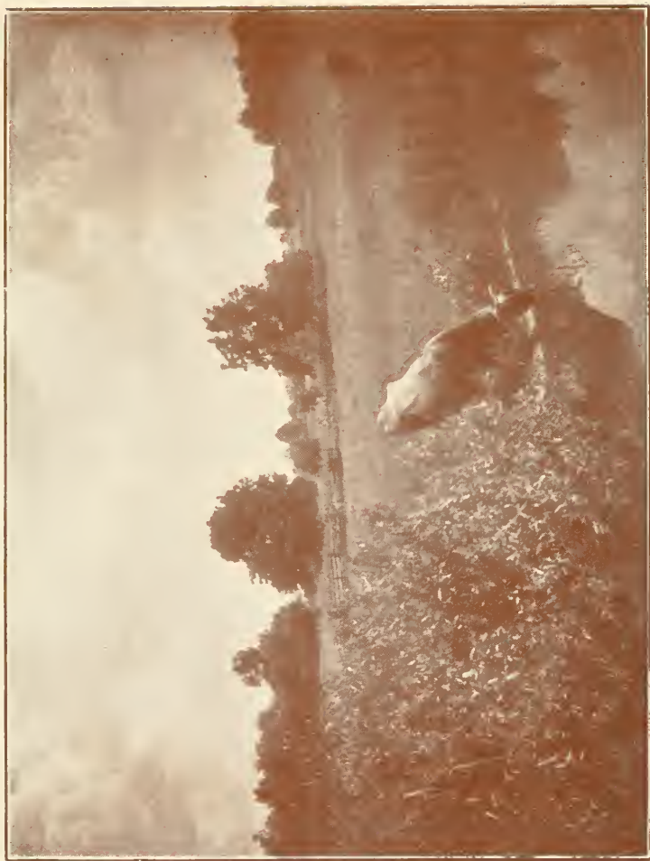
"Did you ever go for berries in the pasture lot?" In Michigan