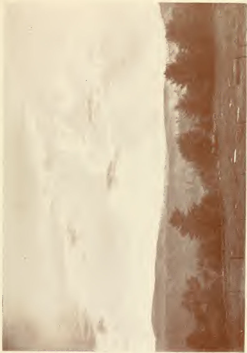
"After the showers comes a golden refrain." In Maine