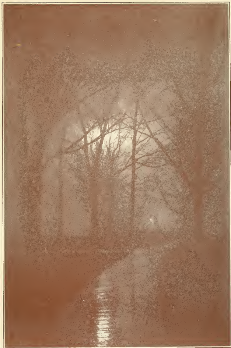
"Over the shadowy trees it falls." Part College Campus, Ann Arbor, Mich.