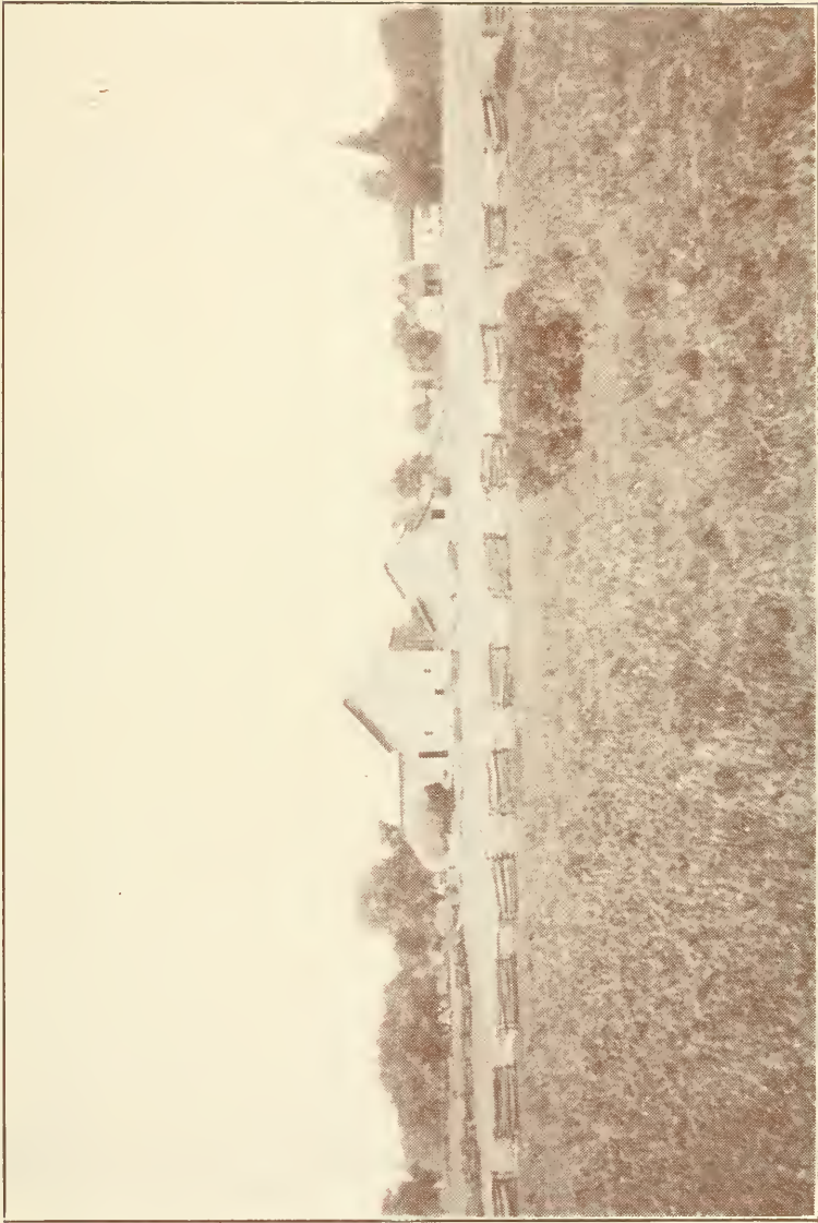
"In hot July."