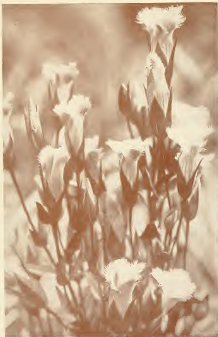
Blue Fringed Gentians. Photo by W. L. Pond In Conn.