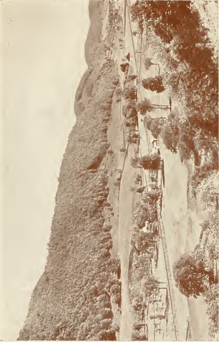
"O, the hills of old New England, rolling on 'neath summer skies." Deerfield, Mass.