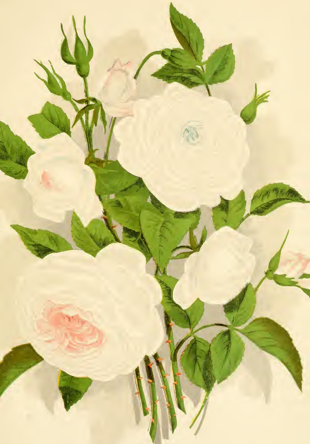
POLYANTHA ROSE —CLOTILDE SOUPERT.

A new class of Roses of dwarf habit, with small, very double, beautifully formed flowers : excellent for out door planting and pot culture.