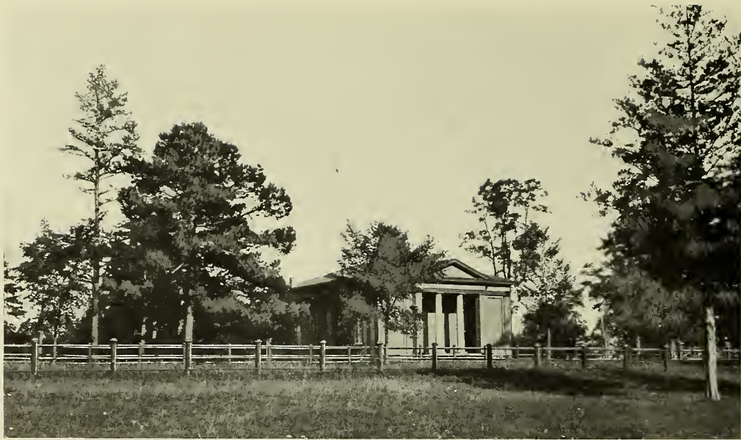
THE COLLEGE CHURCH