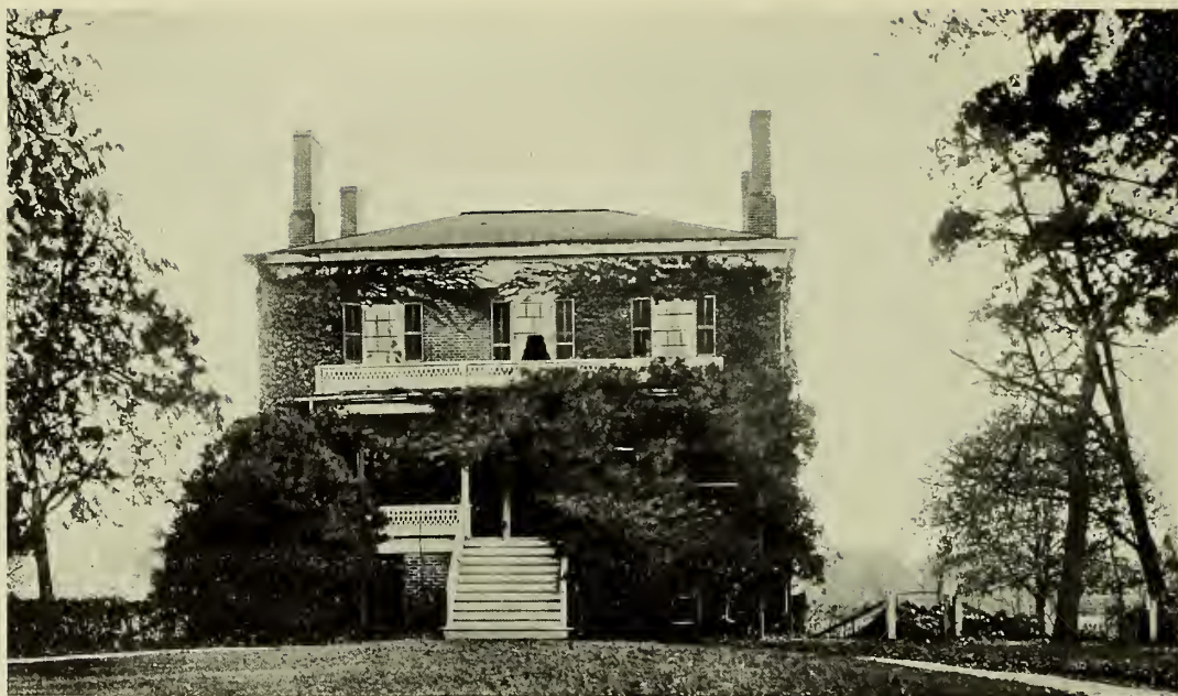
"PENSURST," RESIDENCE OF THE PRESIDENT