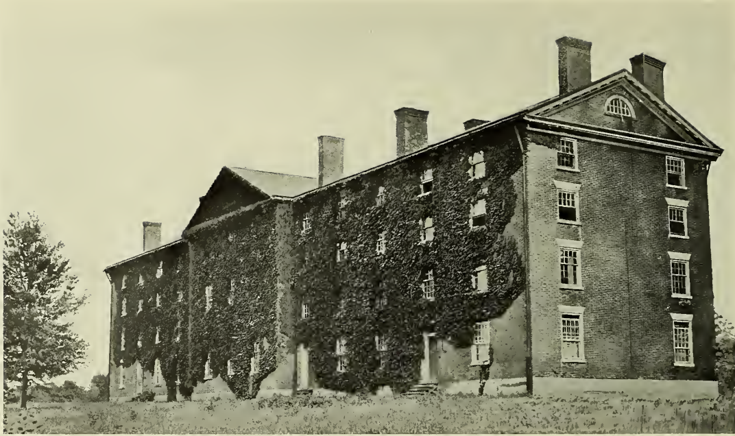
CUSHING HALL—NORTH VIEW