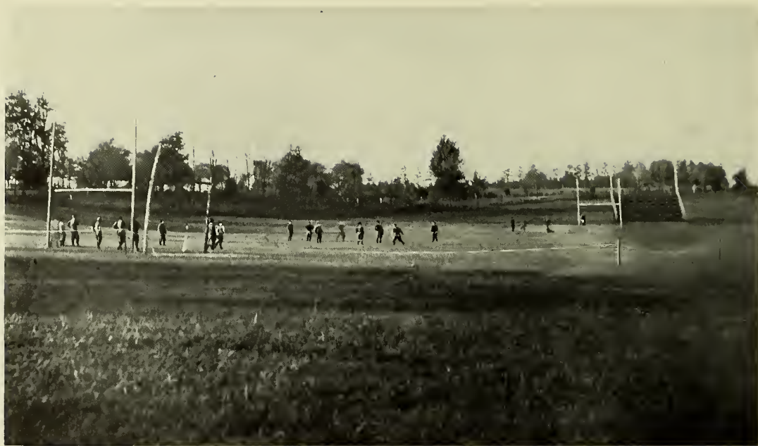
VENABLE ATHLETIC FIELD