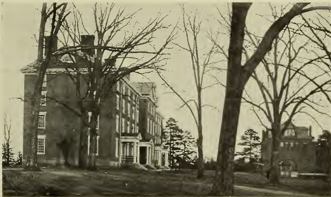
CUSHING HALL—LOOKING EAST