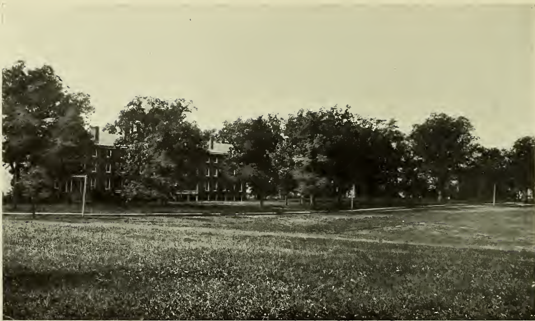
VENABLE HALL (THE SEMINARY)