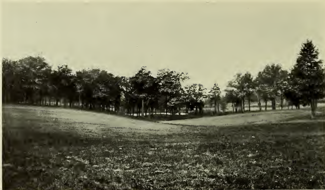
VIEW OF CAMPUS—LOOKING WEST