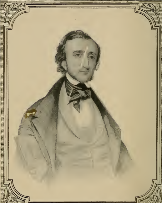
Edgar A. Poe.