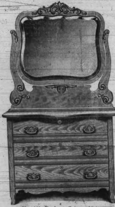
No. 411—Bedroom Suite, white enamel finish, 24x30 British bevel mirror, 2 pieces, $30.00 White enamel Iron and Brass Bedsteads will match above. A variety of other styles in 2-piece suites, in golden, antique and mahogany finish.