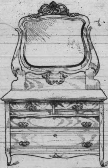
No. 123—Bedroom Suite, Birch, Golden finish, 24x30 British bevel mirror, 3 pieces, $35.00