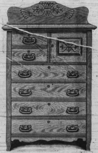
No. 6—Chiffonier, elm, antique finish, $14.00 No. 11—Chiffonier, similar to above with 12x20 mirror, $15.00. A great many styles in oak, birch, mahogany, etc., to match bedroom furniture.

We show over 50 different styles of 2 and 3 piece Bedroom Suites in all kinds of wood, in latest designs and finish, ranging in price from $15.00 to $190.00 Everything required to furnish a Bedroom in a cottage or mansion can be supplied by us.