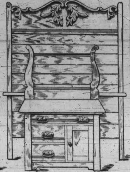
No. 10—Bedroom Suite, Oak, Antique or Golden finish, 22x28 British Bevel Mirror, 3 pieces ..... $35 Similar Suites, with 24x30 Oval British Bevel Mirrors, 3 pieces ..... $45