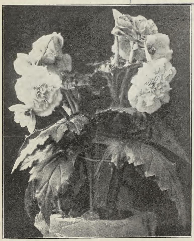
The above illustration shows one of our double white one-inch Begonia Bulbs growing in a five-inch pot.