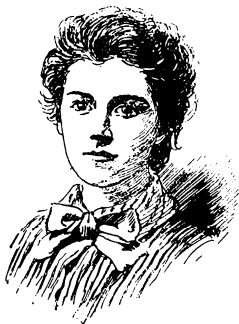
A HAMPSHIRE GIRL

types, as there are two in the blonde, and it will be understood that I only mean two that are, in a measure, fixed and easily recognised types; for it must always be borne in mind that, outside of these distinctive forms, there is a heterogeneous crowd of persons of all shades and shapes of face and of great variety in features. These two dark types are: