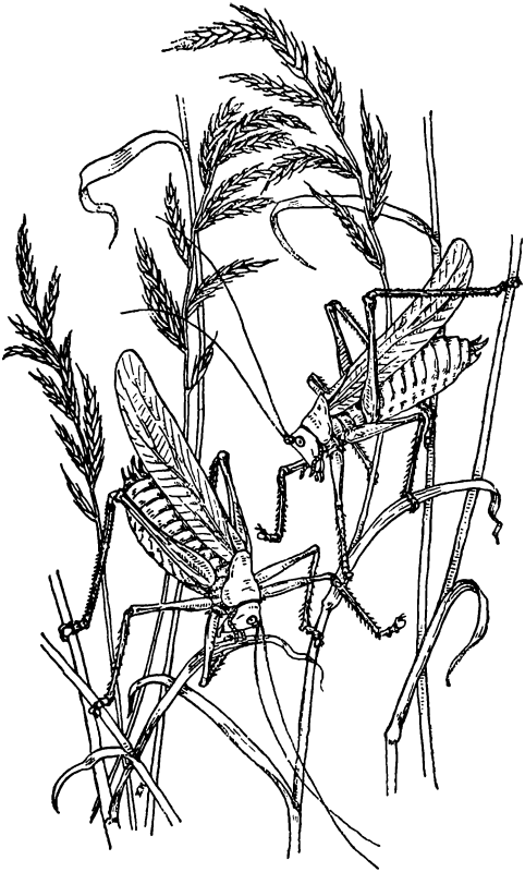
RIVAL GREAT GREEN GRASSHOPPERS