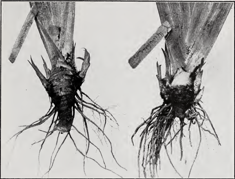
No. 1 Size "Mother Bulbs". You get the whole plant.