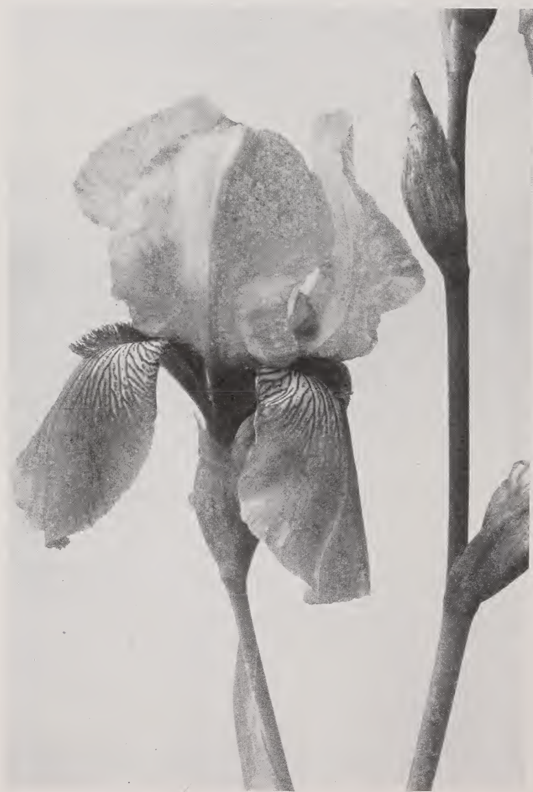
"MERLIN" An extraordinary, very showy and floriferous "Sturtevant" creation.