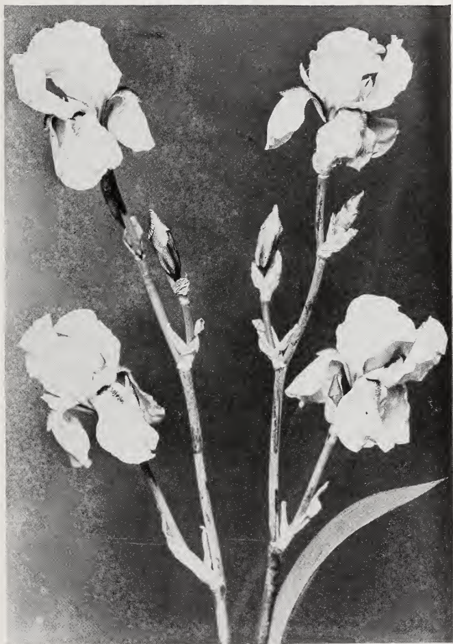
Lovely Iris "DREAM"