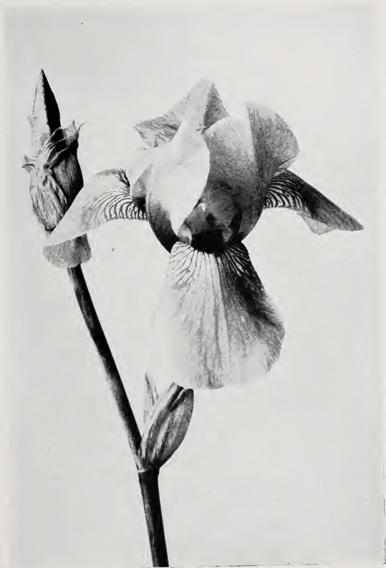
"SINDJKHAT." An extra fine "Sturtevant" creation.