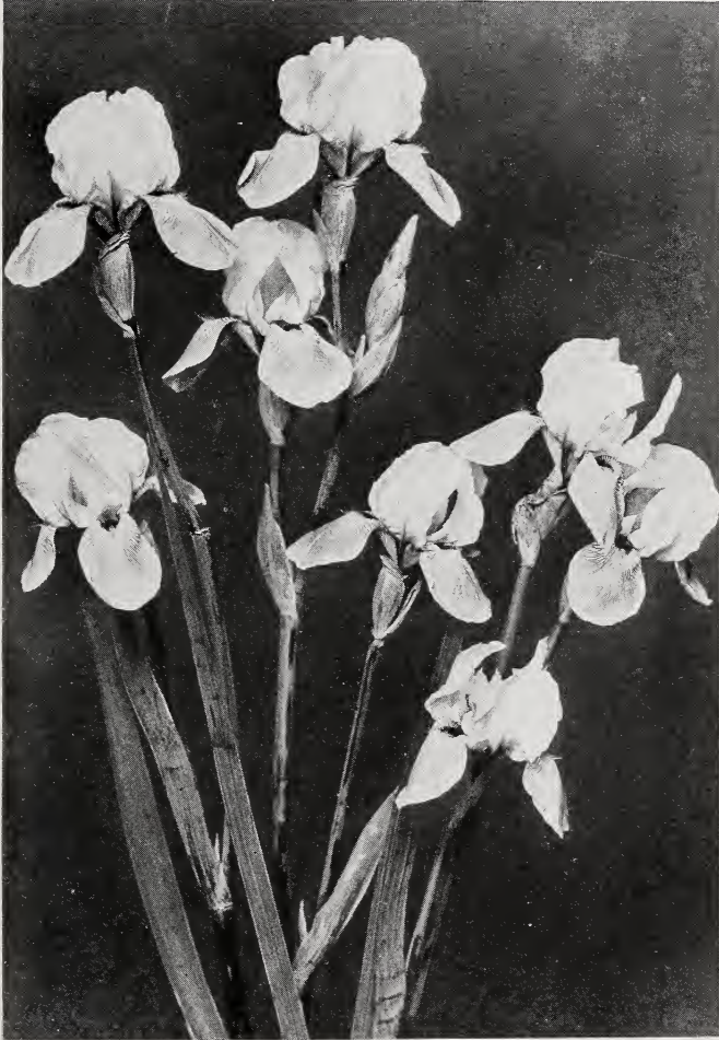
Charming "RHEIN NIXE"