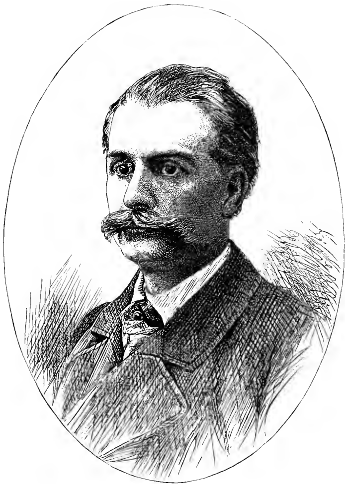
J. W. De FOREST, (Author of "Overland," etc.)