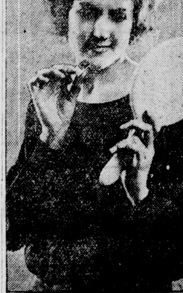
Never let the lips chap

Clare.—There are too many uses for toilet water to print in this small space. You can spray it on the face as an astringent, pour it into the bath water to perfume it, use it as perfume, or rub it over your skin after a bath. Anxious — Your complexion