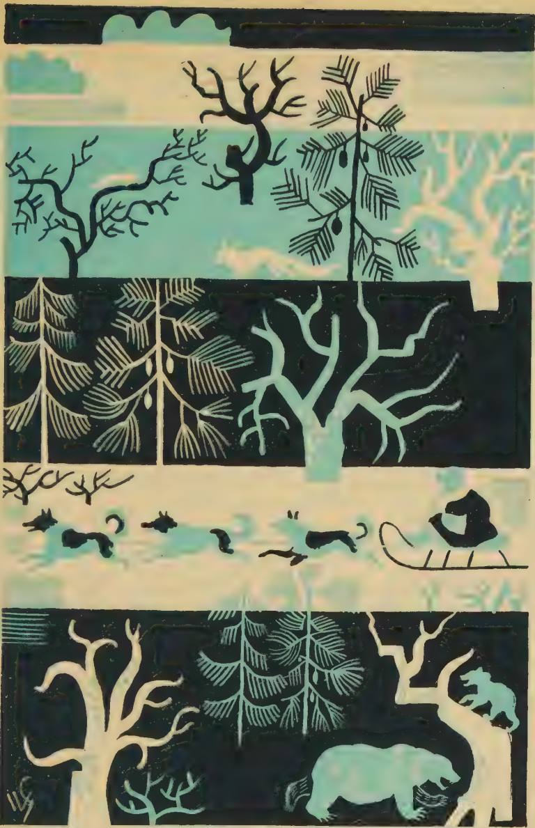
THE LAND OF DARKNESS