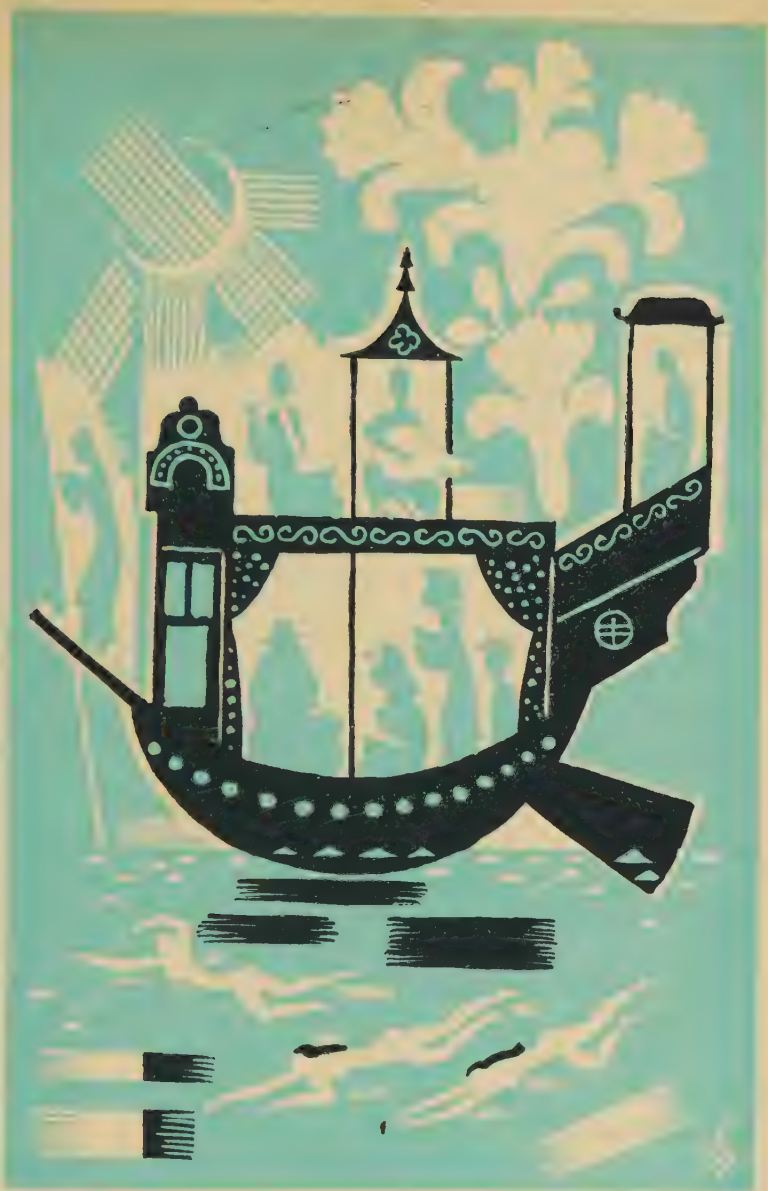
THE PLEASURE BOAT