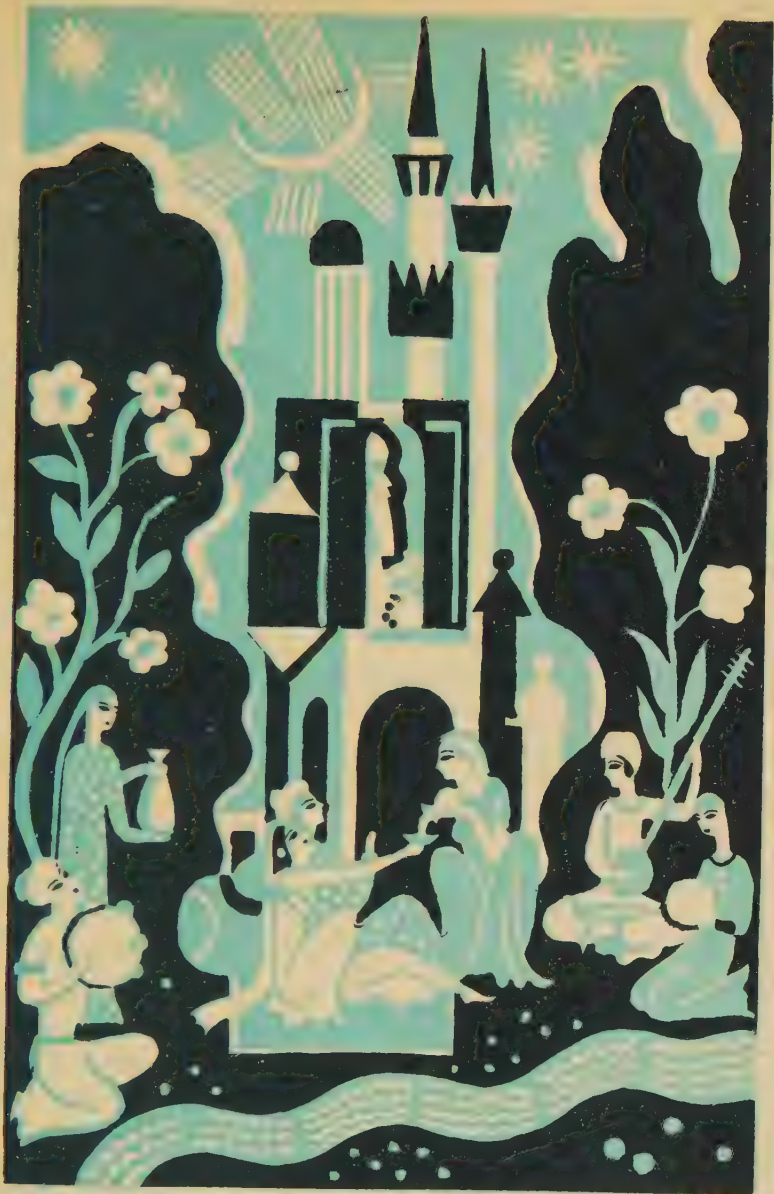
THE OLD MAN OF THE MOUNTAIN