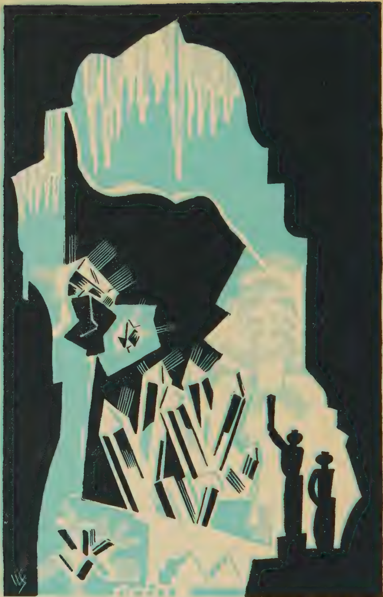
THE PRECIOUS STONES OF BALASHAN