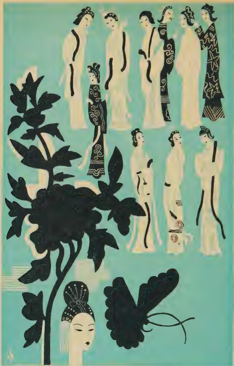
THE WIVES OF KUBLAI KHAN