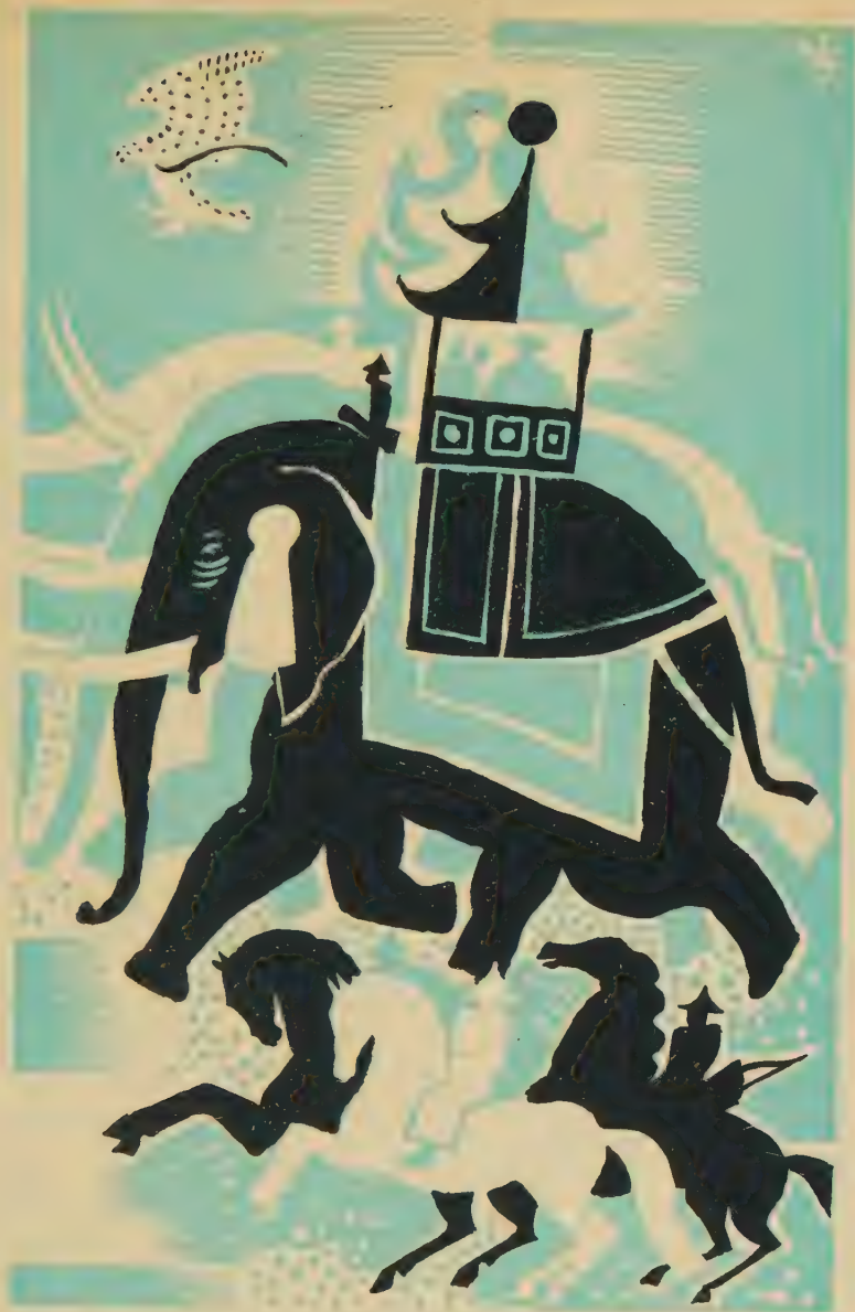
T H E H U N T