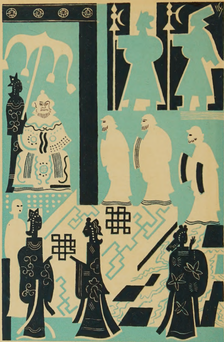
THE COURT OF KUBLAI KHAN