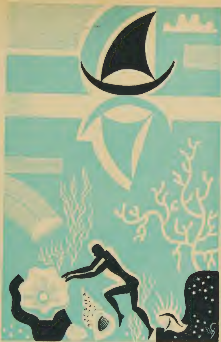
THE PEARLS OF MAABAR