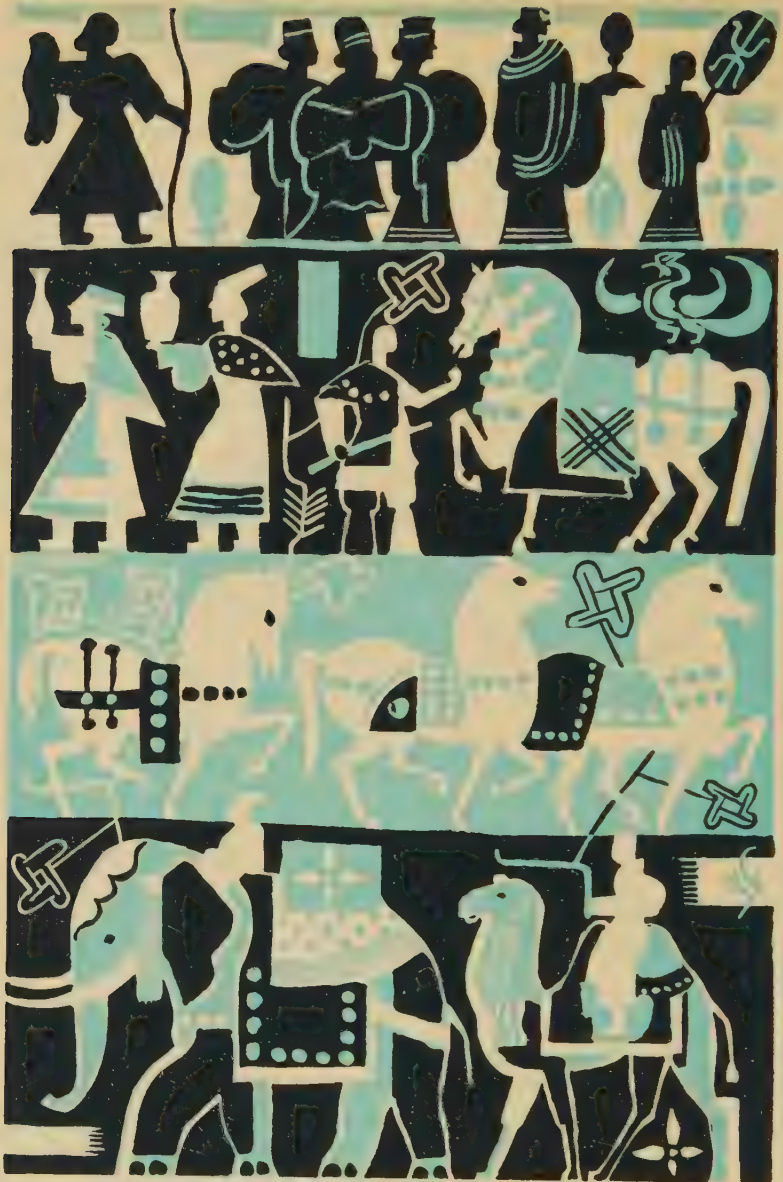
THE WHITE FEAST