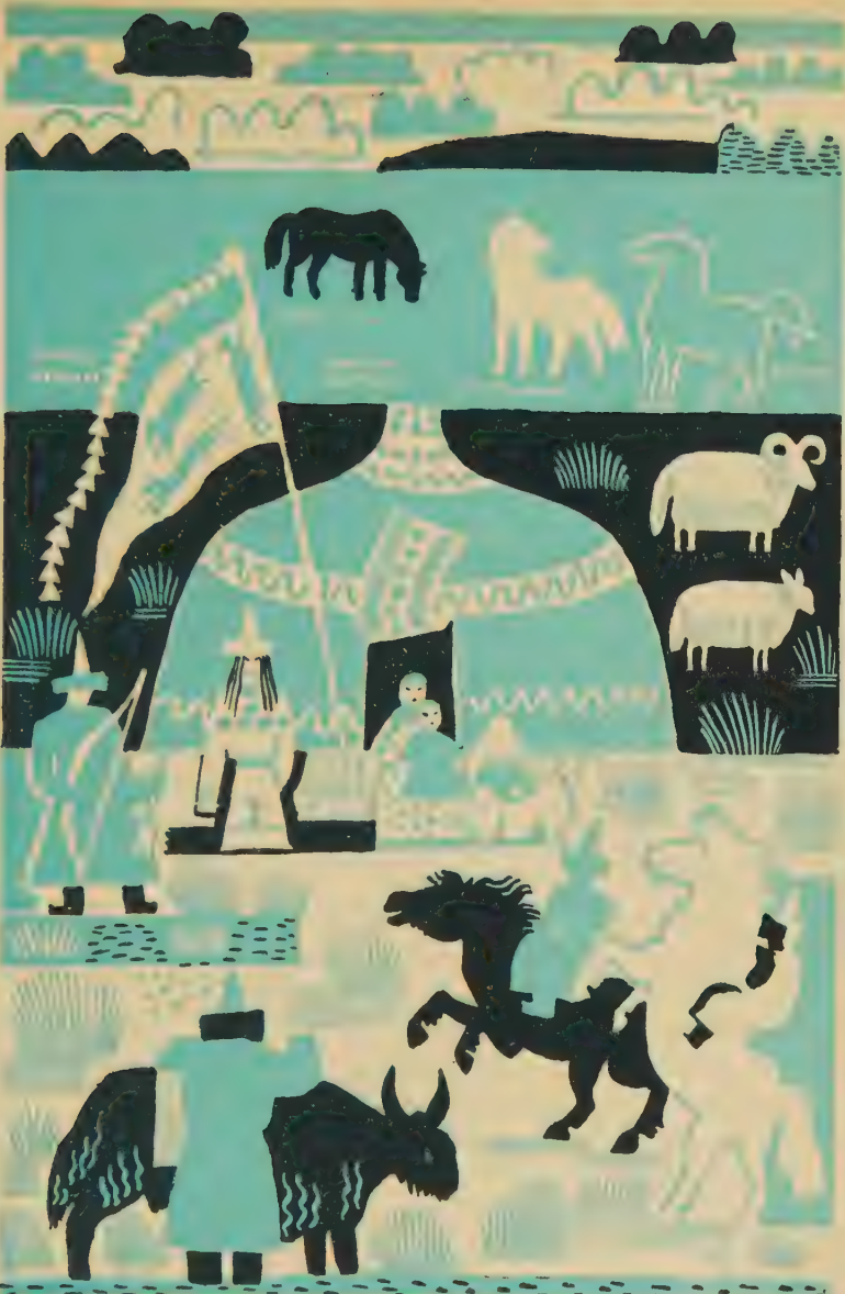
T H E T A R T A R S