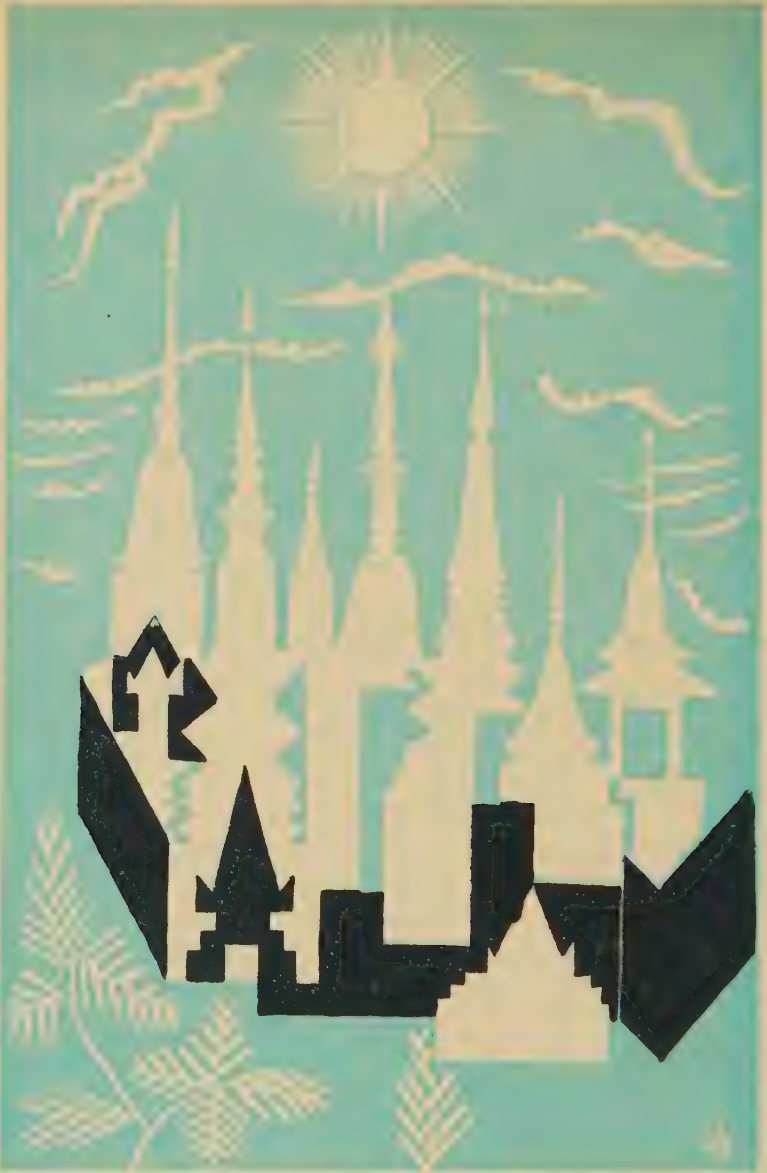
THE CITY OF MIEN