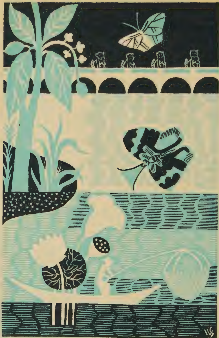
THE BRIDGE OF PULISANGEN