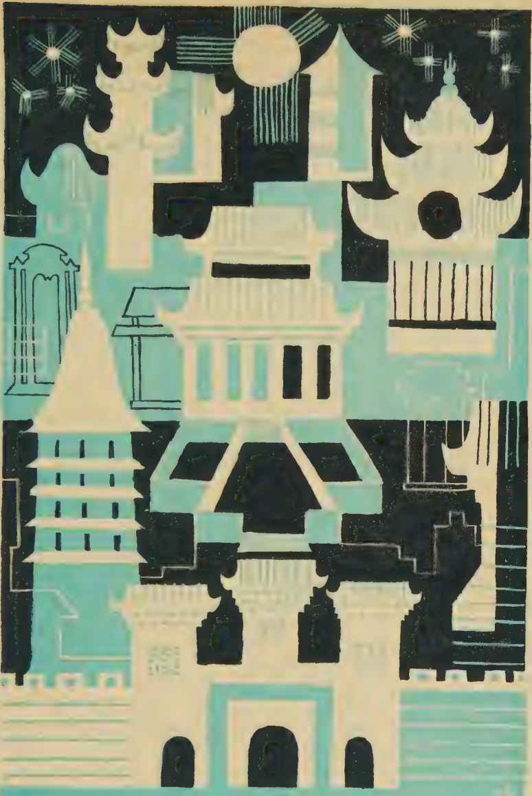
THE PALACE OF KUBLAI KHAN