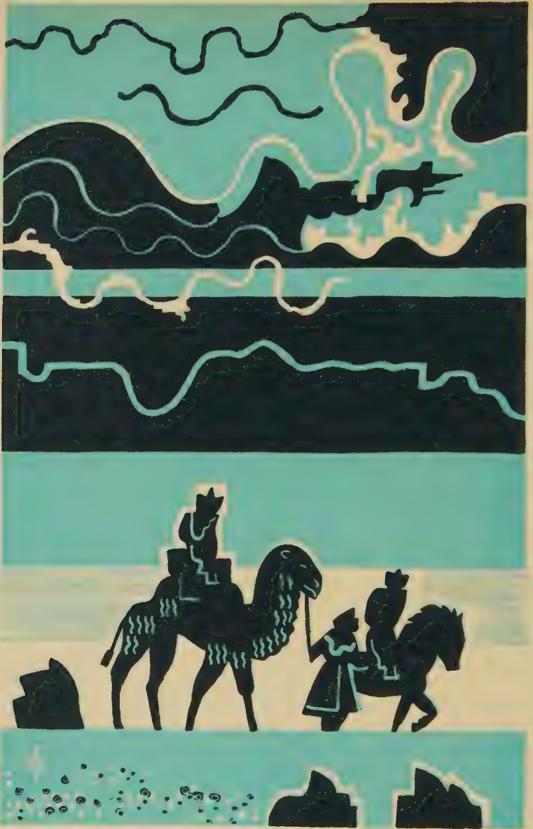
THE DESERT OF LOP