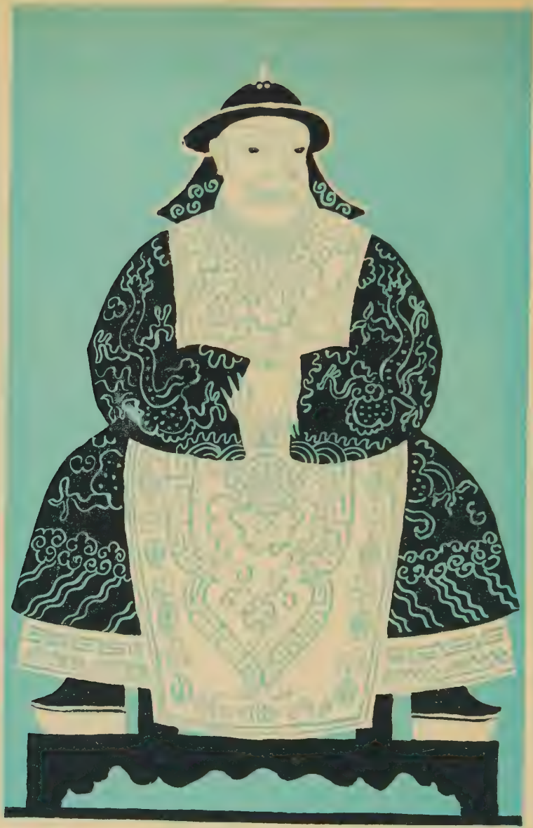
K U B L A I K H A N