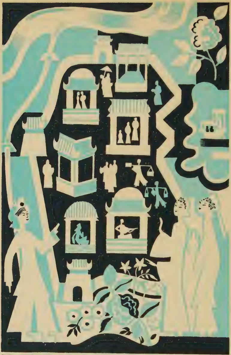
THE CITY OF KINSAI