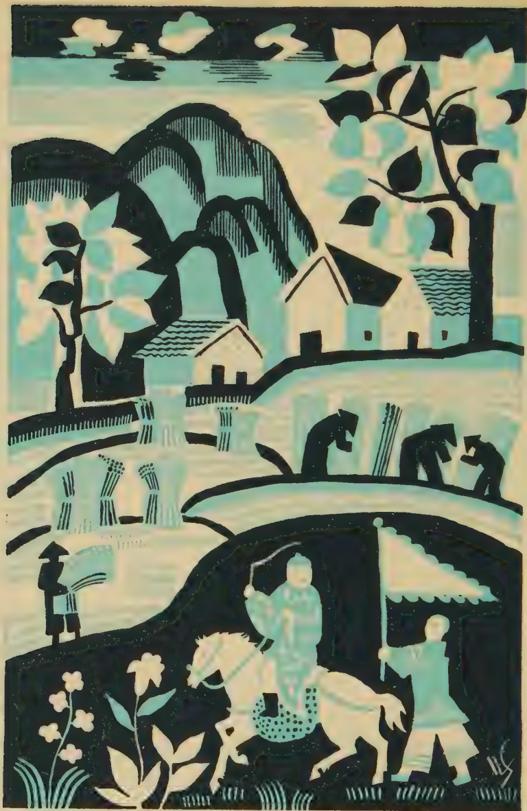
AN AGRICULTURAL COMMISSIONER.