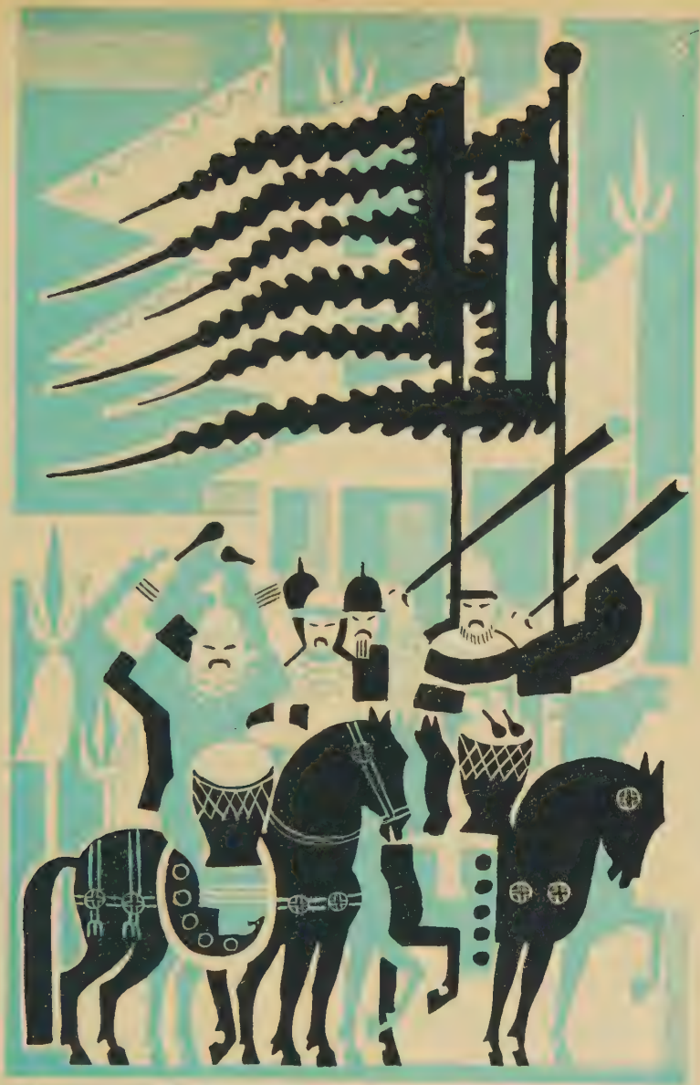
THE DRUMS OF KUBLAI KHAN