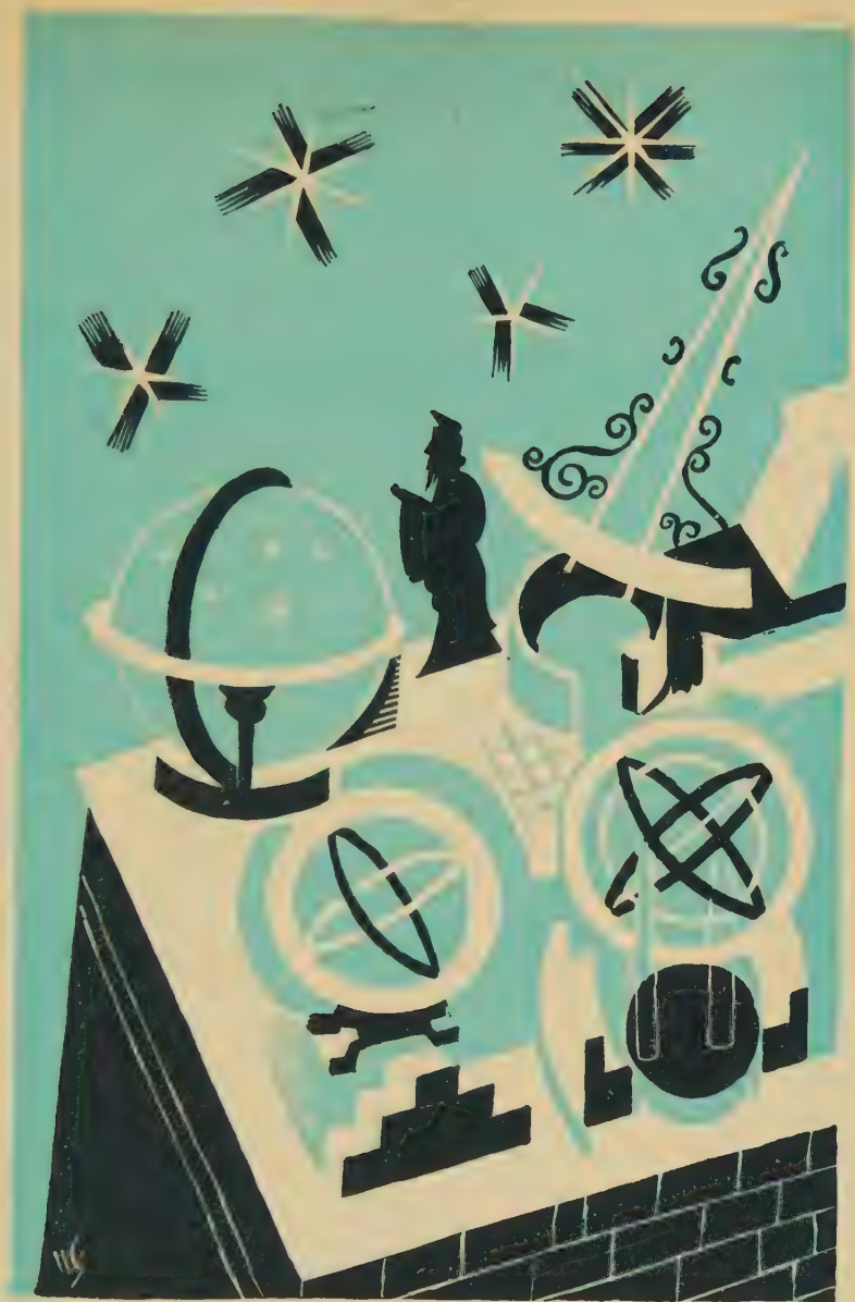
THE OBSERVATORY OF PEKING