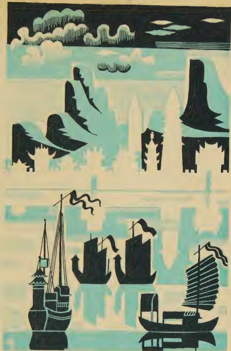
THE RIVER KARAMORAN