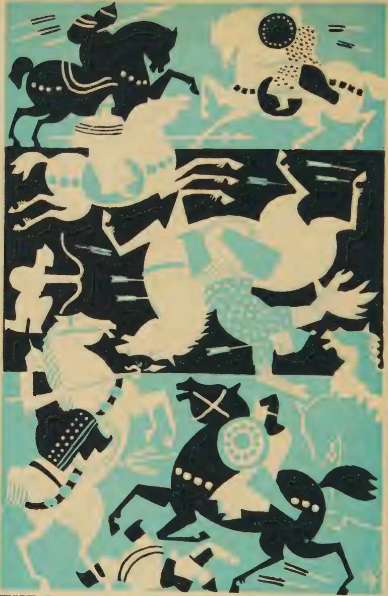
THE BATTLE BETWEEN ARGON AND ACOMAT