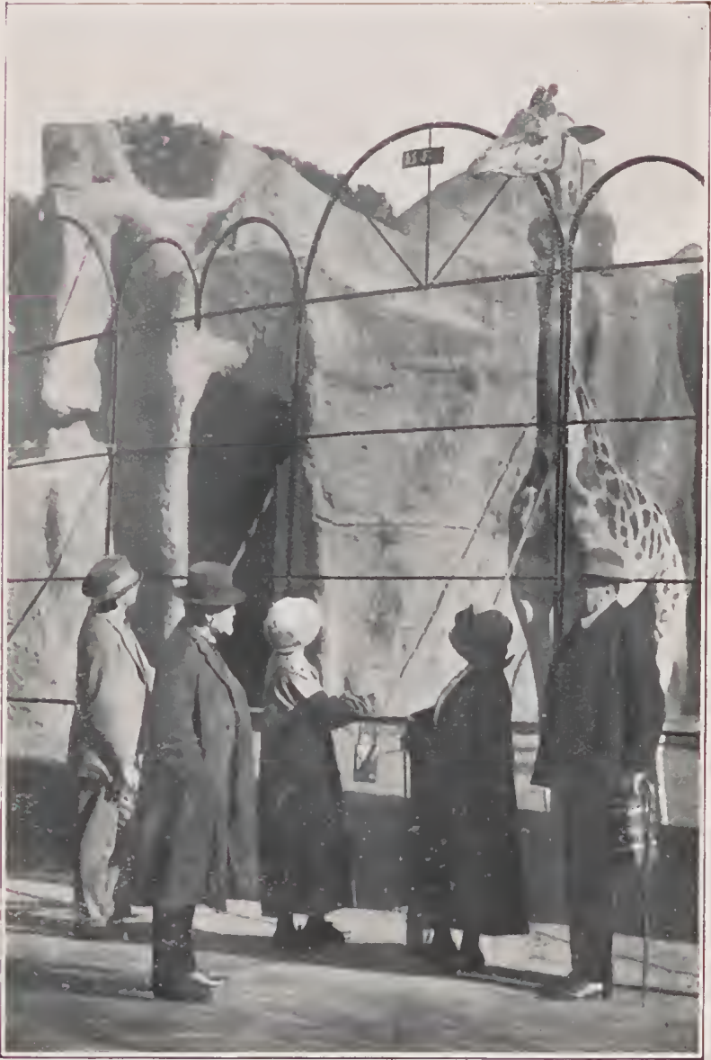
GIRAFFE (15 ft. in height)