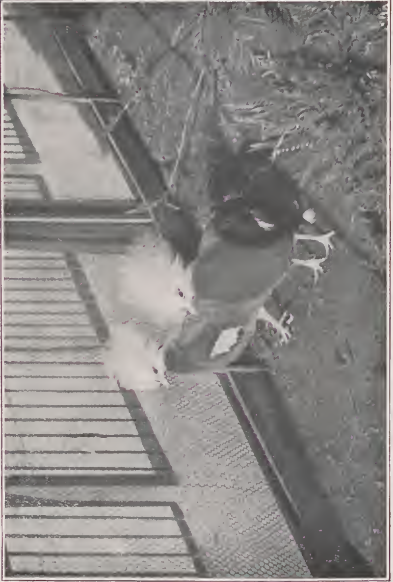
CROWNED GOURA PIGEON, New Guinea.