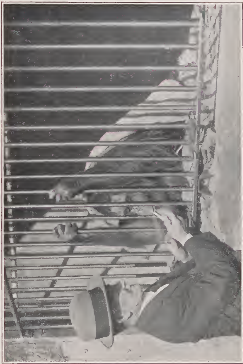
OURANG OUIANG (Mollie)