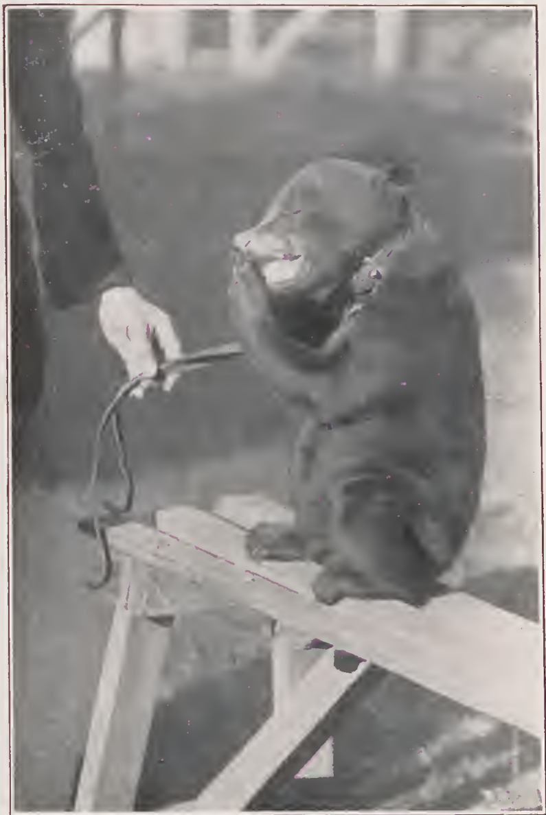
YOUNG MALAYAN BEAR.