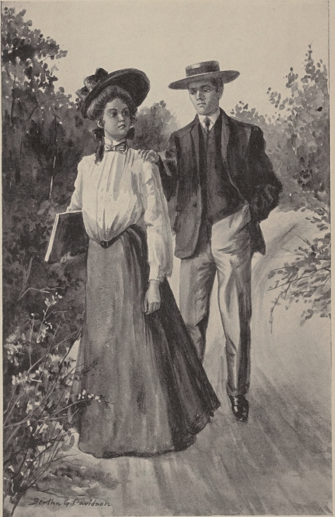
A heavy hand clutched her shoulder fiercely. — Page 185.