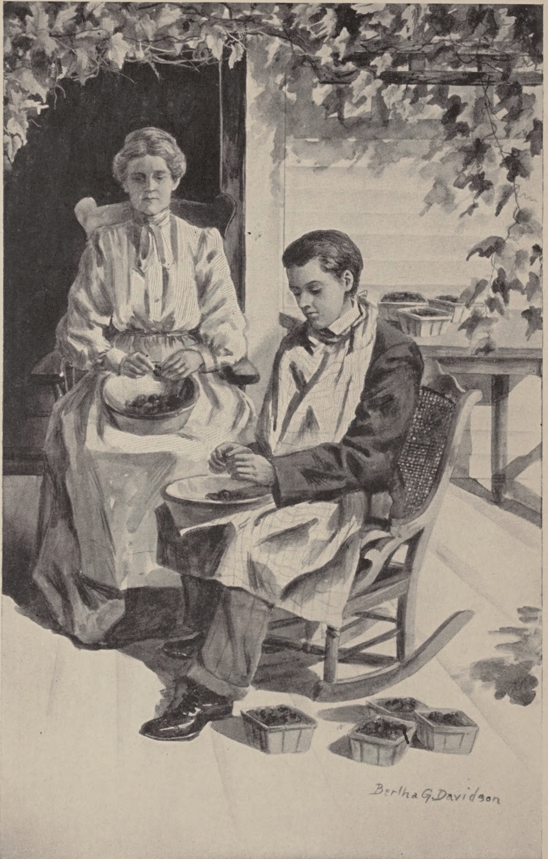
Seated in a child's rocking-chair, a gingham apron tied under his chin. — Page 38.