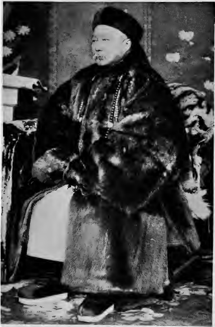
KANG, THE REFORMER