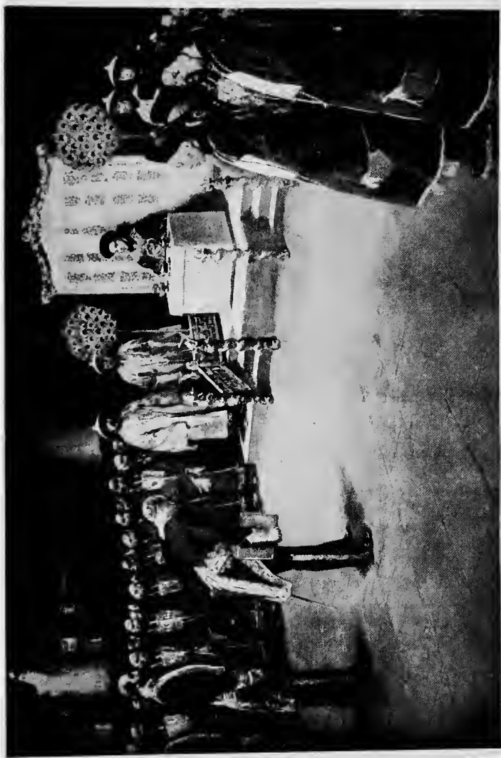
THE EMPEROR RECEIVING THE DIPLOMATIC CORPS